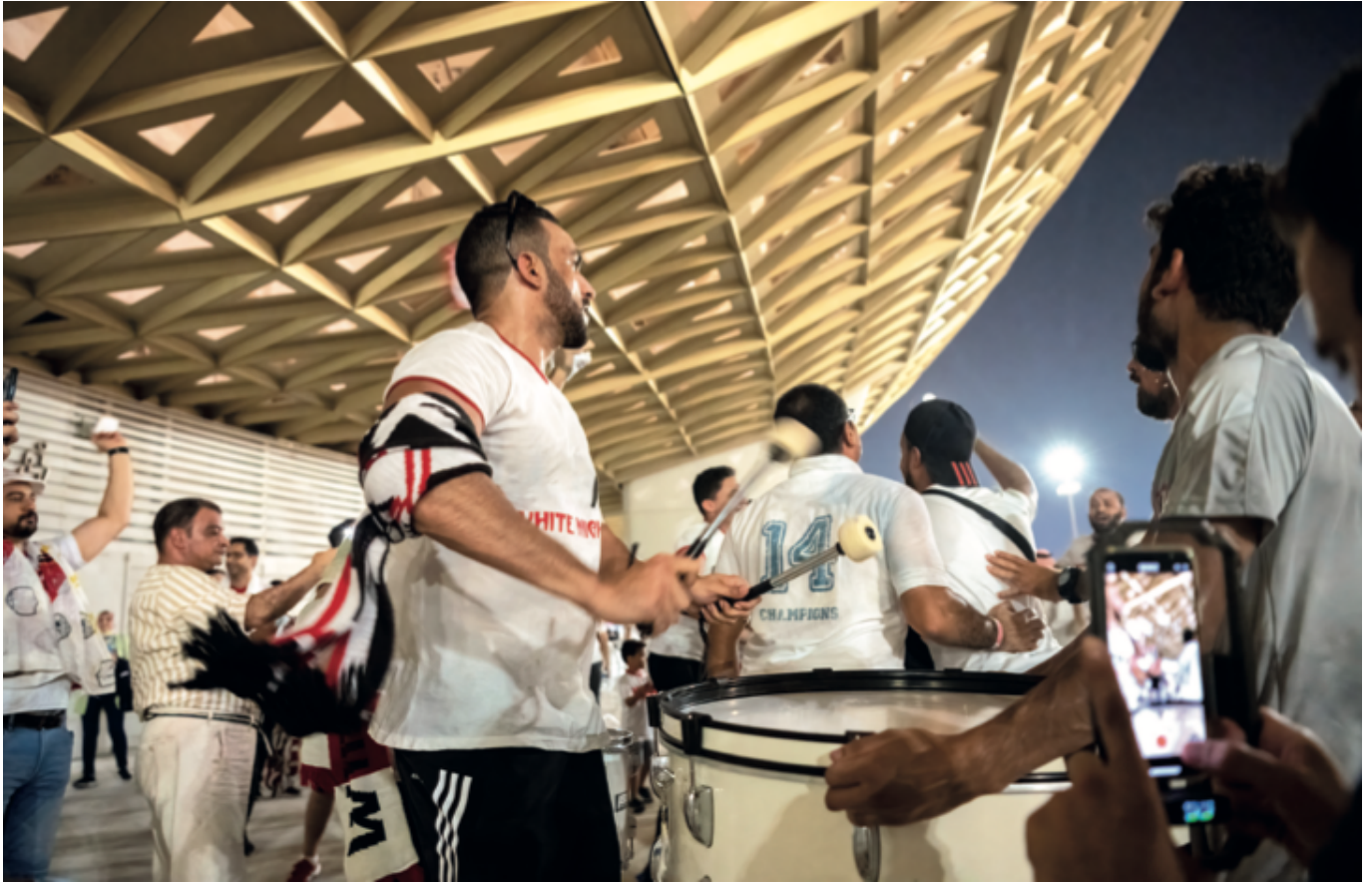
The stadium hosted the Lusail Super Cup final.