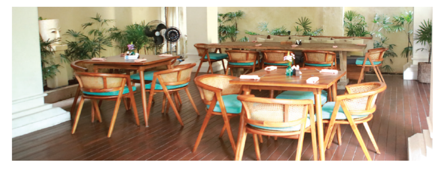
The open reception and lobby area reserved for dining purposes.