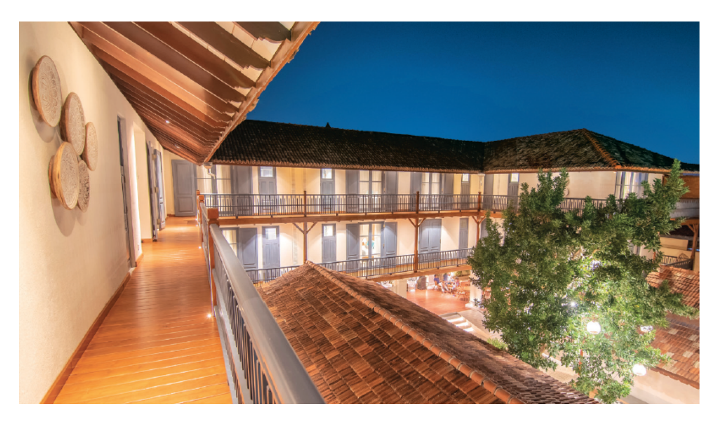
The rooms located along open-air communal terraces overlooking a courtyard.

The private balconies offer splendid views across the terrain, the tiled roofs, and the ocean peeking through. At the same time, it's the ultimate restful place to indulge in inactivity, sipping a drink while taking in the echoes of a privileged neighborhood. The good thing is that guests can enjoy privacy inside a buzzing fort at Mer.chant Hotel, as the trees at the entrance shield visitors from the road while giving them the best surrounding views. From the charming beauty of the hotel to the comfort of the rooms to lying down on the smooth beds, the experience is delightful.