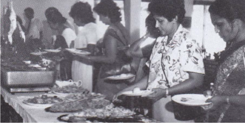
The Meriviere's Restaurant serves a sumptuous Sunday buffet.