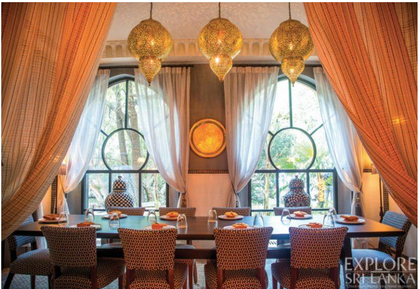
The elegant interior of the dining area

business in the country have proved to be likeminded partners for Ministry of Crab. This was a result of the owners' keen attention to detail and drive to ensure a special experience for all their customers across their portfolio of nine restaurants. The Barbarossa Restaurant & Lounge is a three floored Moroccan-style building with unique interiors, built across a large pond.