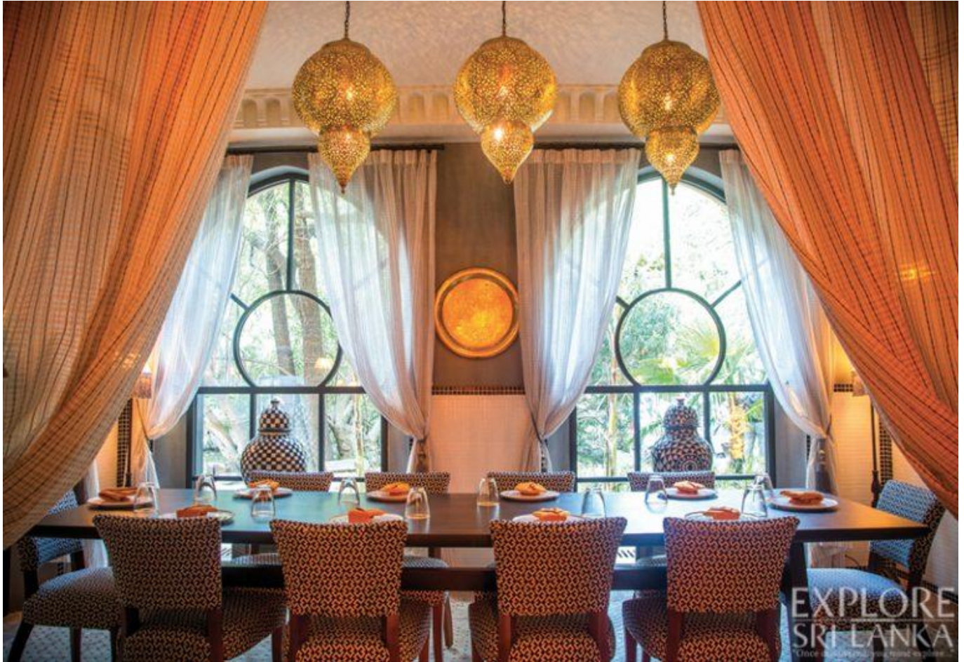
The elegant interior of the dining area