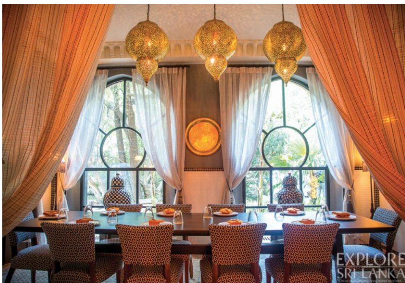
The elegant interior of the dining area

The Shanghai based Barbarossa Group, whose philosophy is to create a distinction in the gastronomic landscape of China by bringing in new and exciting brands to develop the F&B business in the country have proved to be likeminded partners for Ministry of Crab. This was a result of the owners' keen attention to detail and drive to ensure a special experience for all their customers across their portfolio of nine restaurants. The Barbarossa Restaurant & Lounge is a three floored Moroccan-style building with unique interiors, built across a large pond.