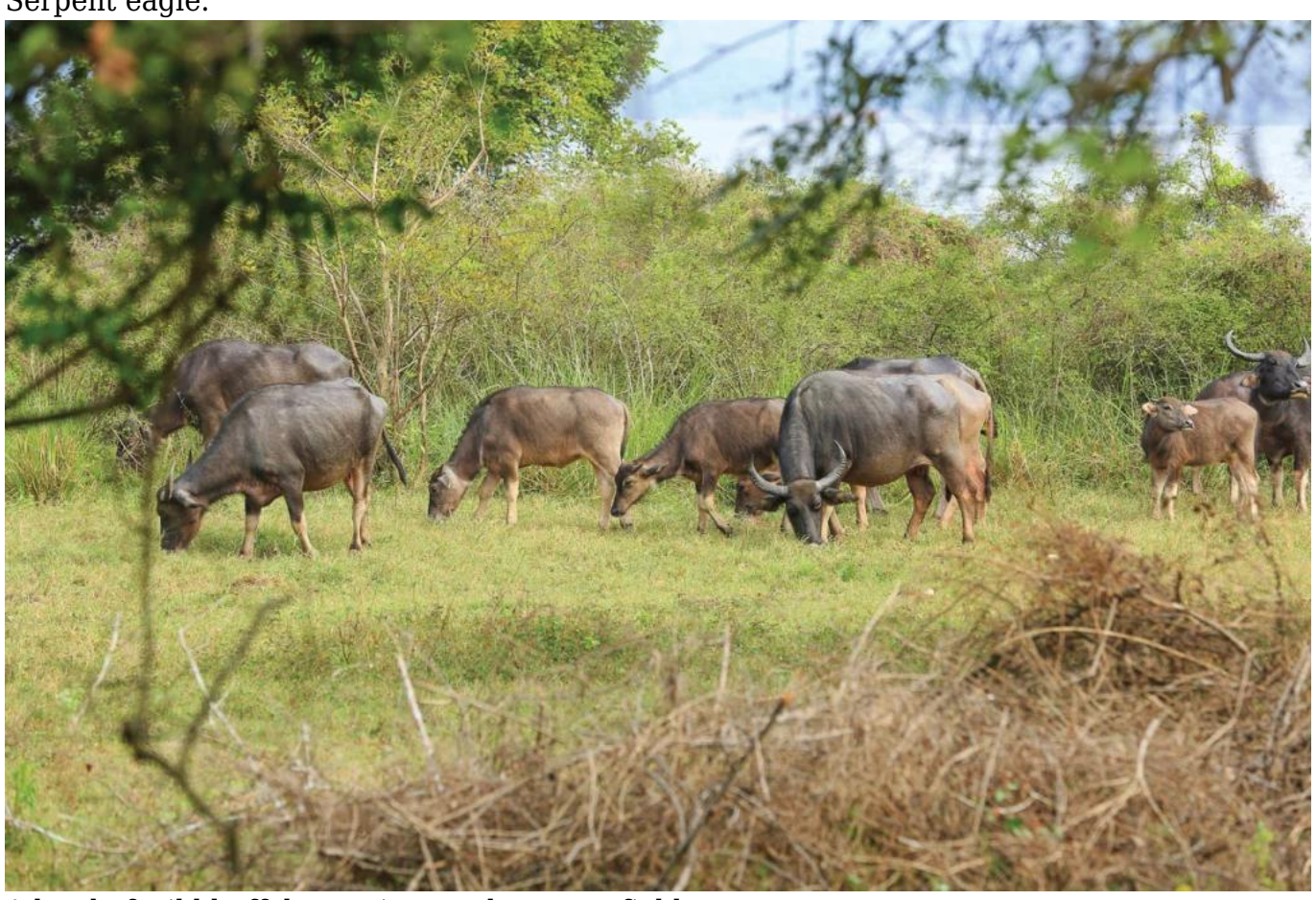
A herd of wild buffalo grazing on the green fields.