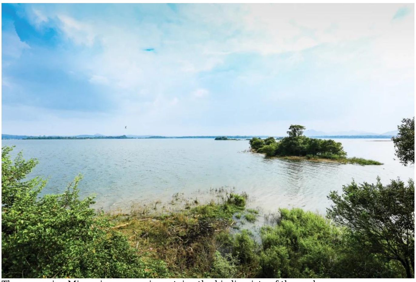
The expansive Minneriya reservoir sustains the biodiveristy of the park.