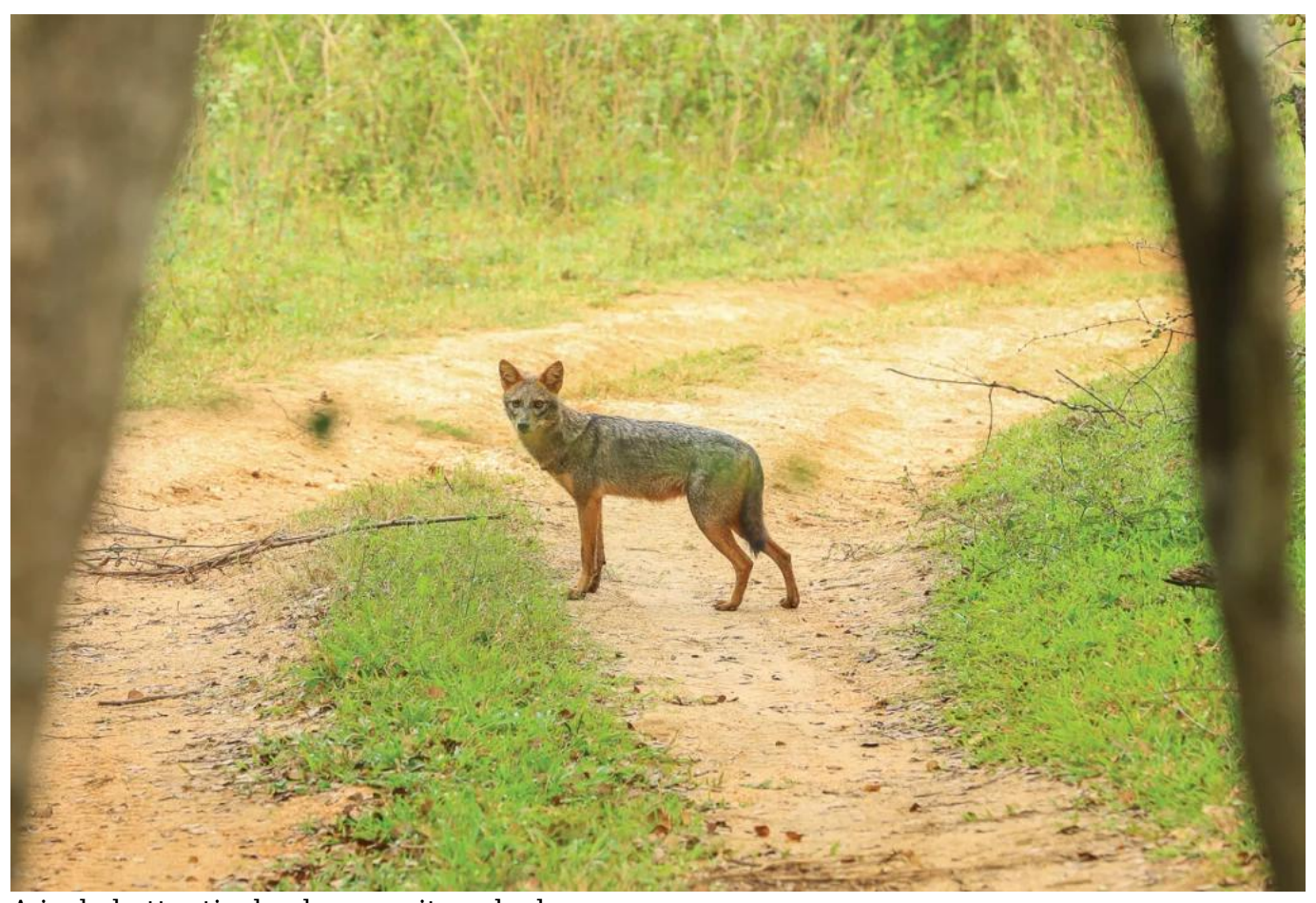
A jackal attentively observes its onlookers.