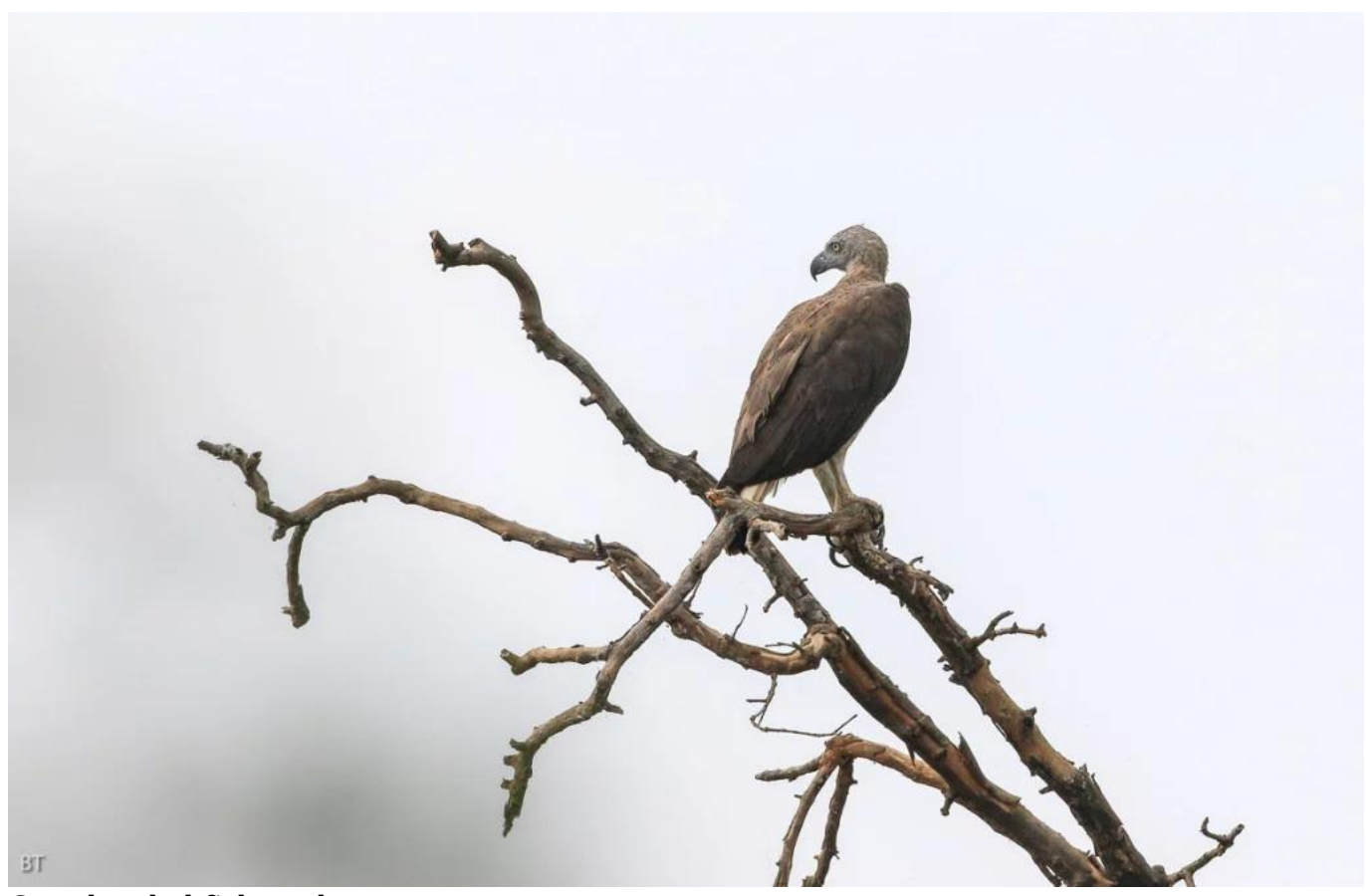
Grey-headed fish eagle.