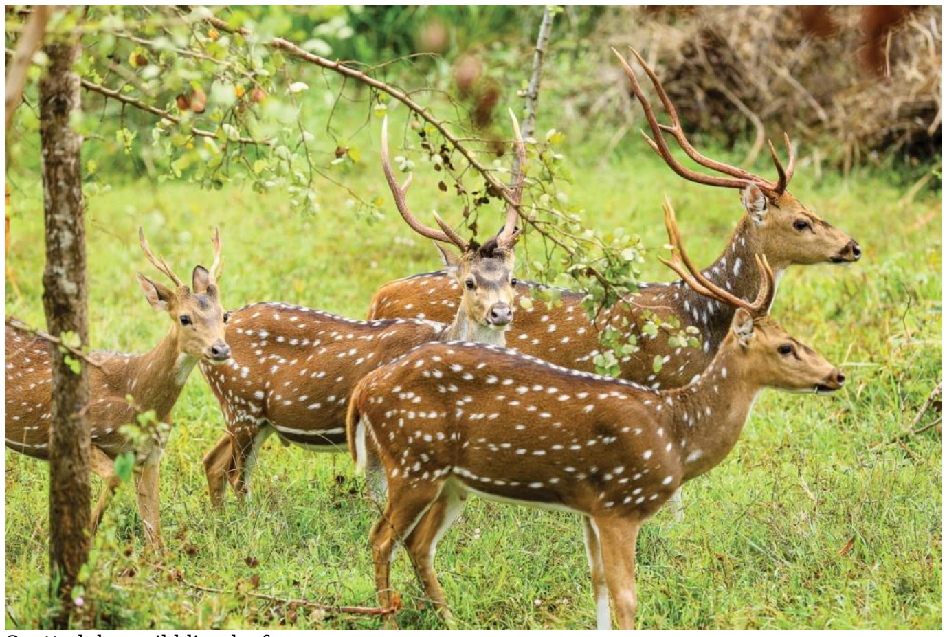
Spotted deer nibbling leafy greens.