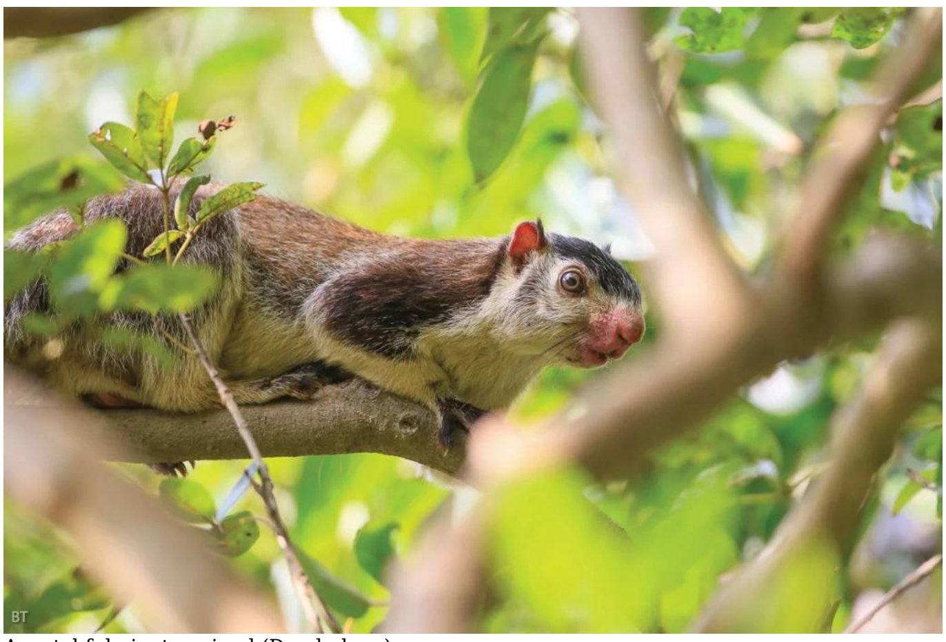
A watchful giant squirrel (Dandu lena).