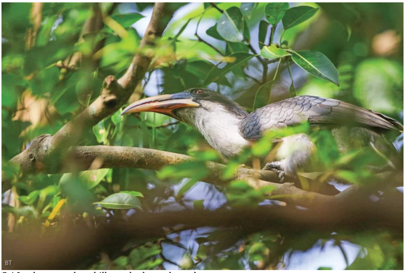
Sri Lankan grey hornbill perched on a branch.