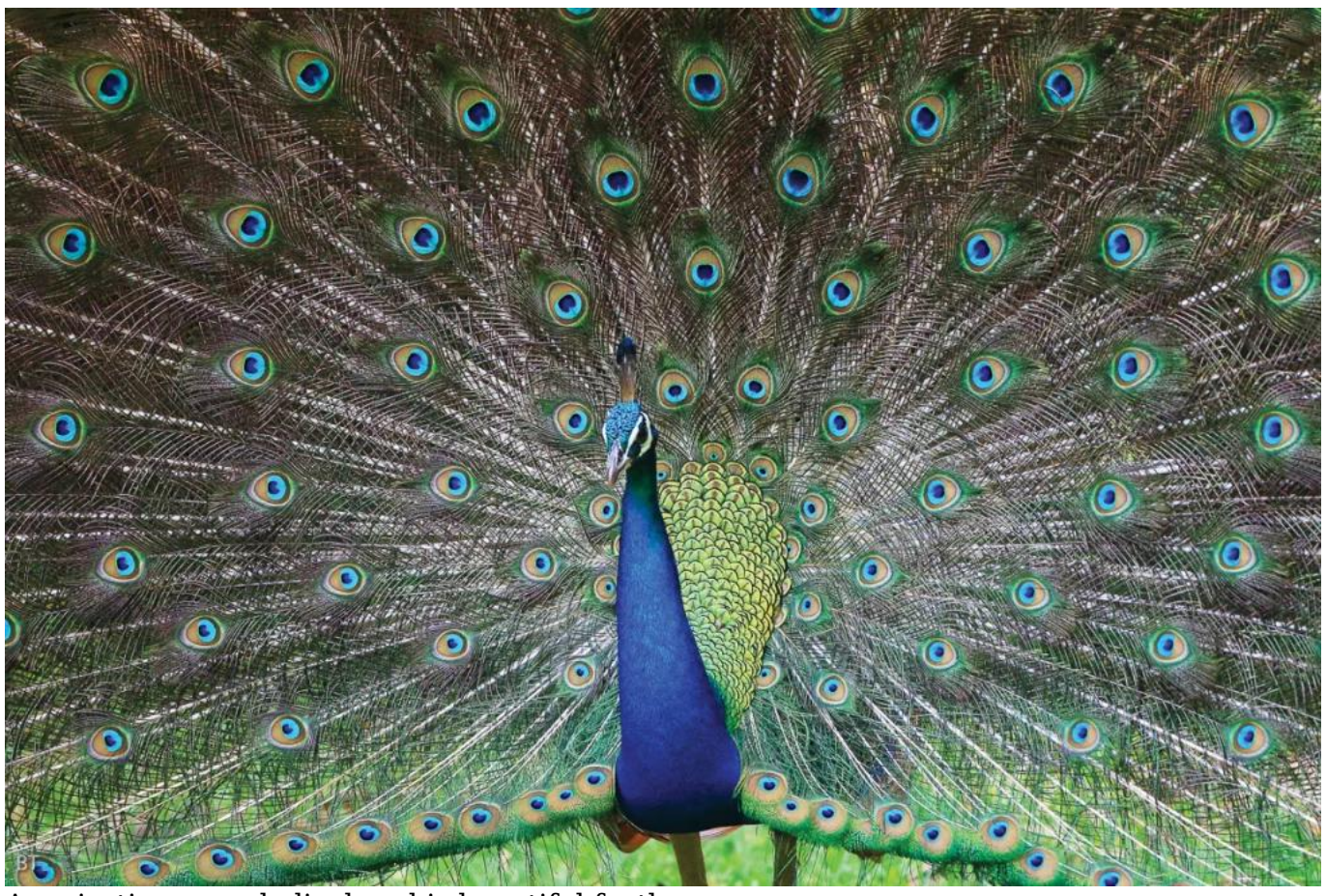
A majestic peacock displays his beautiful feathers.