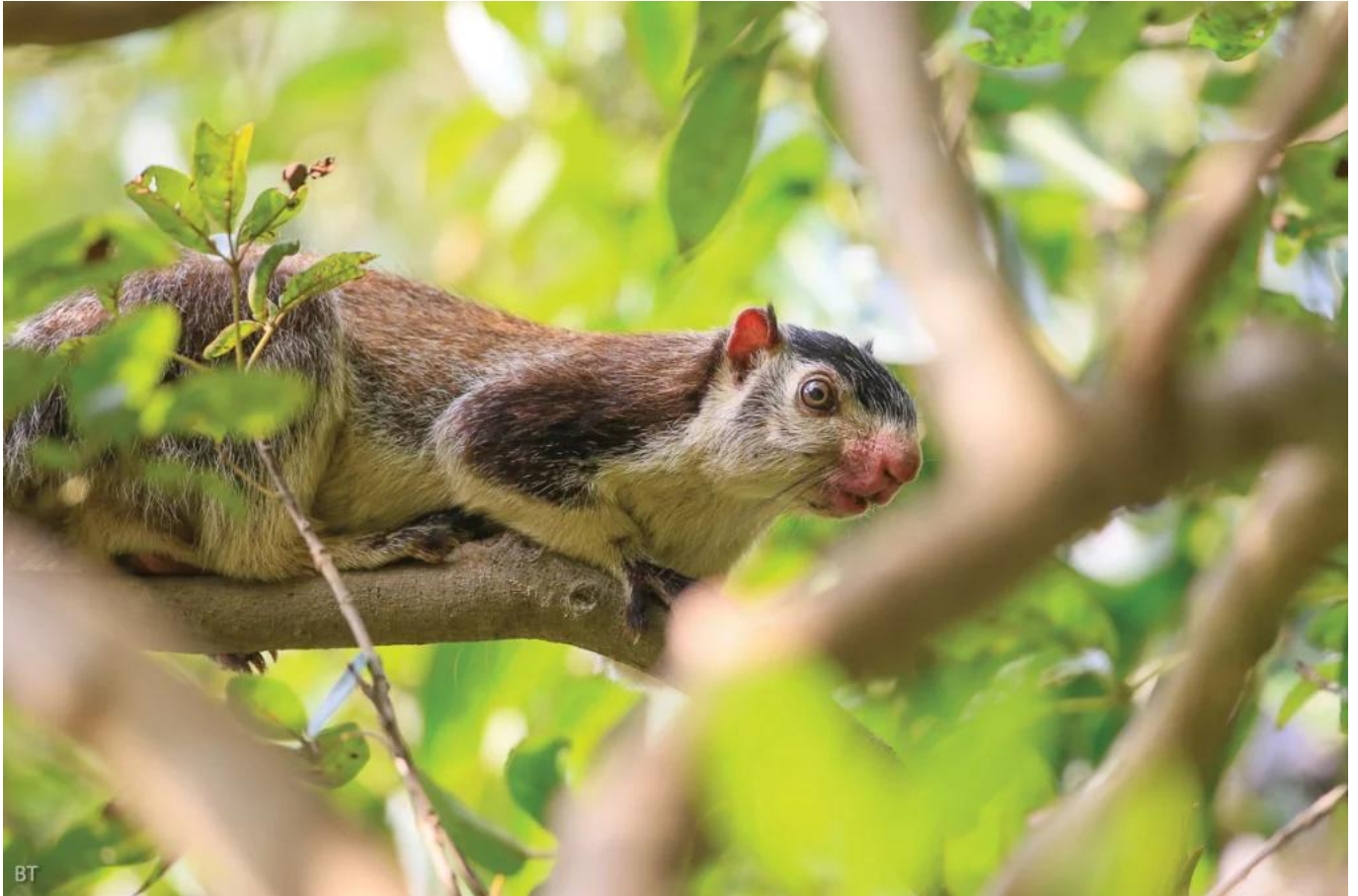
A watchful giant squirrel (Dandu lena).