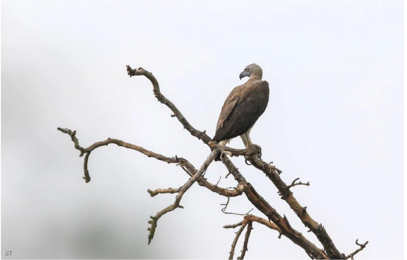
Grey-headed fish eagle.