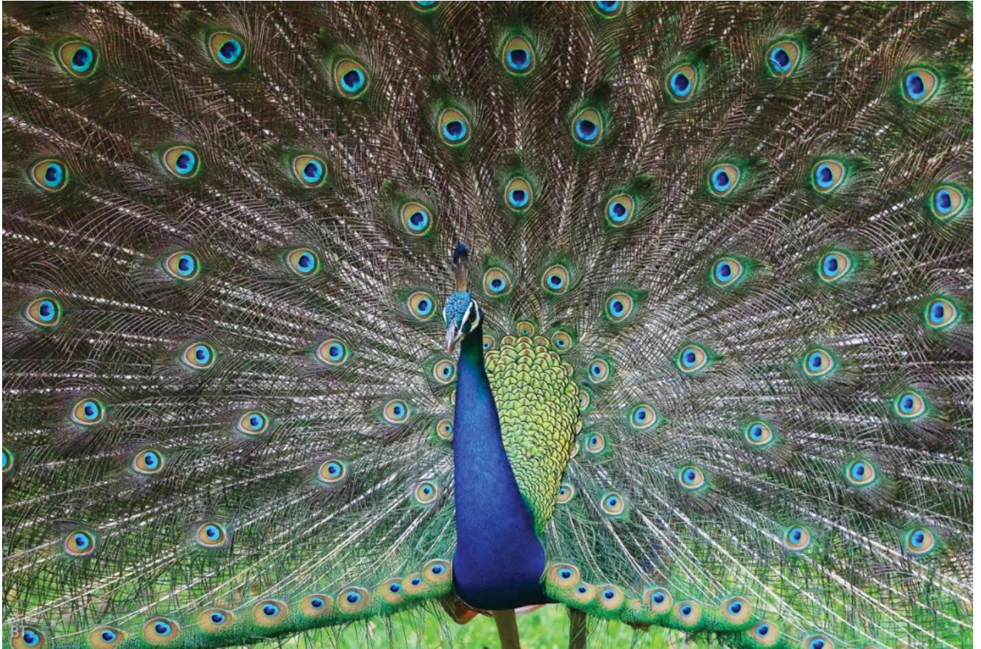
A majestic peacock displays his beautiful feathers.