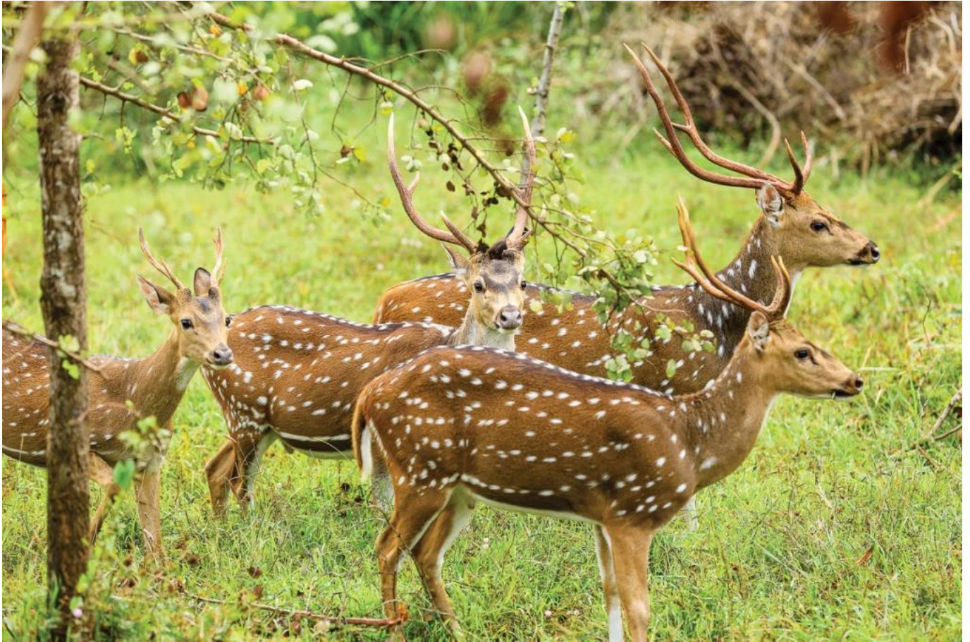
Spotted deer nibbling leafy greens.