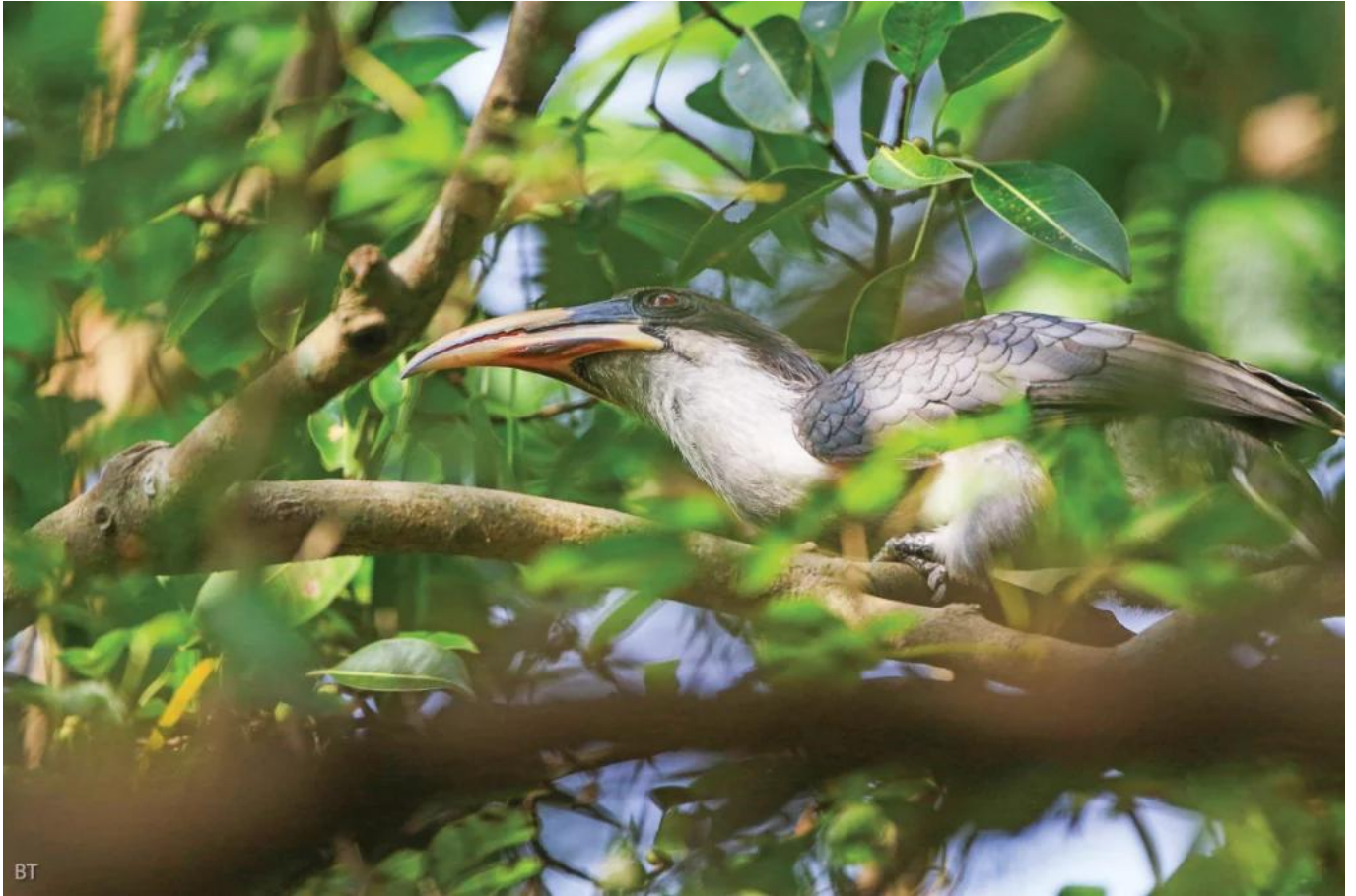
Sri Lankan grey hornbill perched on a branch.