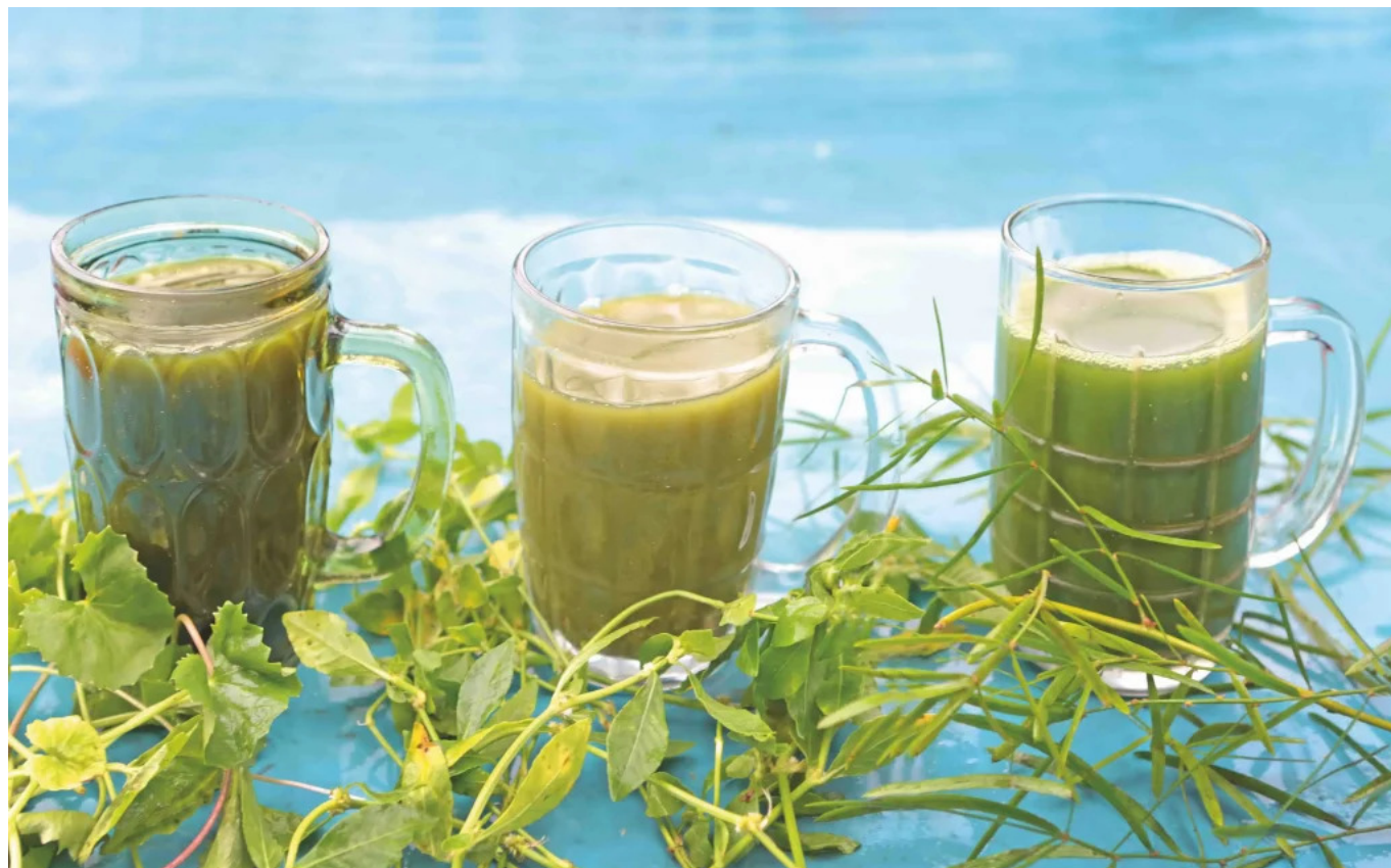
Gotu Kola, Mukunuwenna and Hathawariya kenda.

Most Sri Lankans gulp down a morning mug of Kenda, a veritable magic potion that gives the drinker strength to face the day.