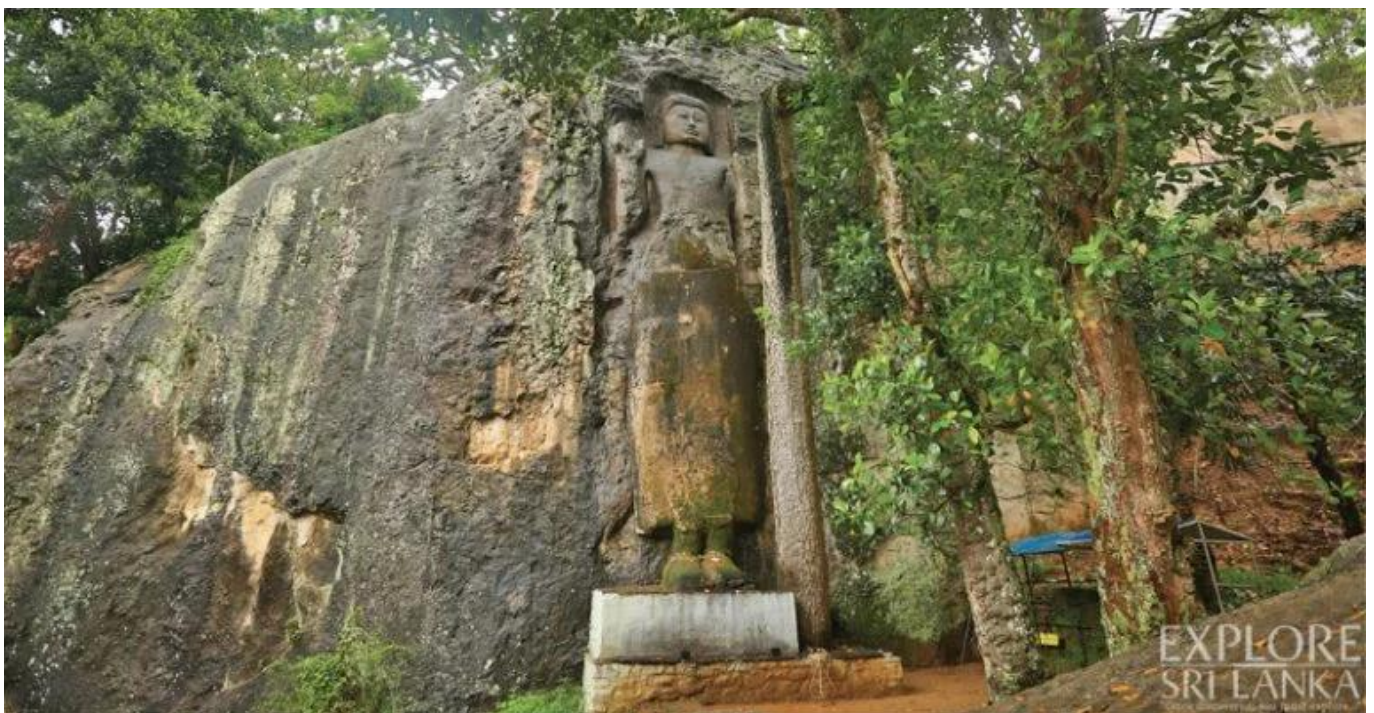
The 39-ft carving of the Buddha

As you first enter the temple, you are immediately awed by the beautiful paintings on the cave surface and the colourful statues. The magnetic Makara Thorana as well as the murals on the walls are beautifully preserved. Though it is said that the construction of the temple was started during the Anuradhapura period, it was completed in the Kandyan period.