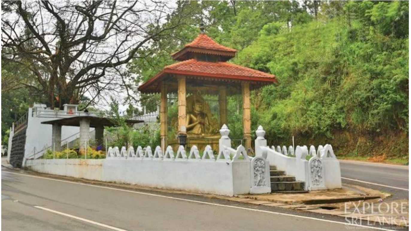
The golden Buddha statue of the Dowa Temple on the Badulla-Bandarawela Road

The soothing sounds of gushing water reached us as the rock outcrop of the historic Dowa Temple came into view.