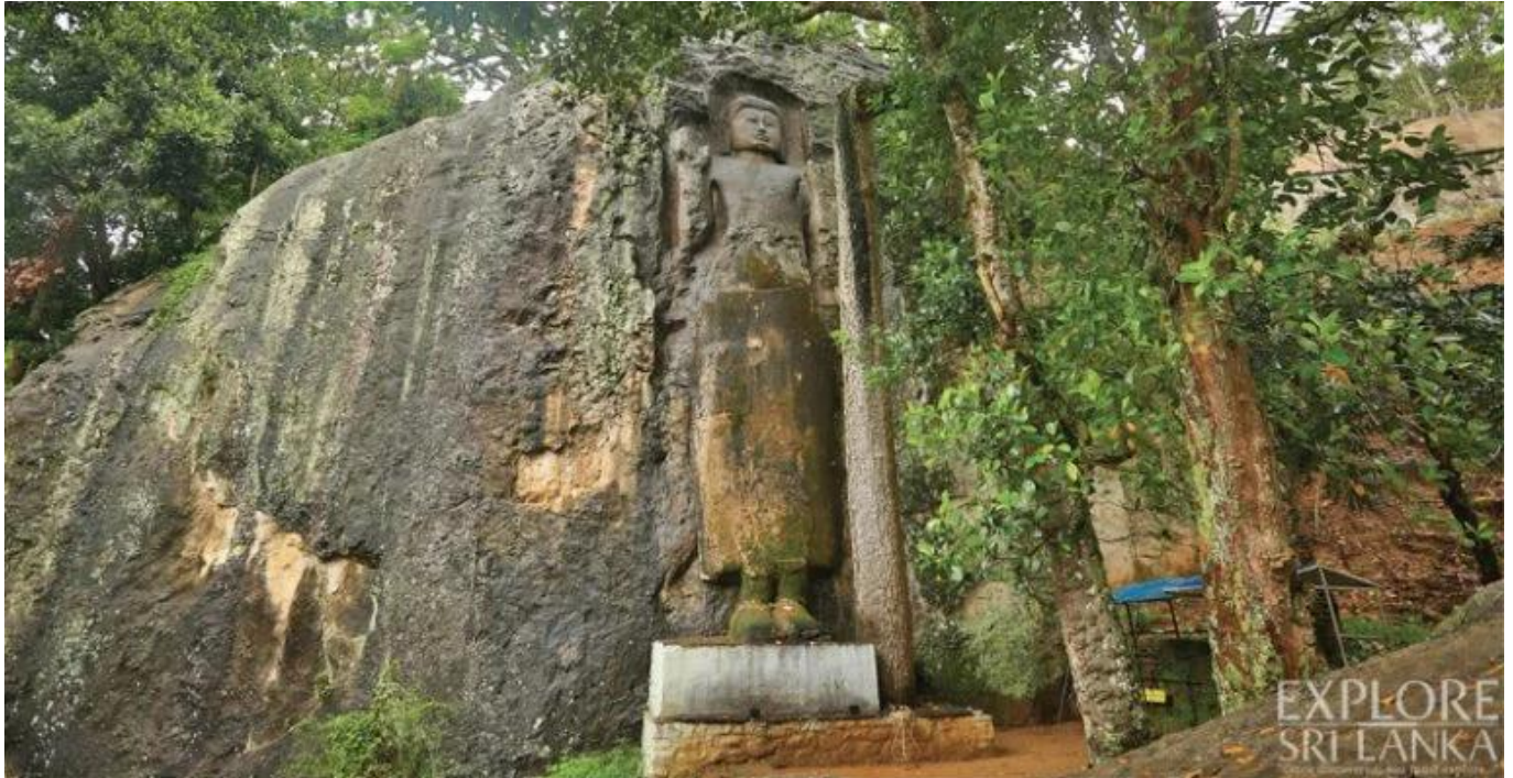
The 39-ft carving of the Buddha

Reflecting this, the Budhu Gey we see today depicts features of Kandyan era art and architecture. A large reclining statue of the Buddha can be seen within. The cave could be considered quite big as it consisted of a series of rooms, one leading to another. The interior was peaceful and calm making us reflect on the Dhamma as we walked through. The spiritual aura could be felt in our solitude.