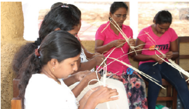
Weavers deftly work on creating unique designs.