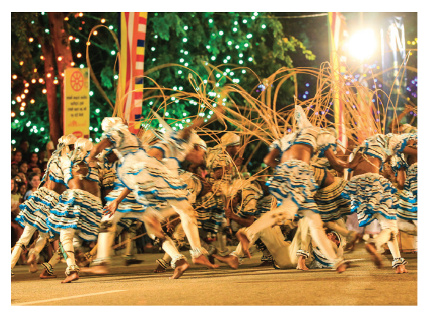
The dancers use weval (reeds) to perform artistic movements.