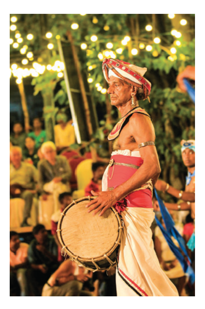
Traditional drummers play pulsating beats.