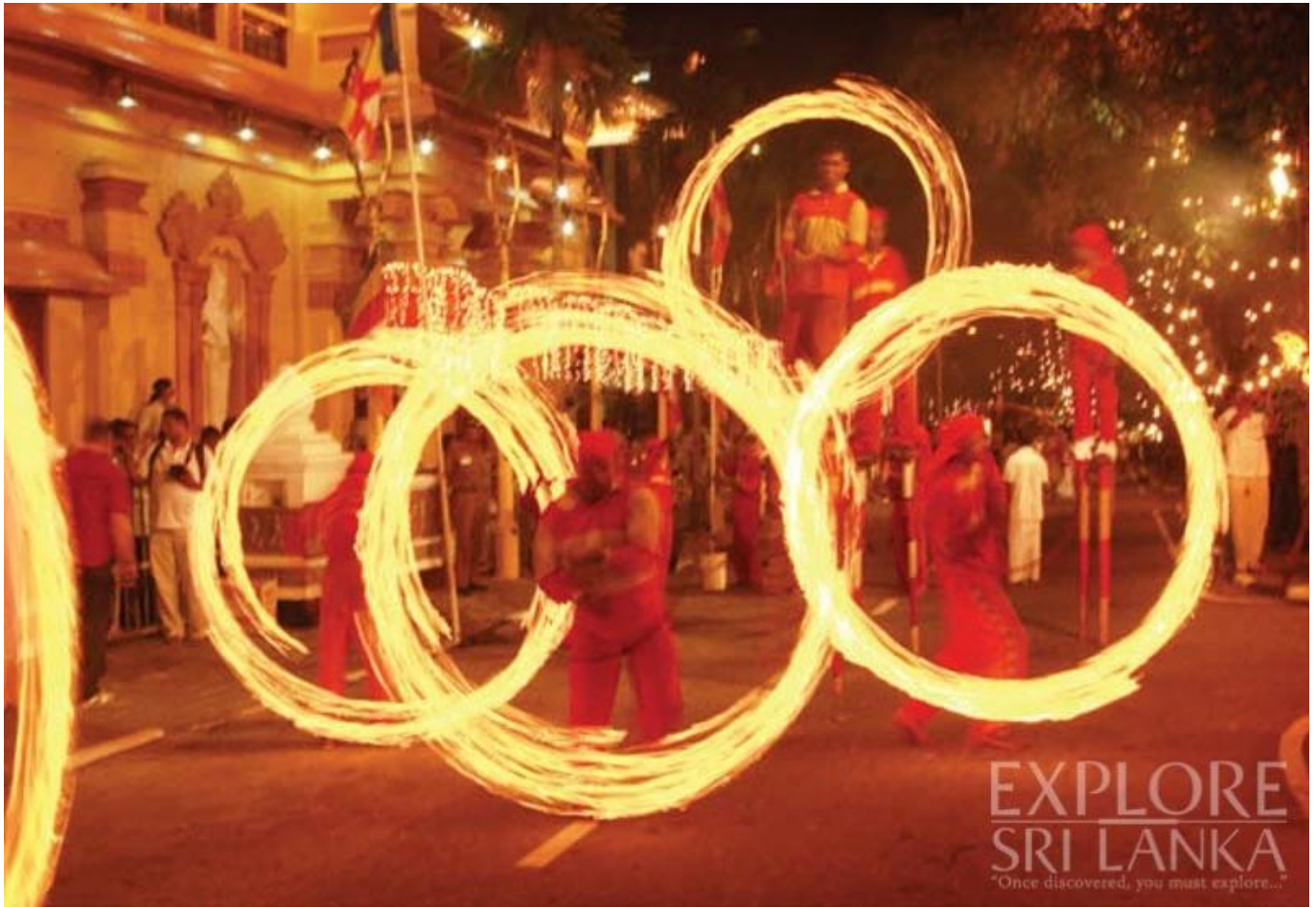
The fire dancers in synchrony

The full moon day in the month of February marks Nawam Poya, signified by incidence of two events in Buddhist history; congregation of the first Buddhist council and the appointment of the first Chief Disciples. By way of paying homage the Nawam Maha Perahera—high pageantry of cultural and spiritual embodiment—is held each year by the Gangaramaya Temple. Since it first saw light in 1979, the Perahera has become an annual tradition and this year the procession will spill through the streets of Colombo on February 14 and 15, 2014 in its customary flair, fit to dazzle.