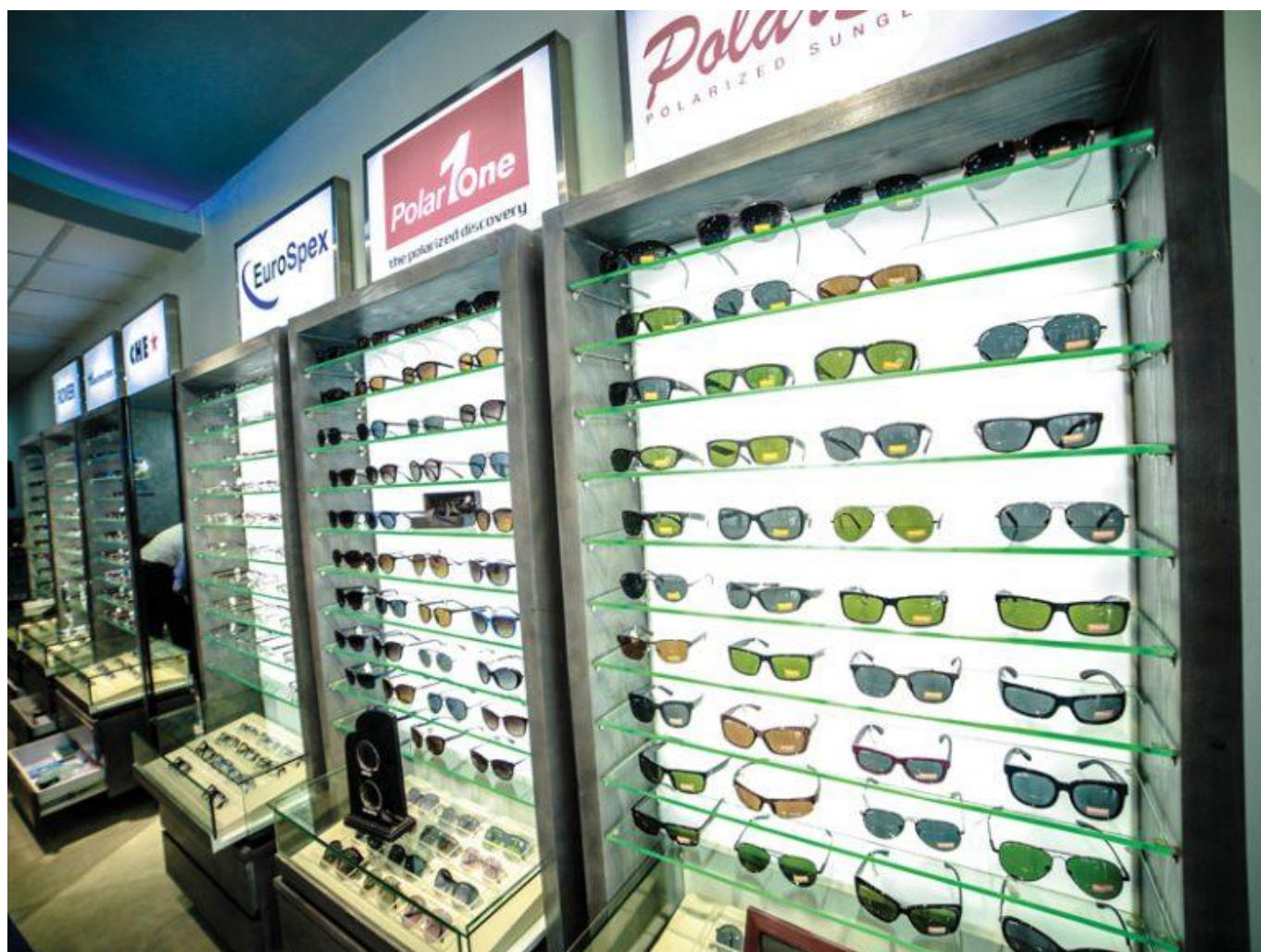
A wide range of eyewear at Vision Care's Anuradhapura outlet.

Vision Care launched its newly remodeled branch in Abhaya Place, Anuradhapura, offering better services backed by advanced technology in eye care. The market leader in eye care products, Vision Care has earned a reputation as one of the best eye care solutions providers in Sri Lanka. Vision Care also imports and distributes a range of branded and quality-based products on par with international standards to infuse an innovative and modernized approach to ensure that customers receive world-class eye care.