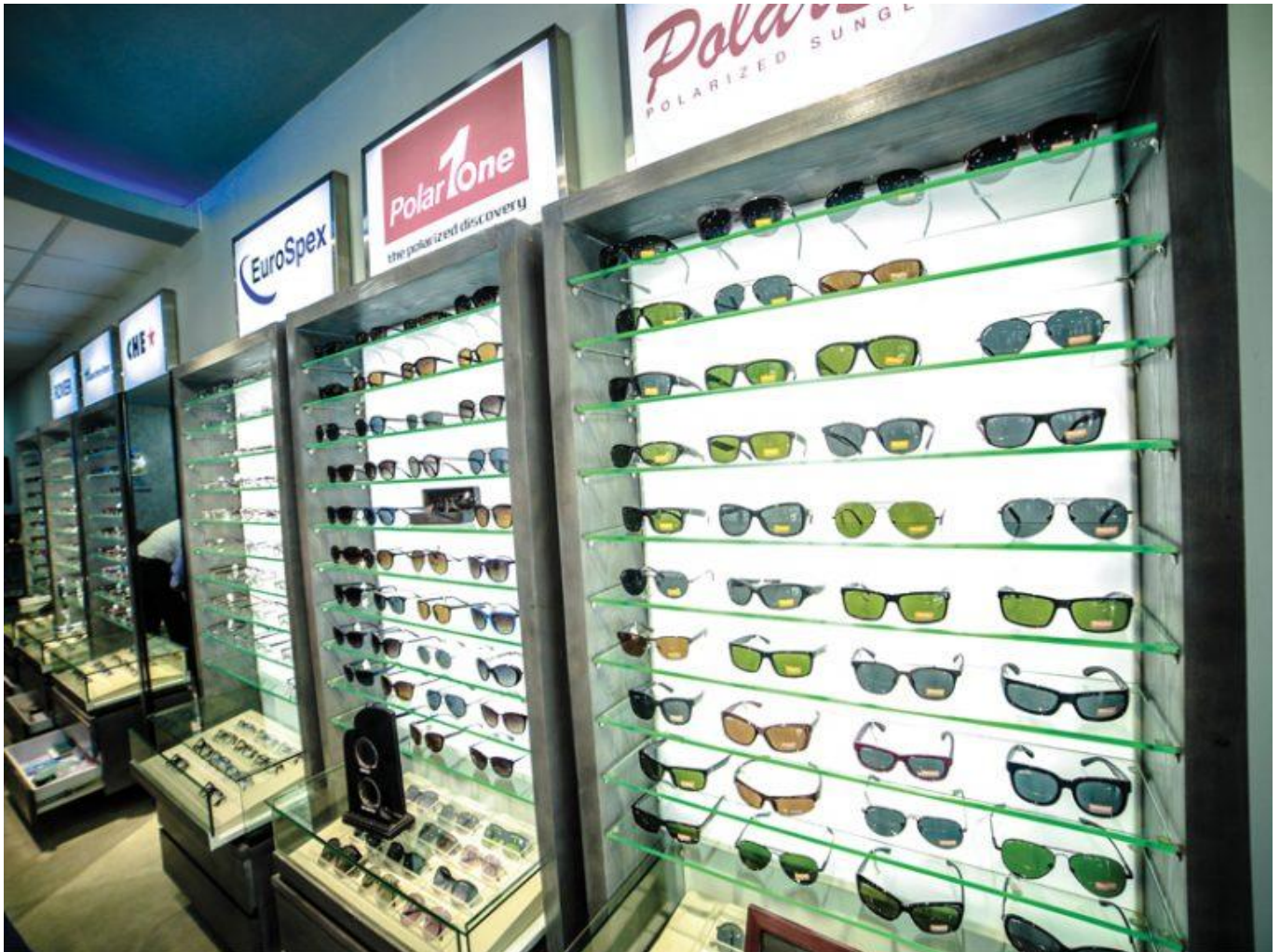
A wide range of eyewear at Vision Care's Anuradhapura outlet.

Vision Care launched its newly remodeled branch in Abhaya Place, Anuradhapura, offering better services backed by advanced technology in eye care. The market leader in eye care products, Vision Care has earned a reputation as one of the best eye care solutions providers in Sri Lanka. Vision Care also imports and distributes a range of branded and quality-based products on par with international standards to infuse an innovative and modernized approach to ensure that customers receive world-class eye care.