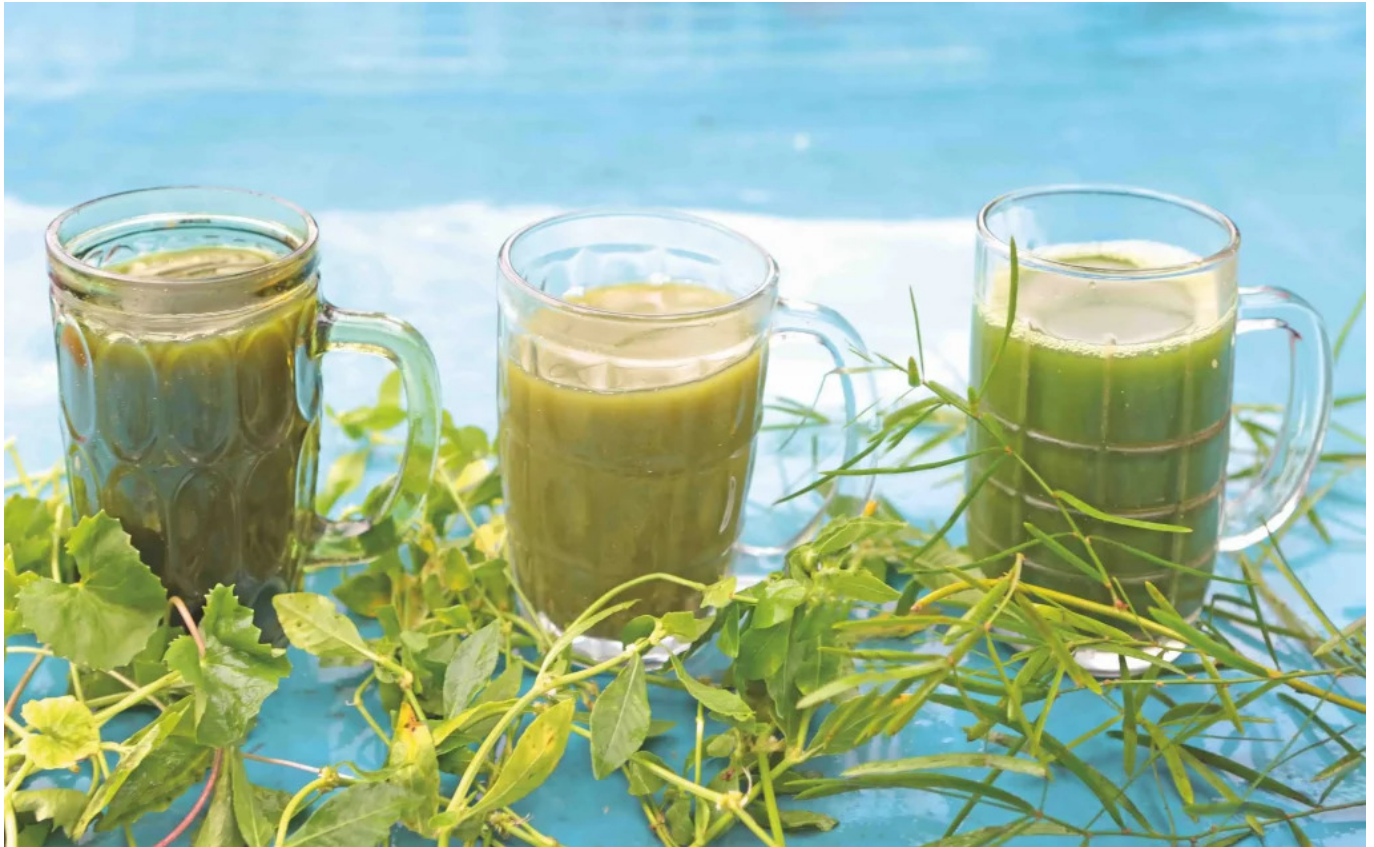
Gotu Kola, Mukunuwenna and Hathawariya kenda.

Most Sri Lankans gulp down a morning mug of Kenda, a veritable magic potion that gives the drinker strength to face the day.