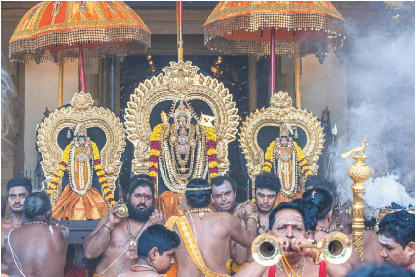
During the Manjam festival, Lord Murugan and his consorts are carried in a solemn procession.