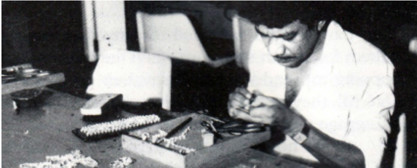
A skilled craftman making fine jewellery at Nilani Gem Exports.