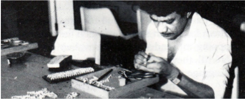
A skilled craftman making fine jewellery at Nilani Gem Exports.

Some of the exhibits on display at the Nilani Gem Musuem Ratnapura.