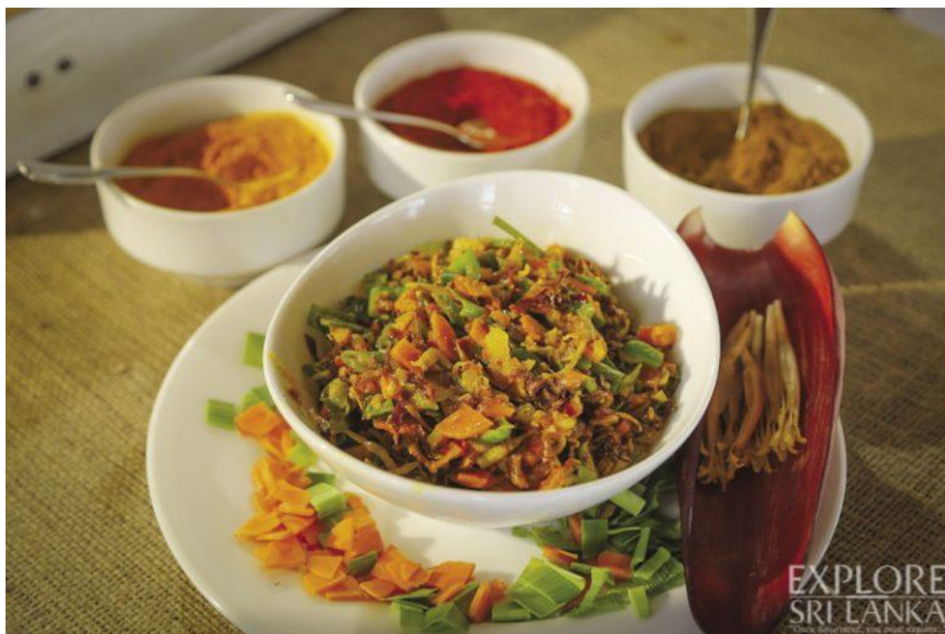
Flavourful carrot devilled