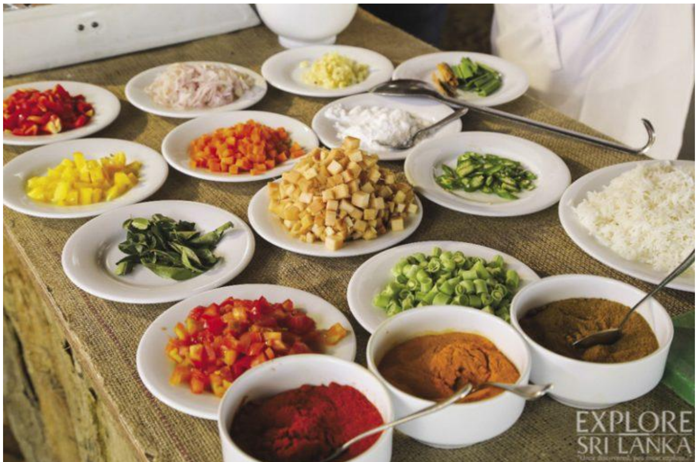
The ingredients required to make Compittu