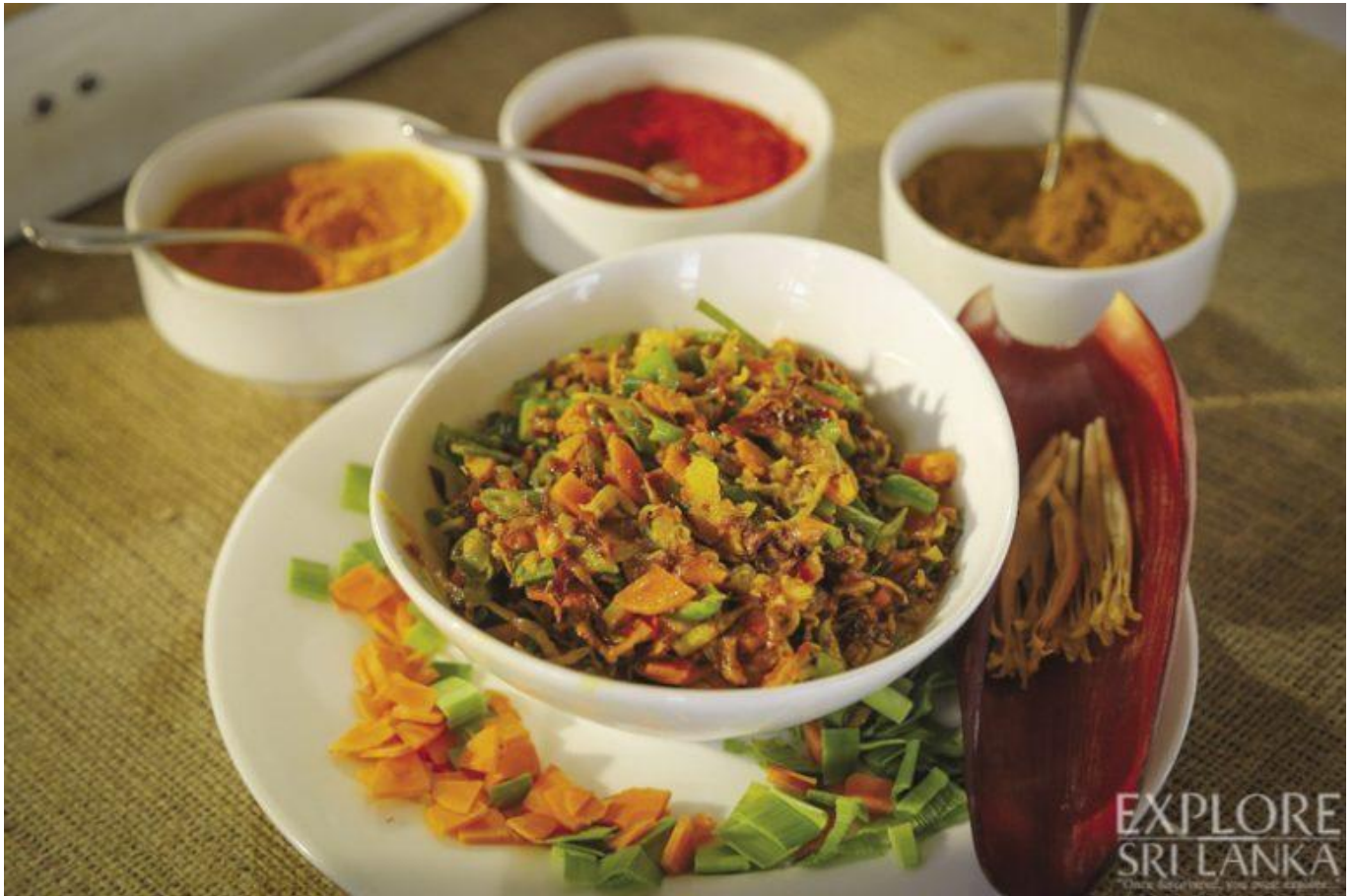
Flavourful carrot devilled