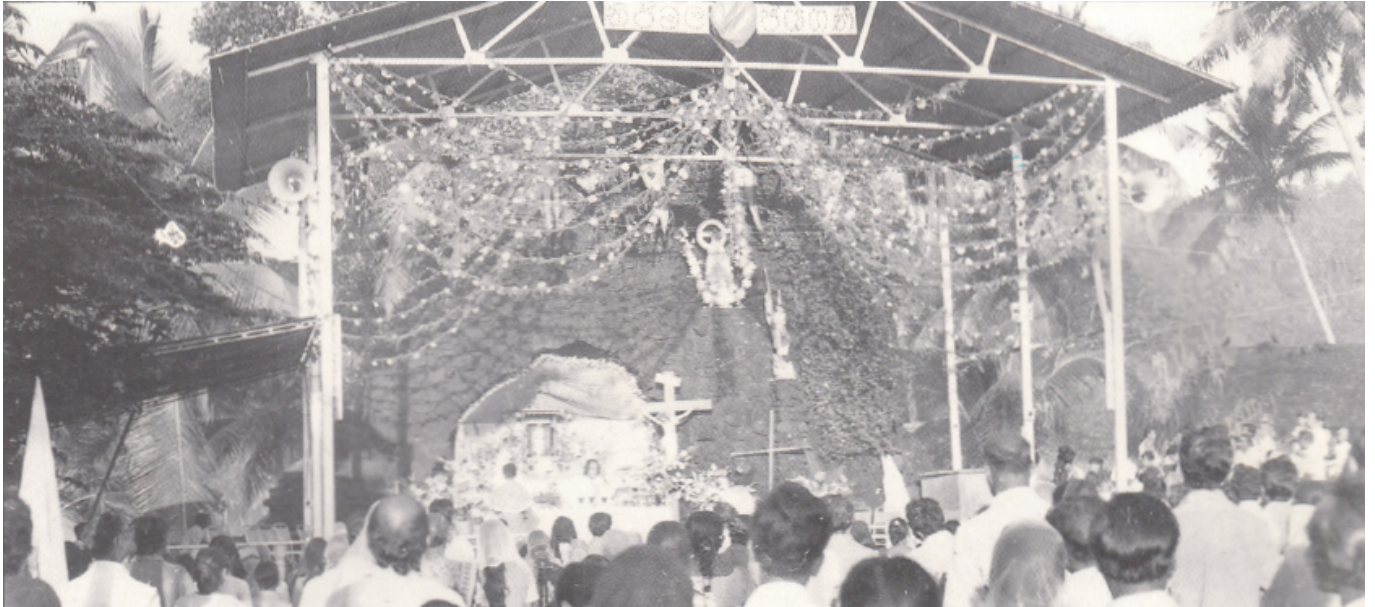
The church feast at Kudagama is a special occasion for crowds of Roman Catholic devotees.