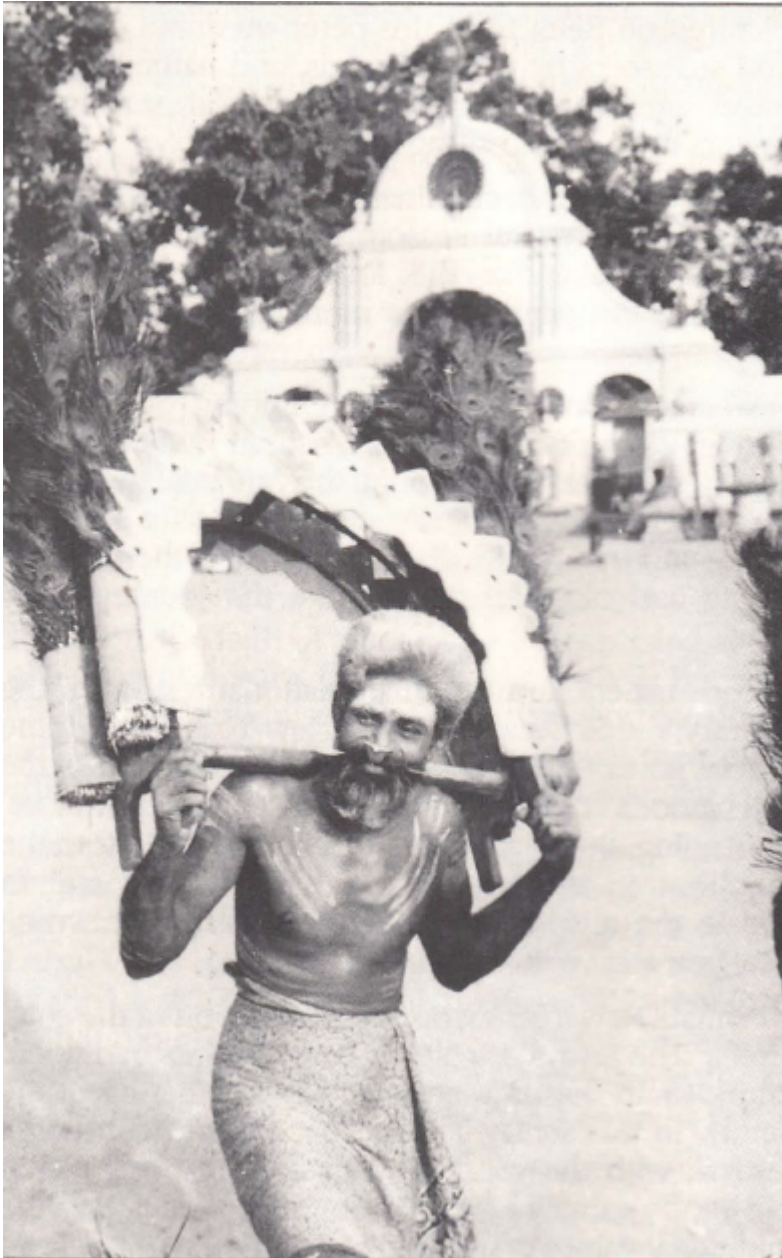
Kavadi dancer at Kataragama pays penance for a vow.