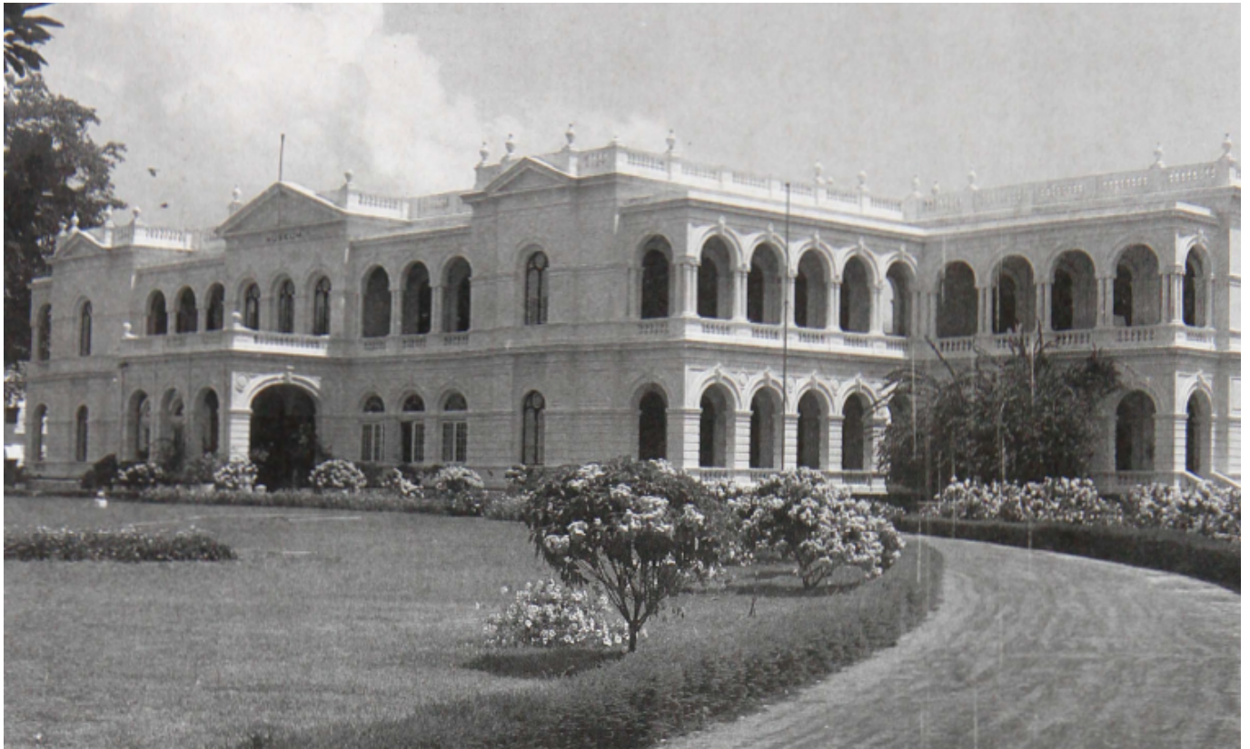
Colombo's National Museum mirrors the island's history.