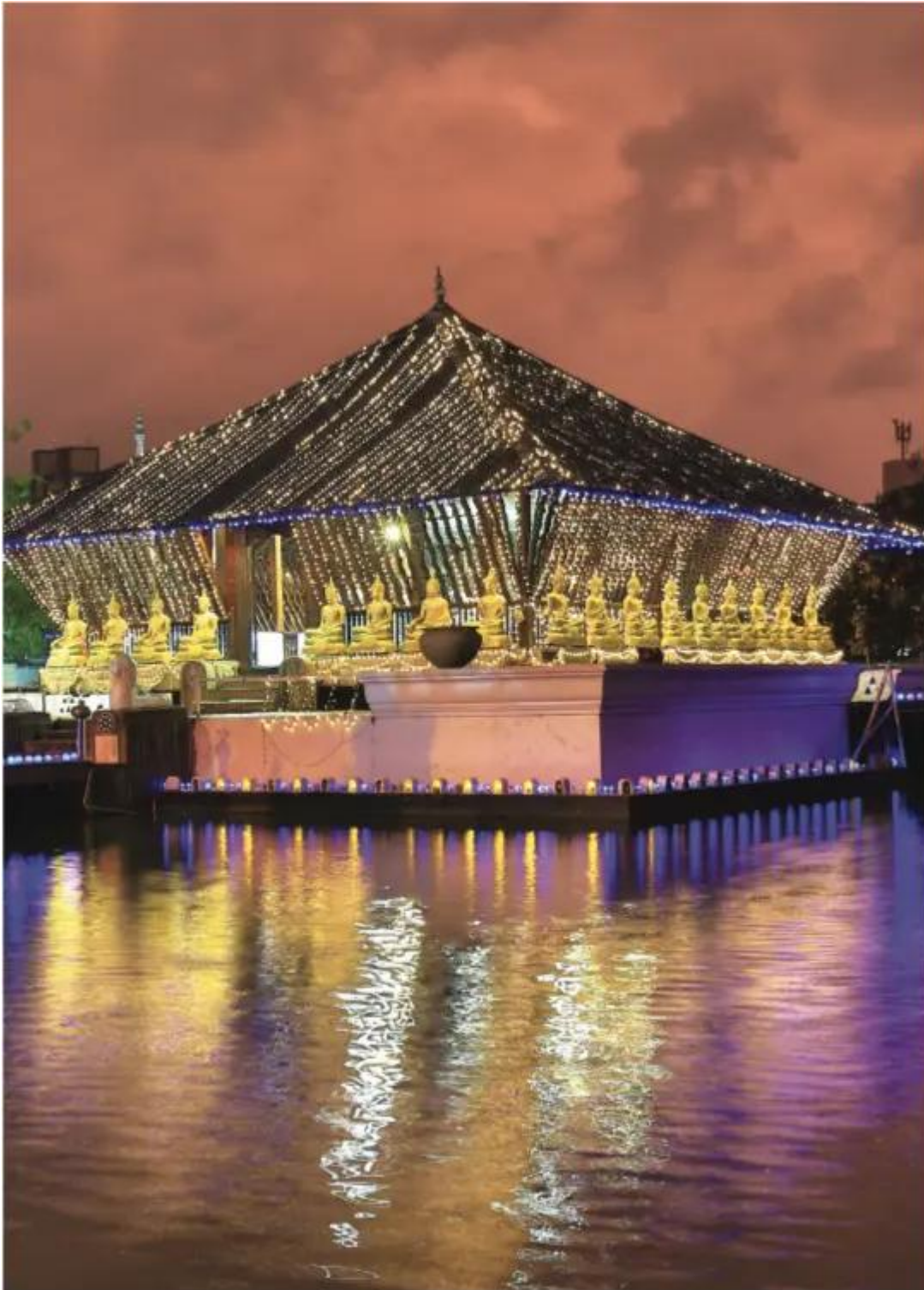
The iconic Seemamalakaya magical upon the Beira Lake. The iconic Seemamalakaya magical upon the Beira Lake.