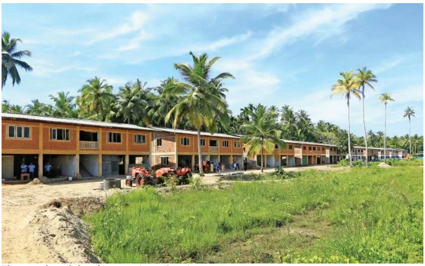
The complex of shop-house units at Seenigama

With many of the paddy farmers being affected by the recent severe droughts, the Venerable Thero aims to donate hand tractors to these farmers, which will enable them to use this vehicle for various agricultural activities as well as to generate electricity. Thereby providing alternative forms of income.