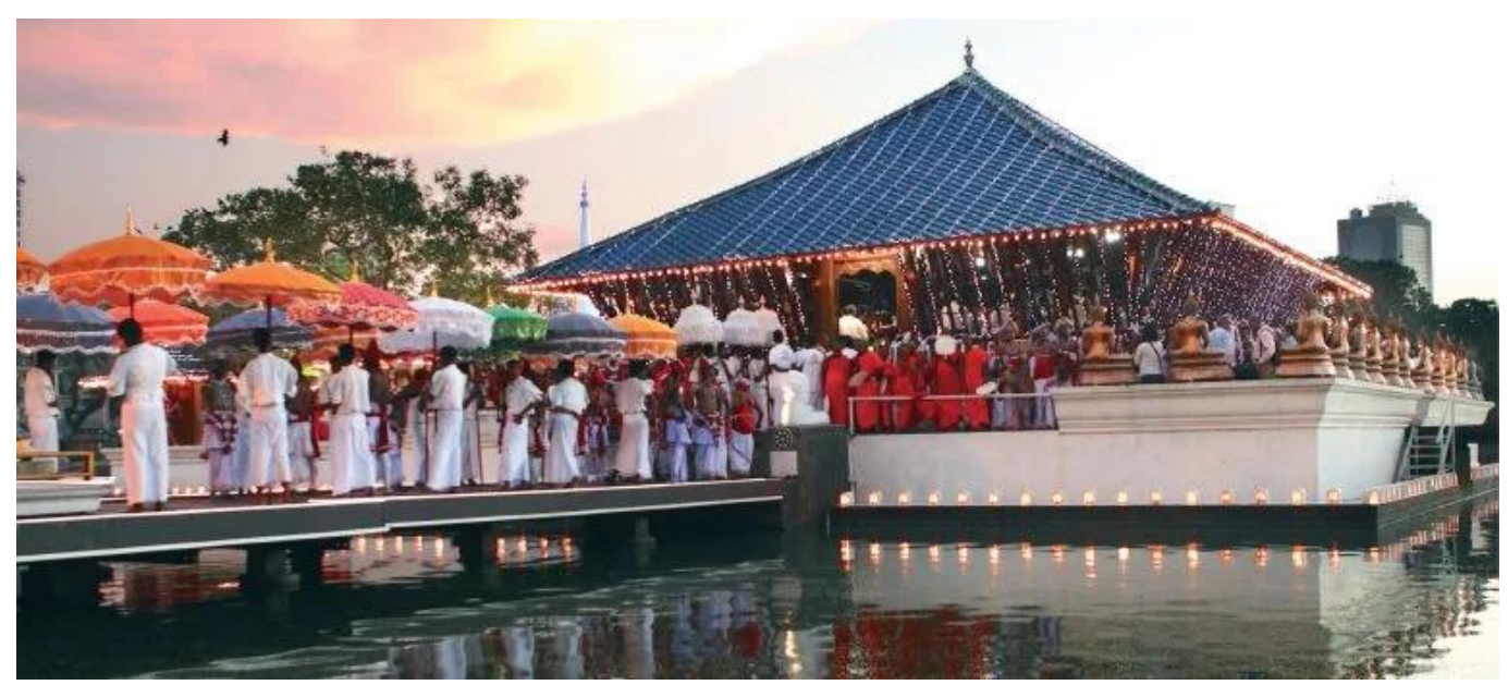
The Seema Malakaya on Navam Perahera night

Podi Hamuduruwo has fostered long standing relations with temples overseas with the aim of ensuring cross-cultural learning. A Sacred Hair Relic of the Buddha was gifted to the Temple as a result of the warm and cordial ties between Gangaramaya and a temple in Chittagong, Furthermore, General Pradeeth Virakshadhi of the Thai Army, donated the golden casket to enshrine the Sacred Hair Relics of the Buddha. The latest token of devotion sits in its own shrine room: a glowing green jade Buddha adorned in gold jewellery - which is a replica of the historical emerald Buddha placed at the Royal Palace of Thailand - was donated by Madam Pabachudha Virakshadhi.