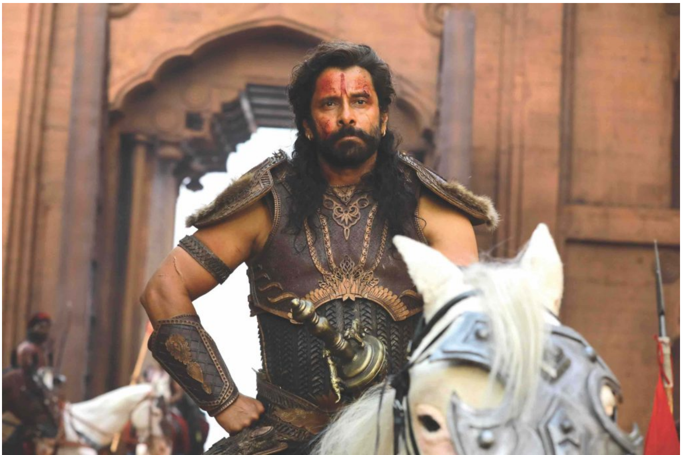
Vikram as Aditya Karikalan.