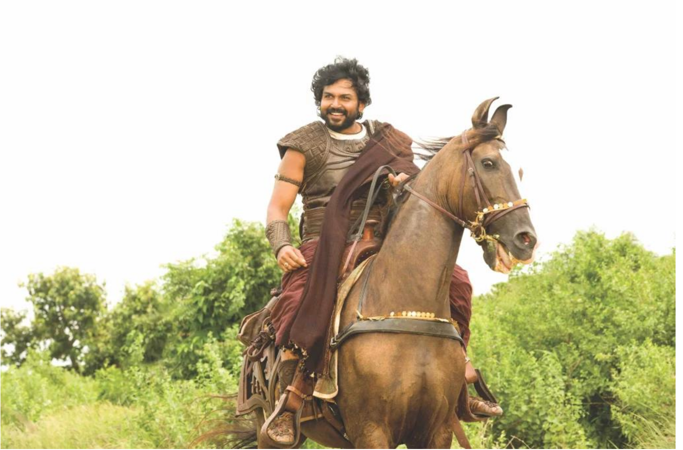
Karthi as Vandhiyathevan.