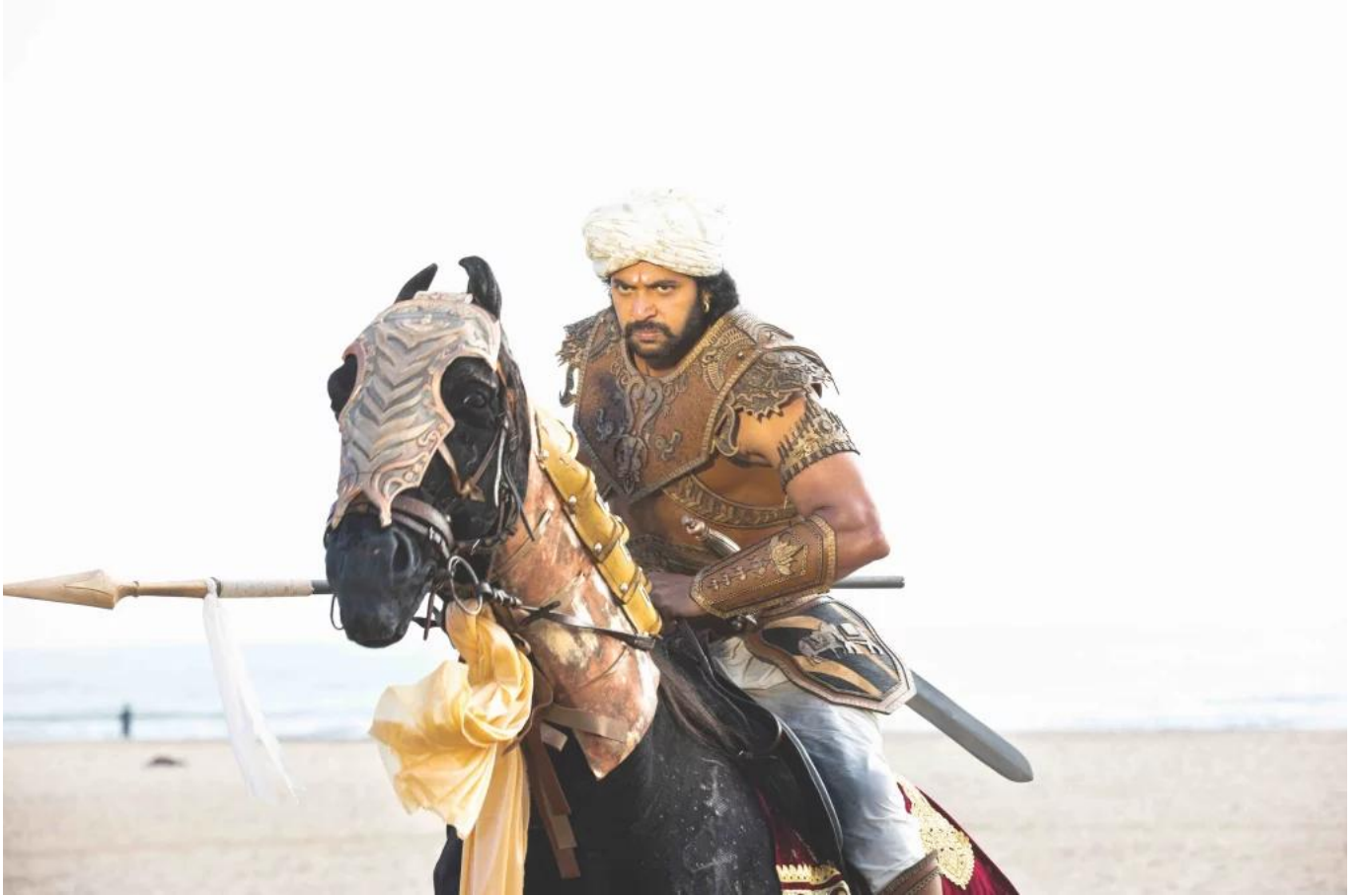
Jayam Ravi as Arunmozhi Varman.