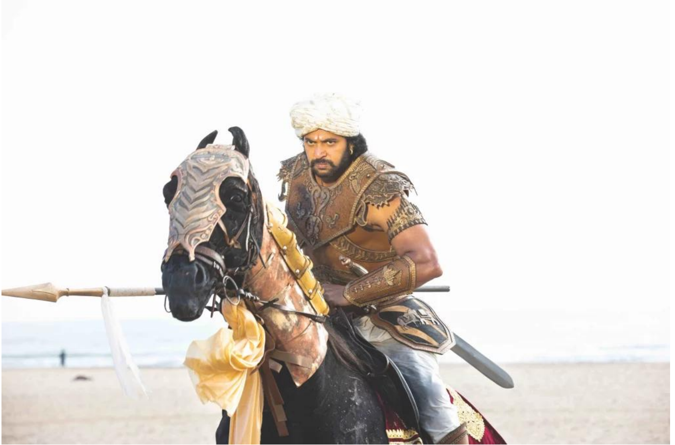
Jayam Ravi as Arunmozhi Varman.