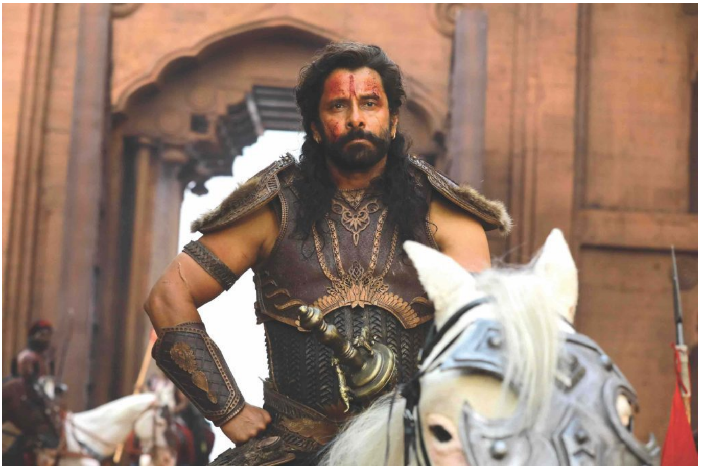
Vikram as Aditya Karikalan.