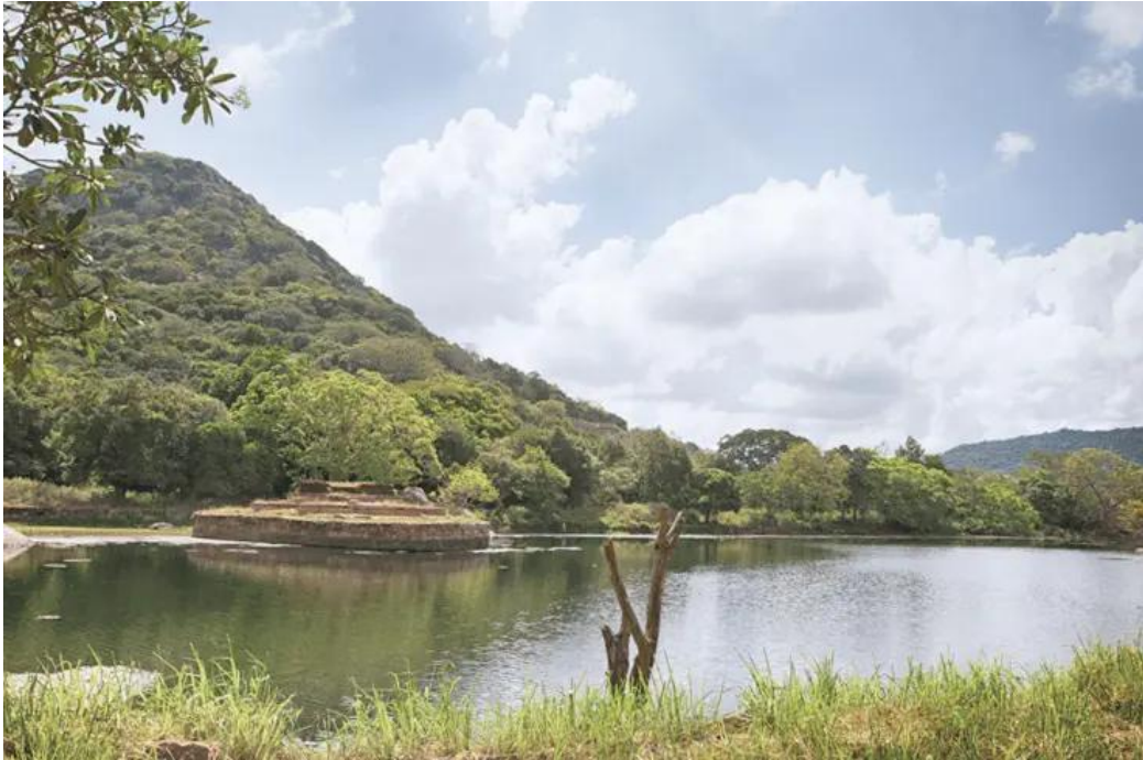
Kaludiya Pokuna with somber reflections of trees and boulders of the neighboring forests and mountains.