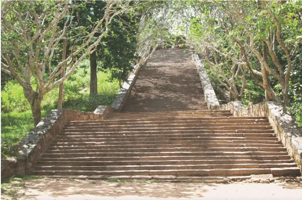
The grand staircase fringed by Araliya trees evokes a sense of spirituality.