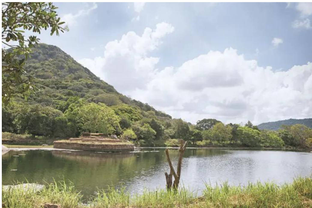
Kaludiya Pokuna with somber reflections of trees and boulders of the neighboring forests and mountains.