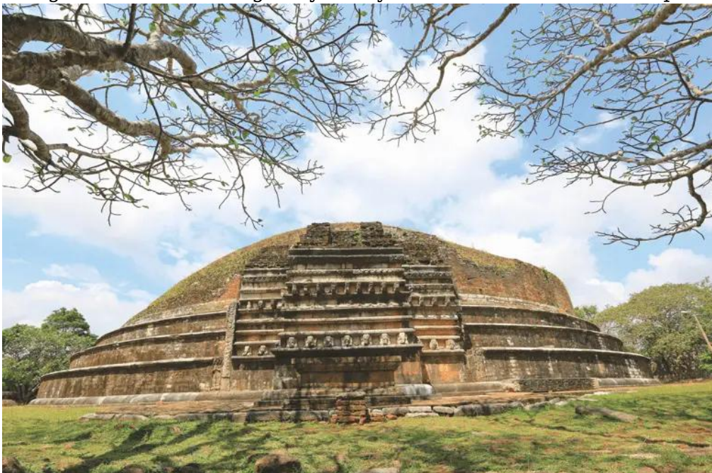
Kantaka Stupa is famous for its four Vahalkadas and expresses artistic heritage.