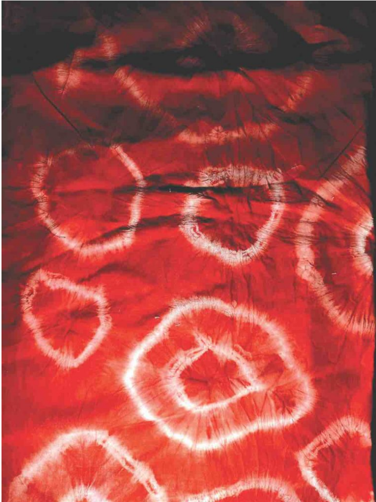
Textile dyeing work.