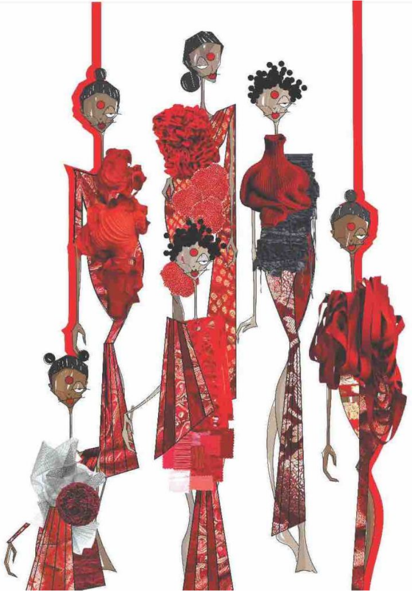
Conceptual sketches to visualize textures and pattern placements.

The exhibition titled 'Pottu: A Journey of Constriction to Liberation' by Milani Lawrence is a thought-provoking exploration of the impact of generational trauma within the context of the Sri Lankan civil war.