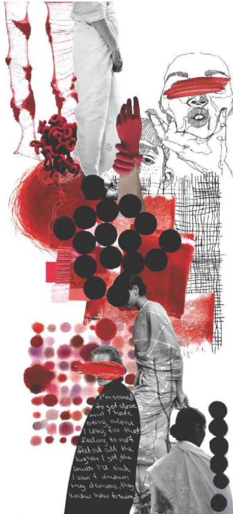
Project mood board.