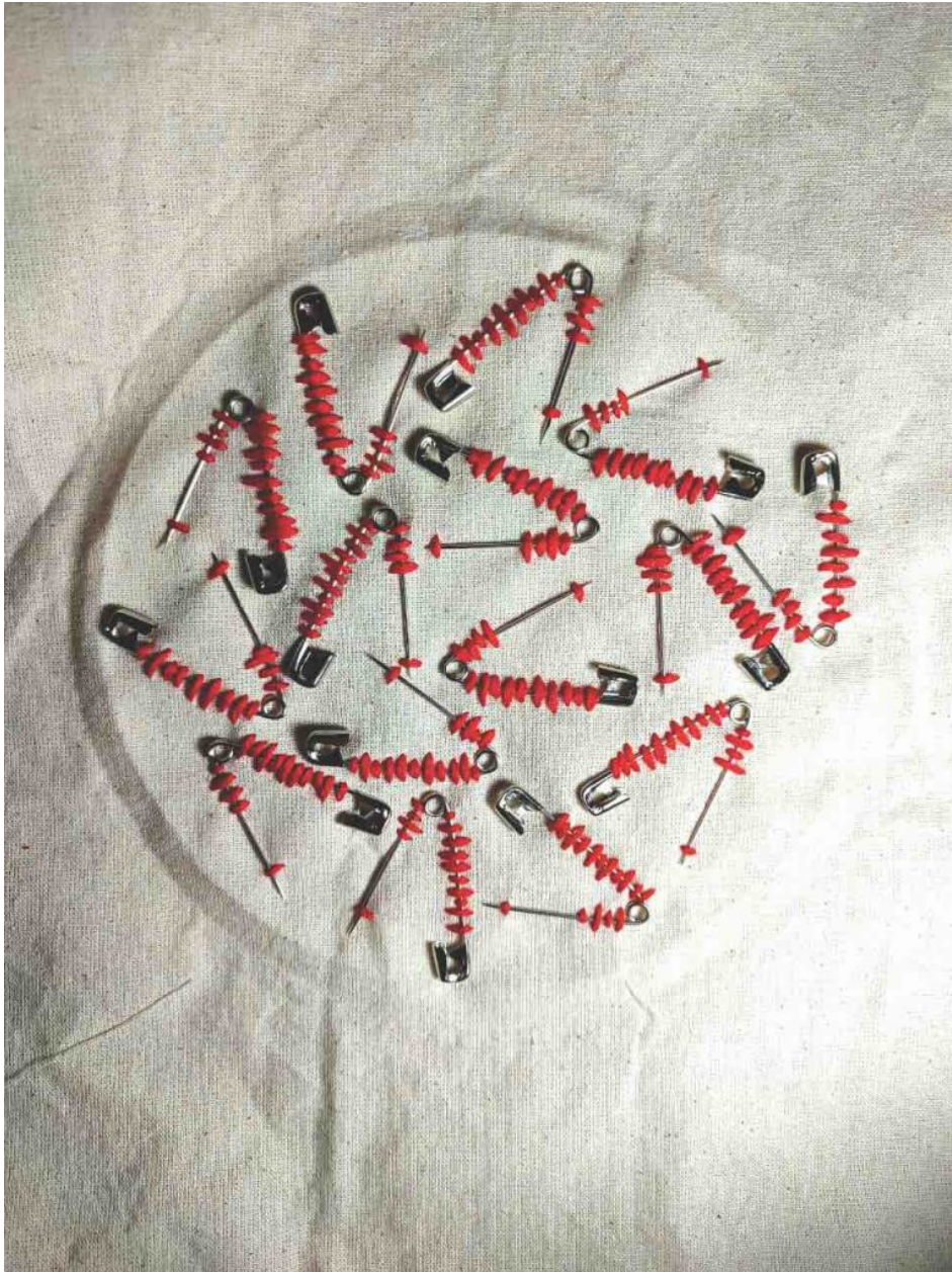
Embroidery work - Utilising unconventional materials with high symbolic value for embellishment details.