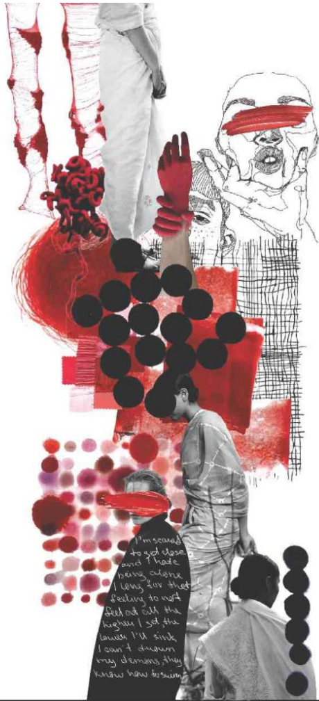
Project mood board.