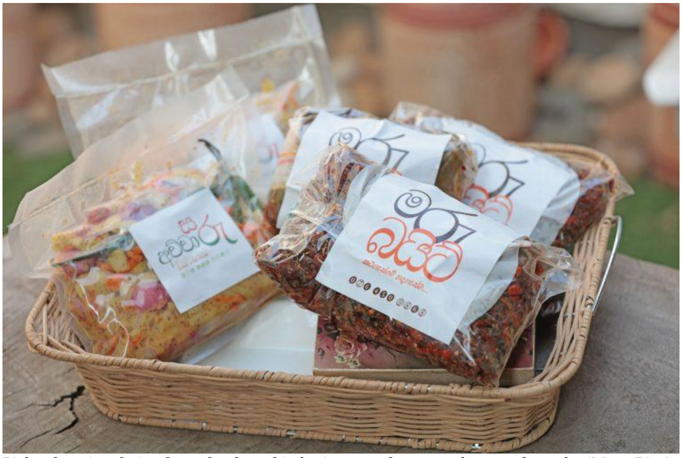
Pick a favorite choice from the deep-fried mixtures of gram and sprats from the 'Maru Bite' range.