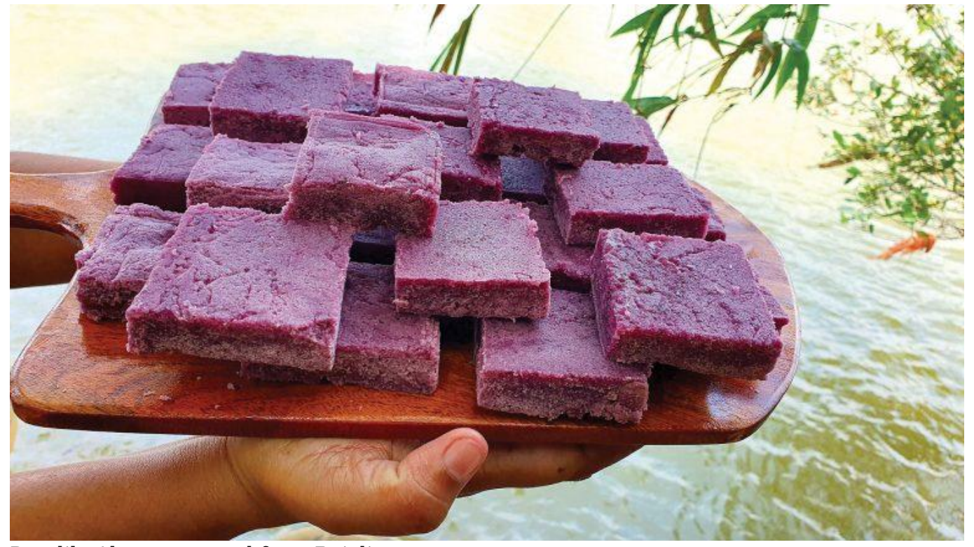
Dandila Aluva prepared from Rajali yam.