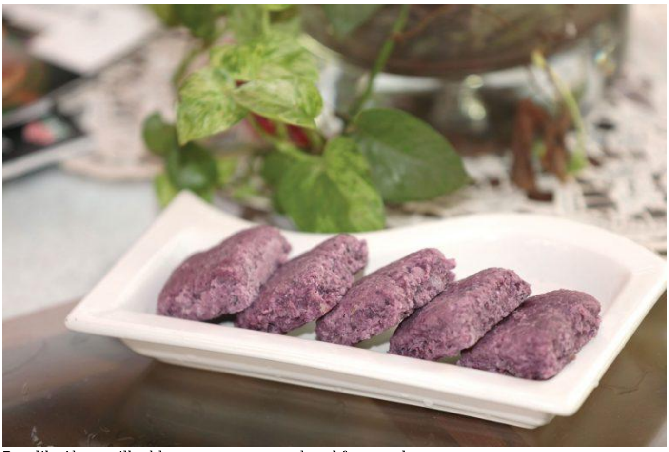
Dandila Aluva will add sweetness to your breakfast meal.