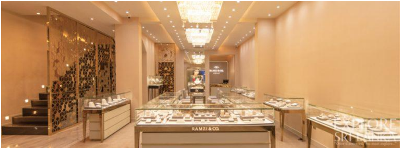
The chic and sophisticated display of jewellery

Ramzi & Co Jewellery unveiled its flagship store and state-of-the-art Gem Museum in the heart of Colombo. The elegant store is located at 98, Bauddhaloka Mawatha, Colombo 4.