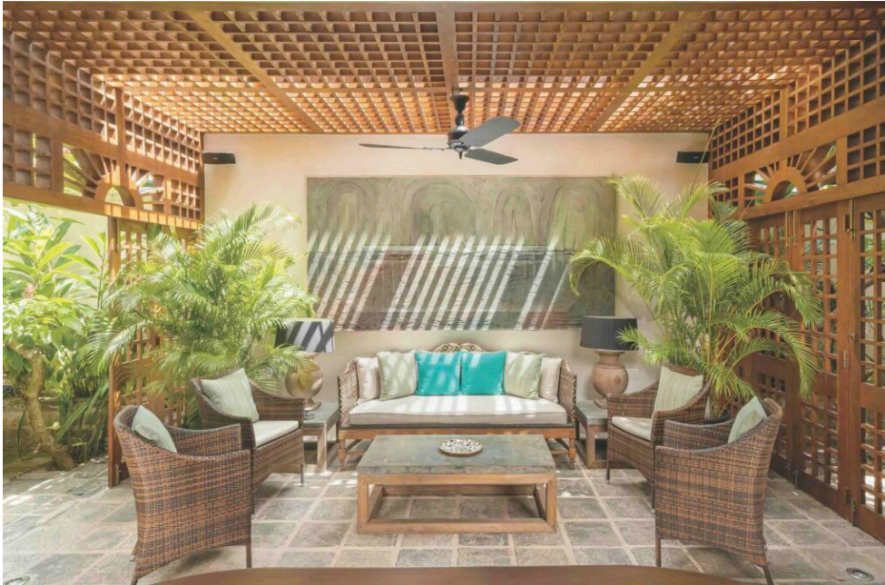
A radiant inner courtyard, illuminated by the warm embrace of natural light.