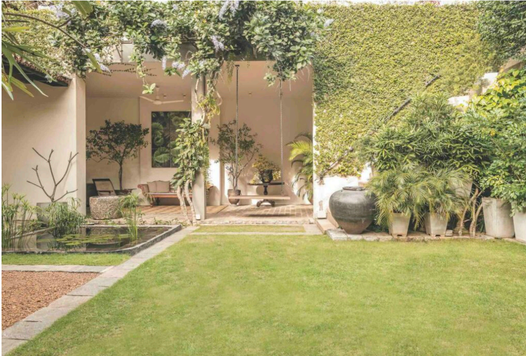
A tranquil courtyard bathed in gentle sunlight, exuding serenity and peace.