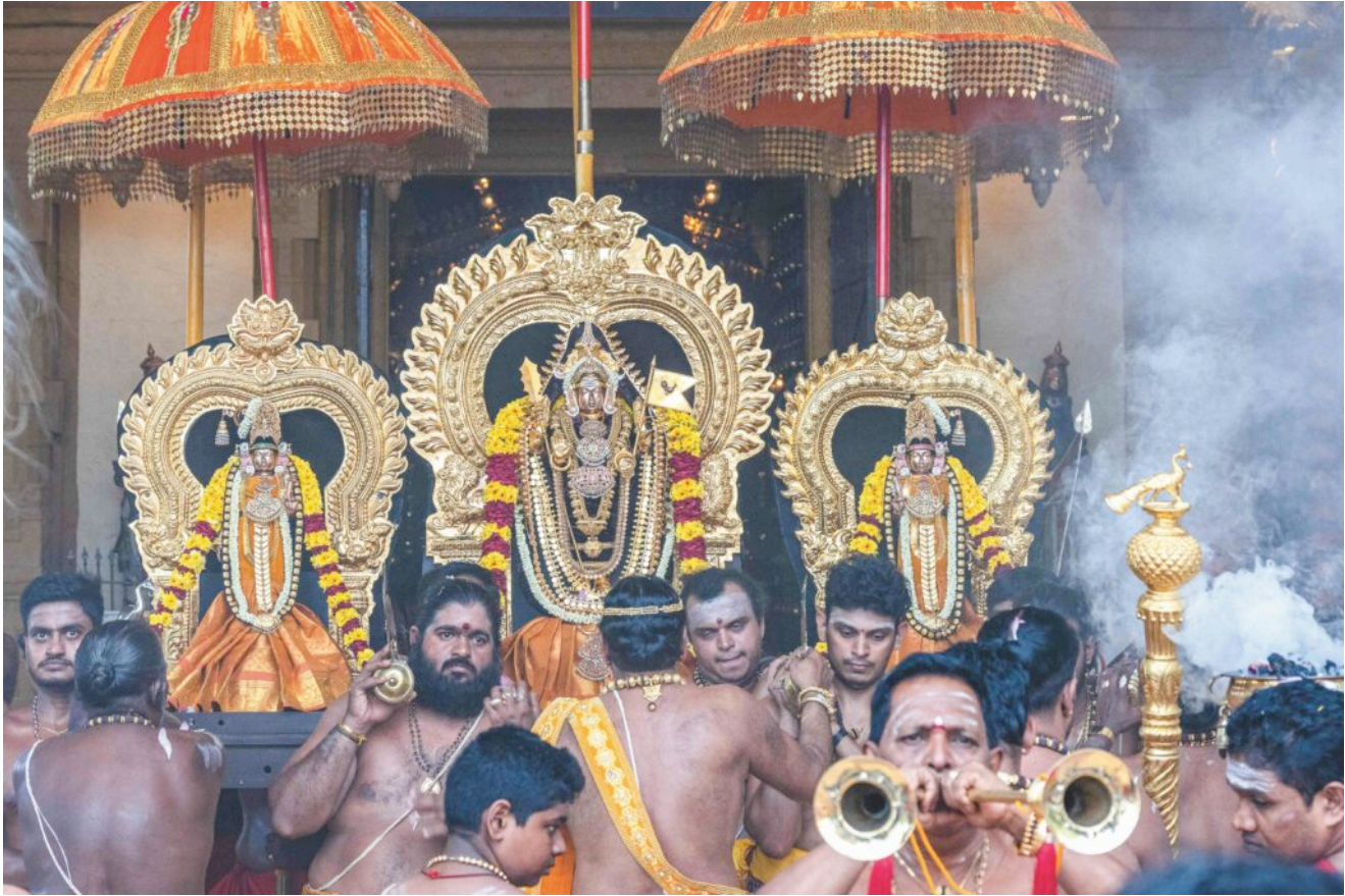
During the Manjam festival, Lord Murugan and his consorts are carried in a solemn procession.