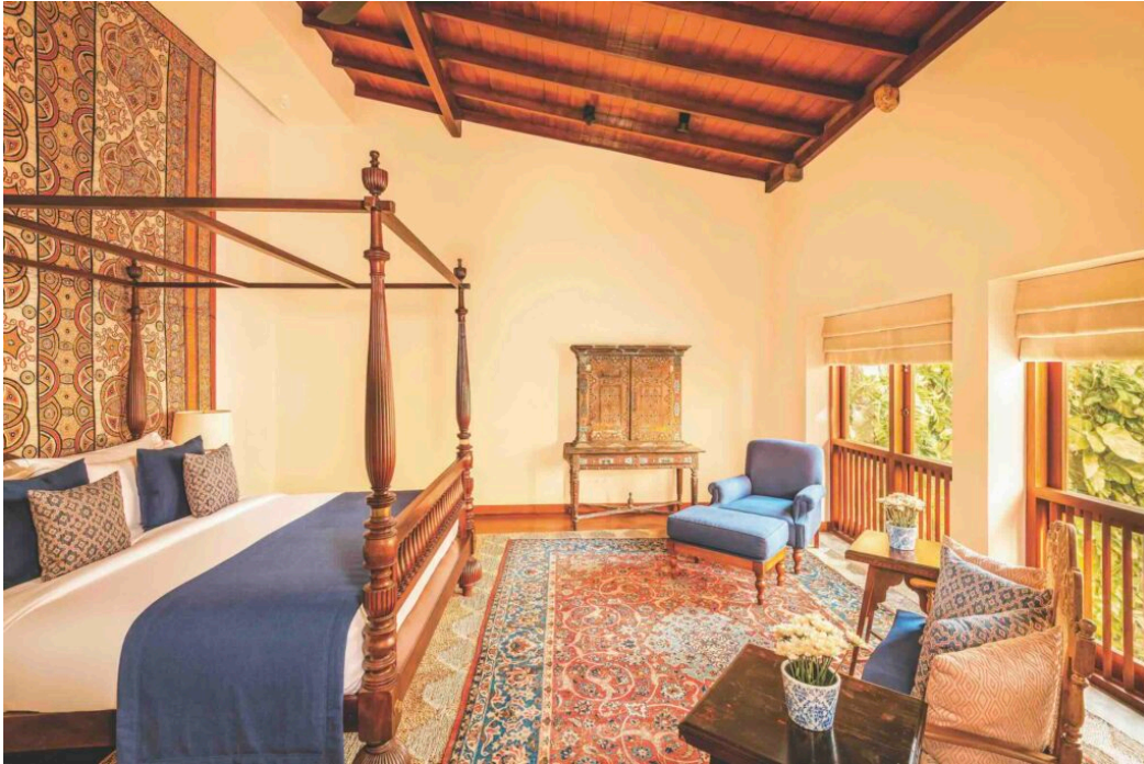
Master Suite 1.