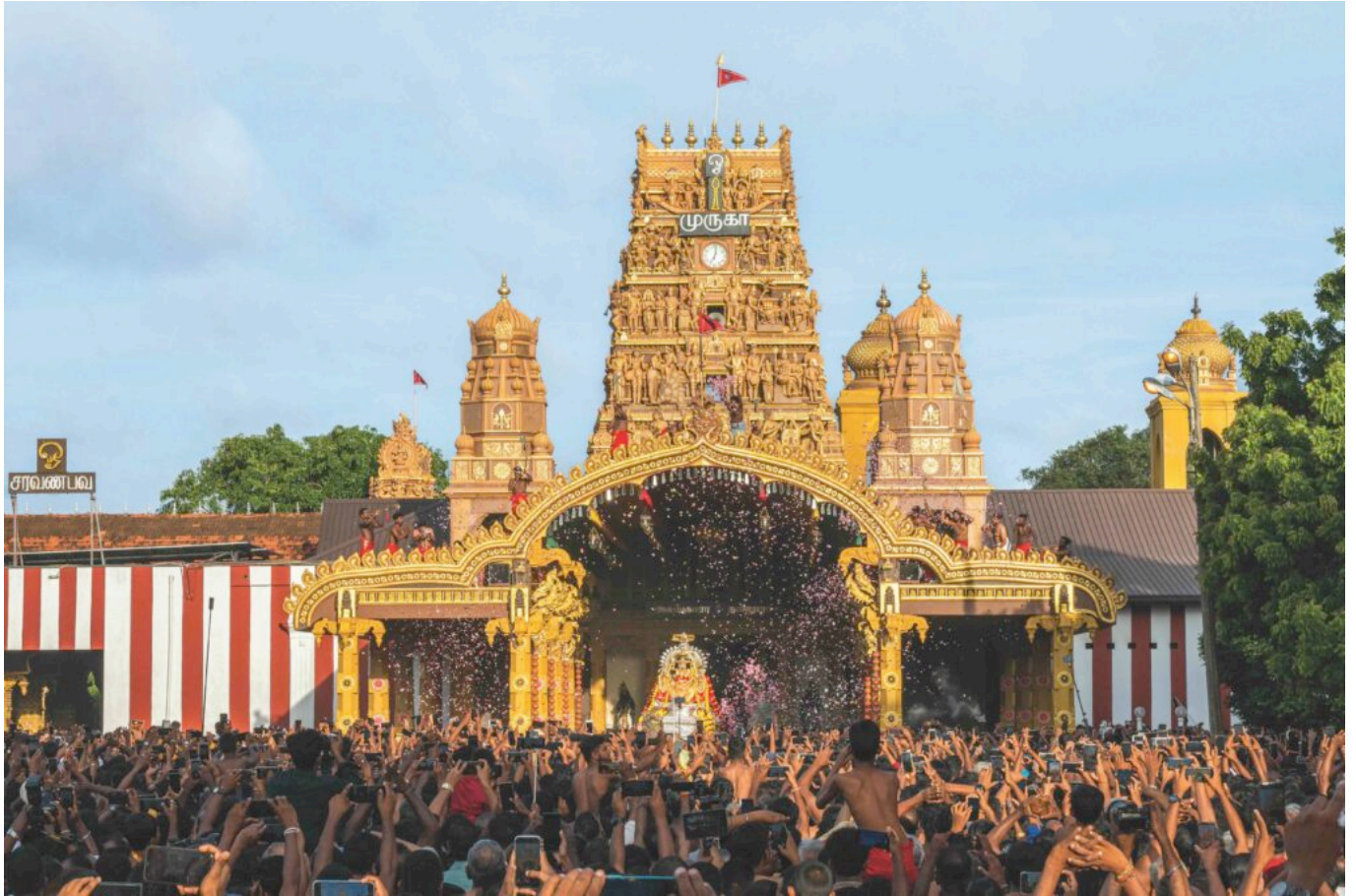
As Lord Murugan emerges from the inner sanctum, a vibrant shower of flower confetti from the devotees greets him in celebration.