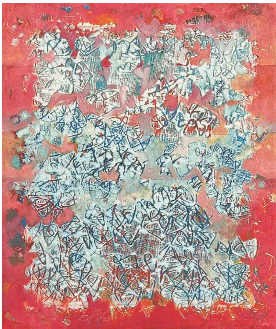
Freedom Search XII.