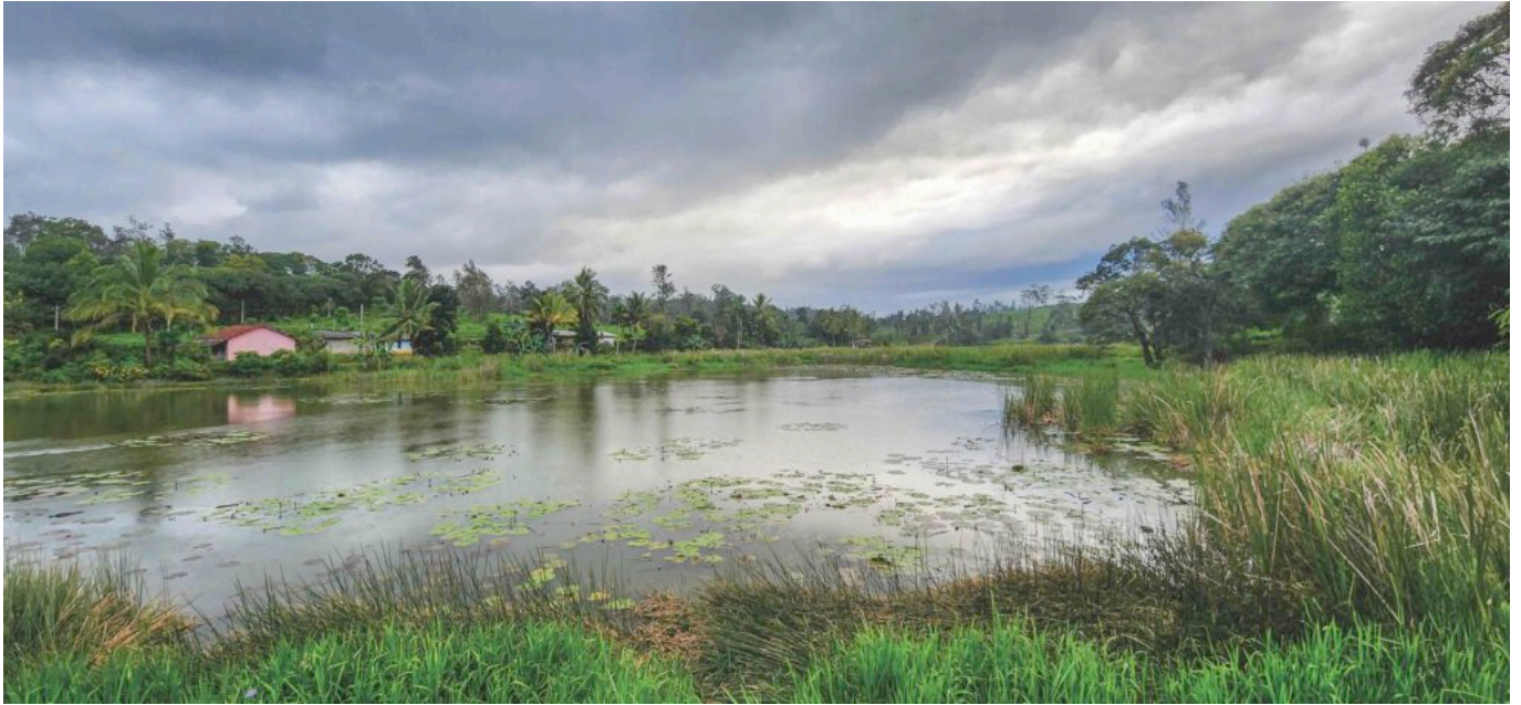
Grace in bloom - the lotus pond shines beautifully along paddy fields at the beginning of Stage 20.