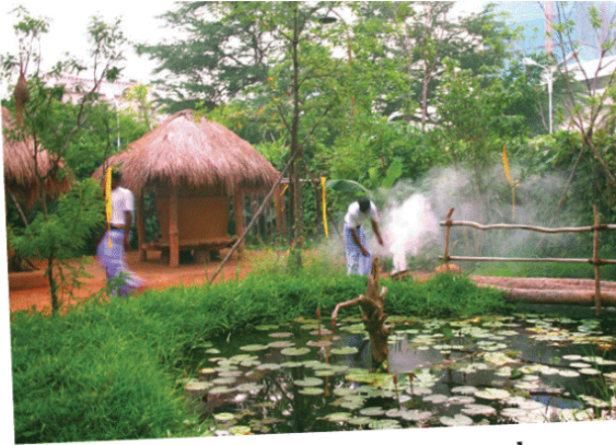
The Pokuna or pond

We want to be the best five- star hotel but it doesn't mean we have to be a western-oriented one, instead we want to offer the best of both worlds." Thus dawned the idea of creating something innovative and uniquely Sri Lankan. In effect arose Nuga Gama, faithfully true to all the elements of a typical traditional village. On to one side is the Gama Gedara or a typical village house, snuggled humbly in its simple bearings with clay walls and a thatched roof. Within its cosy interior are a welcoming antique armchair and other household objects. "It's a nice place to come and read books and I've seen visitors sitting under the shady part of the Gama Gedara to have a cup of tea. It's a place to relax, wander around and escape the hustle and bustle," says Rohan adding, "I've even seen people coming to simply take pictures." Nearby stands a well and the house can be approached along-side a 'Pokuna' or the pond where Nil Manel blooms; the national flower of Sri Lanka, nods from its surface. A little bridge also runs across this pond painting a quaint picture of simplicity.