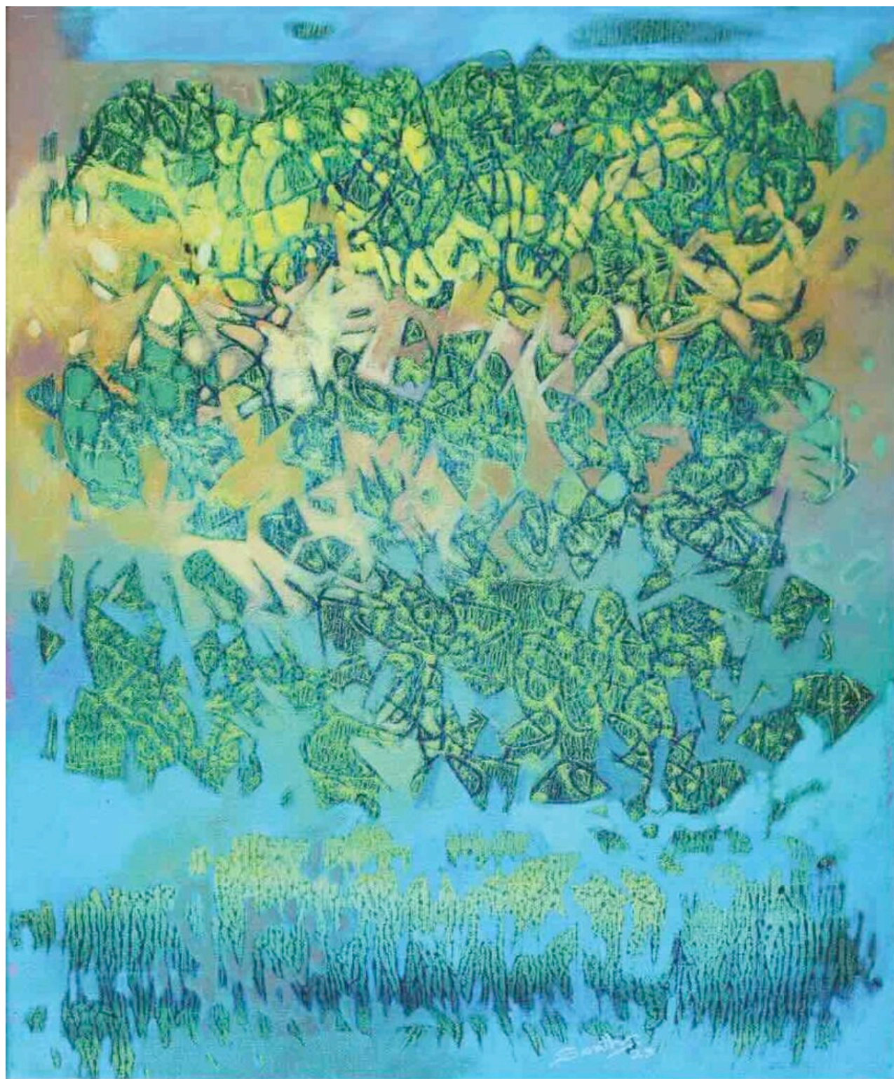
Freedom Search I.