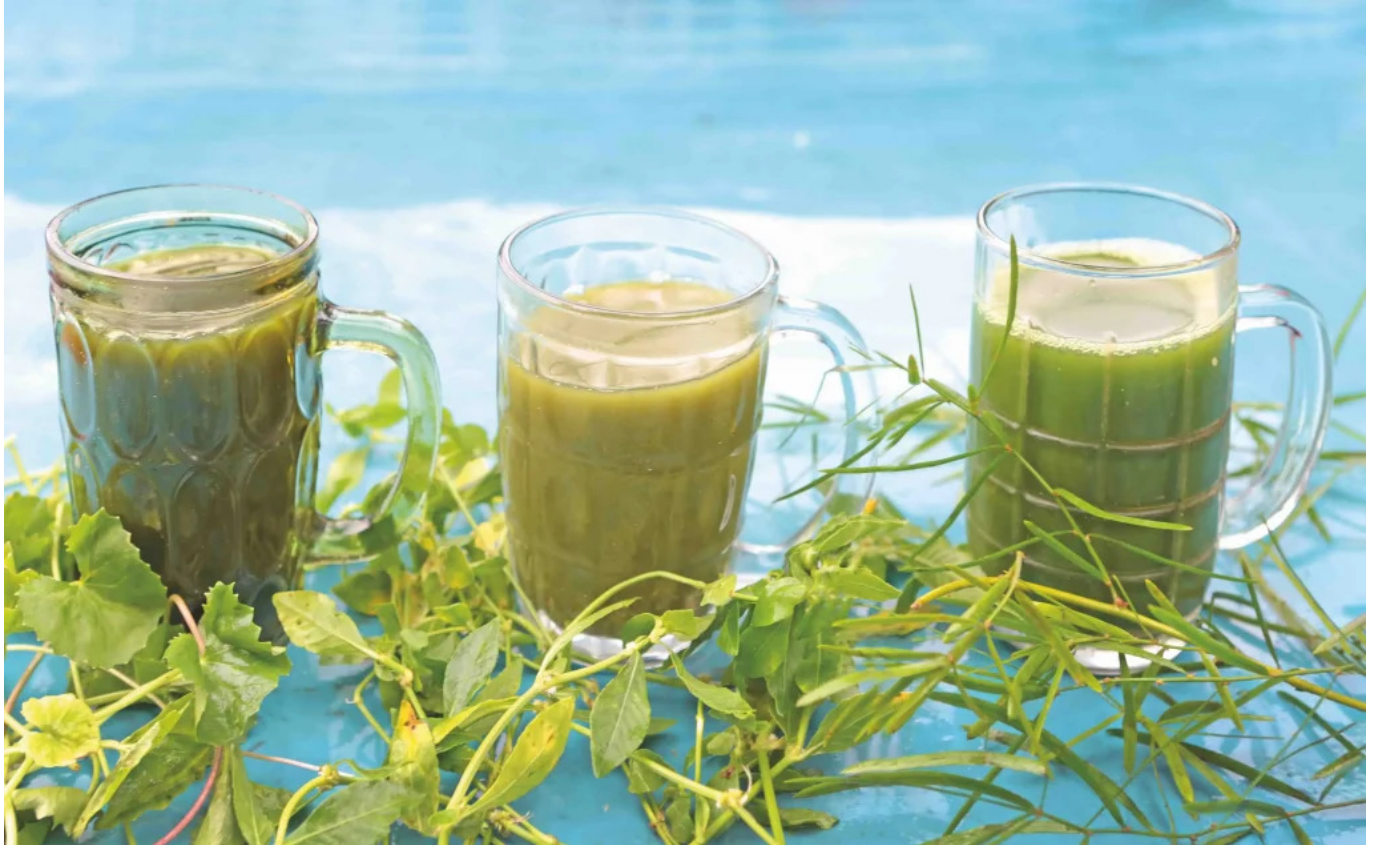
Gotu Kola, Mukunuwenna and Hathawariya kenda.

Most Sri Lankans gulp down a morning mug of Kenda, a veritable magic potion that gives the drinker strength to face the day.