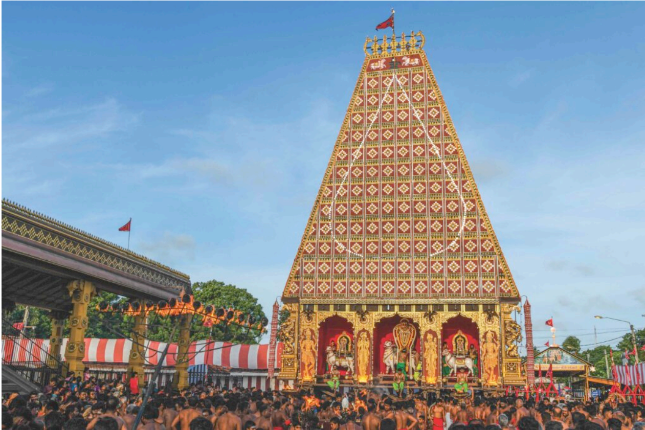
The tall and impressive sapparam is beautifully adorned with decorations.