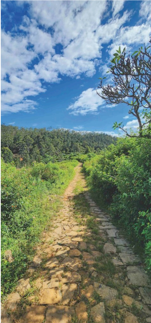
A sunlit path through highland beauty.

Legend also ties the cave to a real historical figure: King Walagamba. According to tales passed down through generations, he concealed 500 of his consorts within this cavernous network— an image as fascinating as it is implausible, given the cave's low ceilings and constricting passages. To move within it demands a bent posture, steely nerve, and a tolerance for discomfort, making it a place best left to seasoned spelunkers.