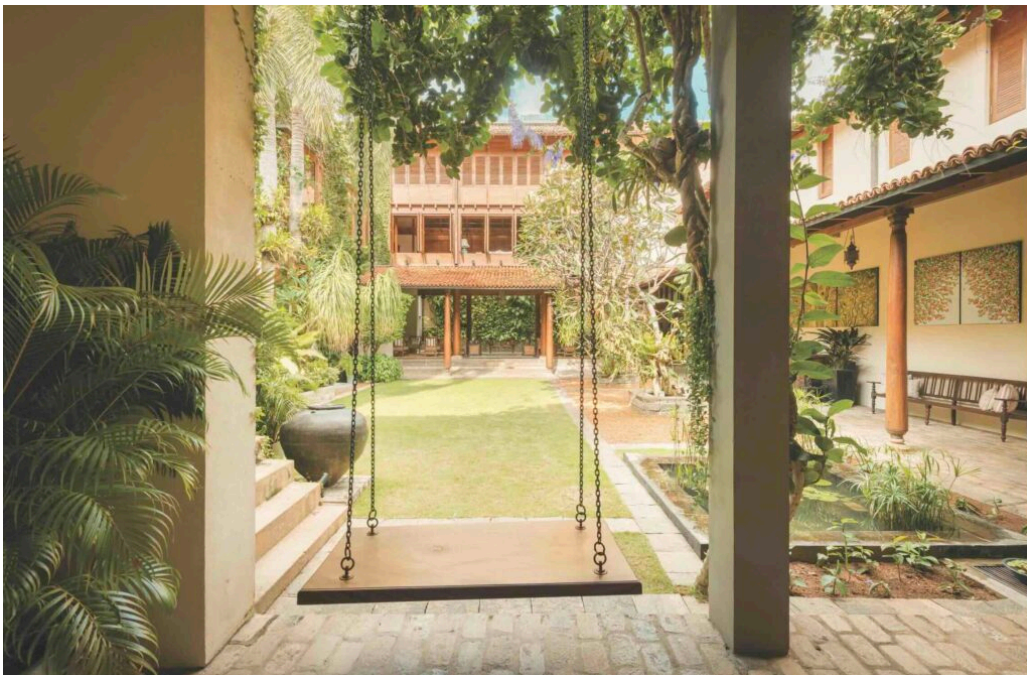
Timeless design. Curated detail. Ishq Colombo is where architecture becomes art.