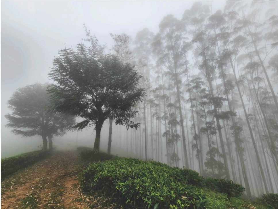
Eucalyptus trees shrouded in a veil of calm.

Words and Photography Foster and Partners.