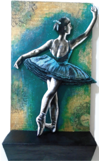
'Crossed - Ballet Term' 3D mural by Kouwshigan.