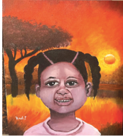
African beauty by Kriti.