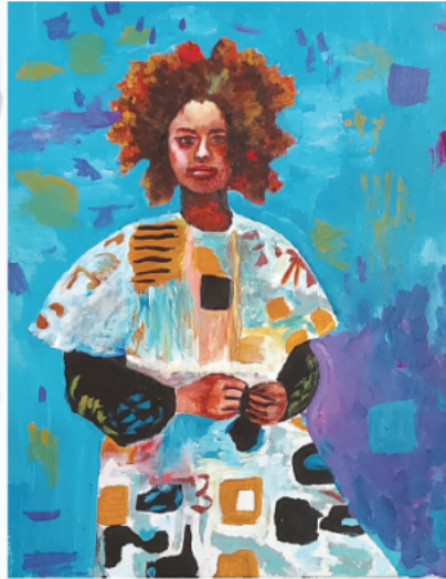
Dark Chocolate by Joshitha.