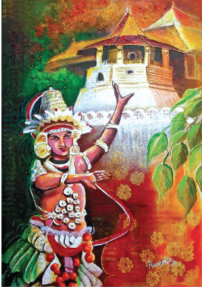
Dazzling Kandyan dancer.