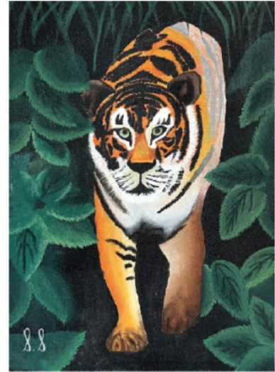
From the Woods by Swathi.

“Delightful Colours” was a teacher-student collaborative exhibition of paintings in rich, evocative colors.