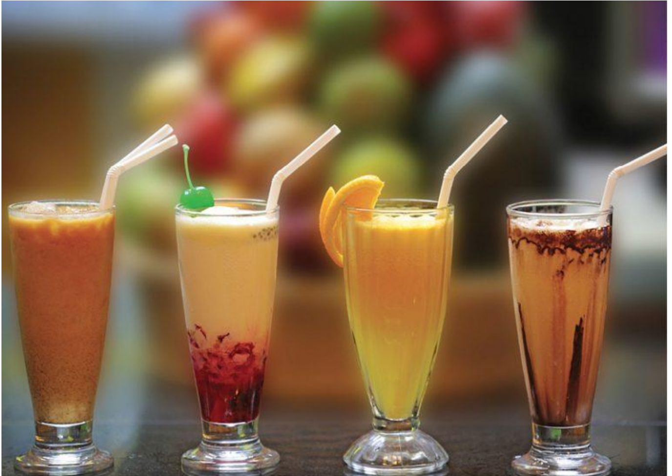
Chilled shakes to douse the heat

Roots has established itself as an authentic juice and ice cream sundae bar with great value and greater taste.