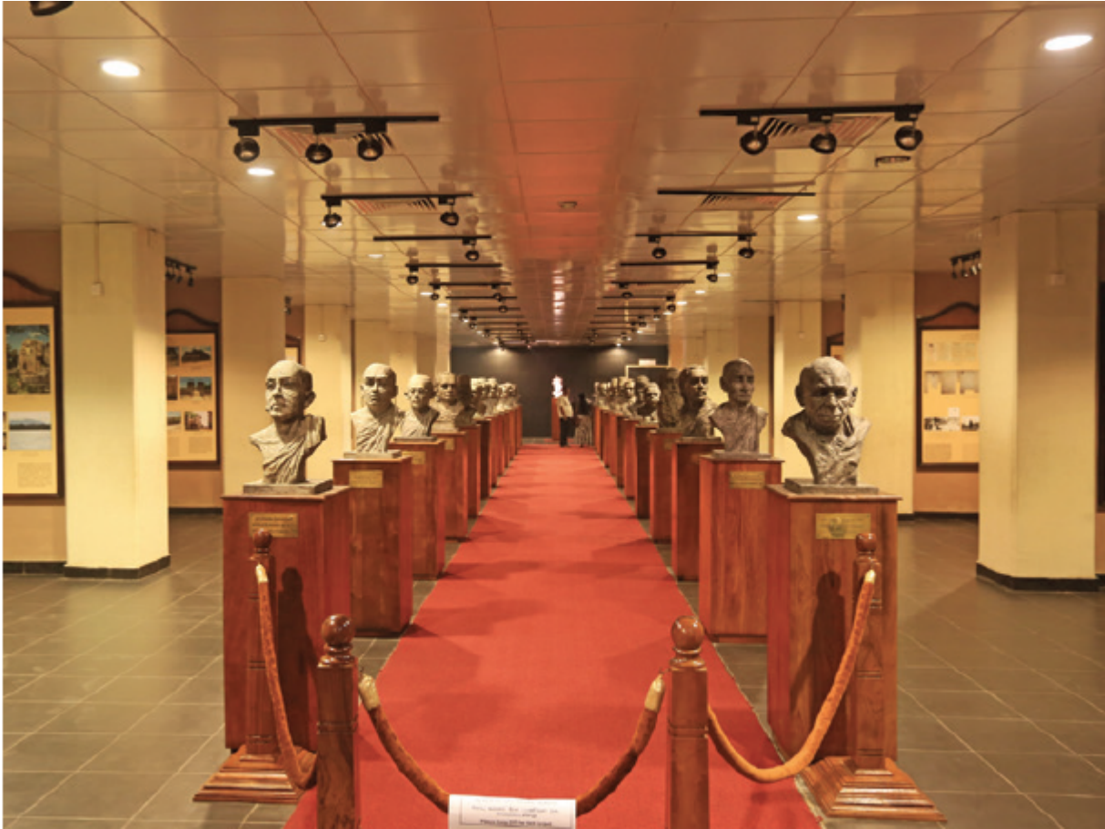
Sculptures of the Independence Activists at the museum.