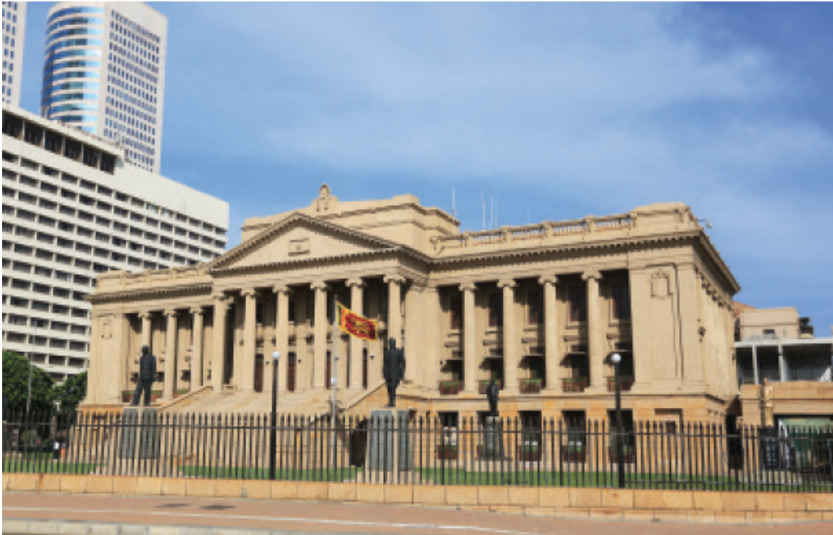
The classical façade of the Old Parliament building.

small and the relocation was discussed. It later moved to Sri Jayewardenepura in 1982. However, the glowing classical edifice that looks on deep into the Indian Ocean continues to play an important role. It is now the Presidential Secretariat and Office of the Executive President.