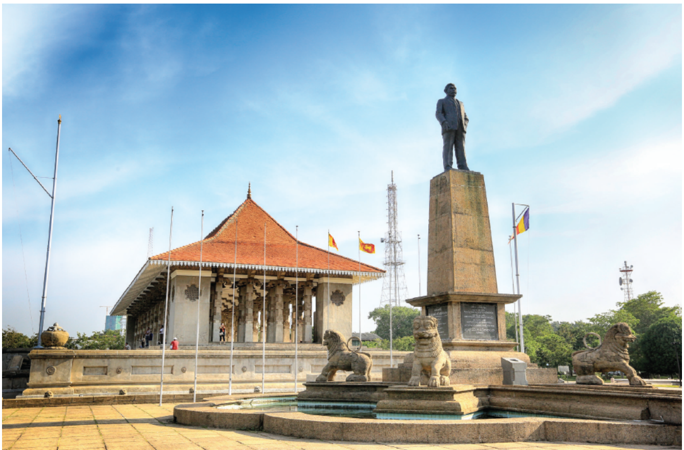
The Independence Memorial Hall and monument for the Father of Sri Lanka.

Traveling through Independence Avenue, motorists take a bend that results in a momentary pause of respect before the statue of the first Prime Minister of Sri Lanka, D S Senanayake, and the monument built to commemorate the Island's hard-earned independence.