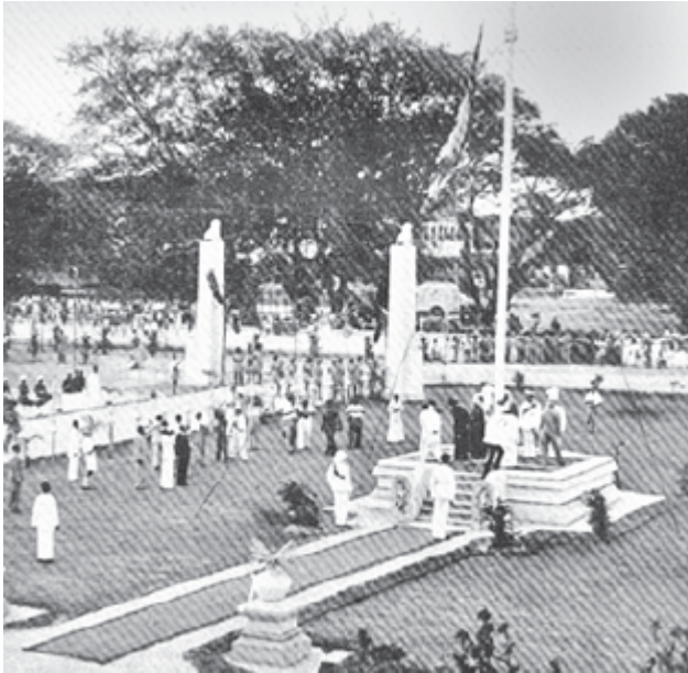
The hoisting of the Lion Flag on February 4, 1948.