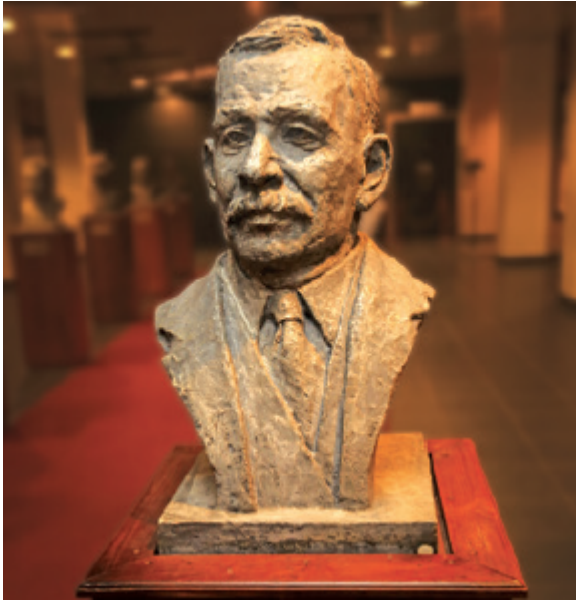
A sculpture of Premier D S Senanayake at the Independence Memorial Museum.