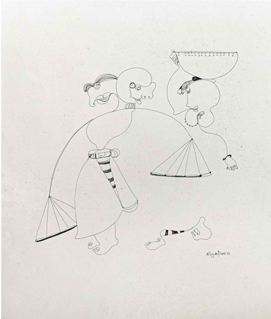
The graceful curve of the line flows over the paper, a dynamic expression that resonates with life (1973).