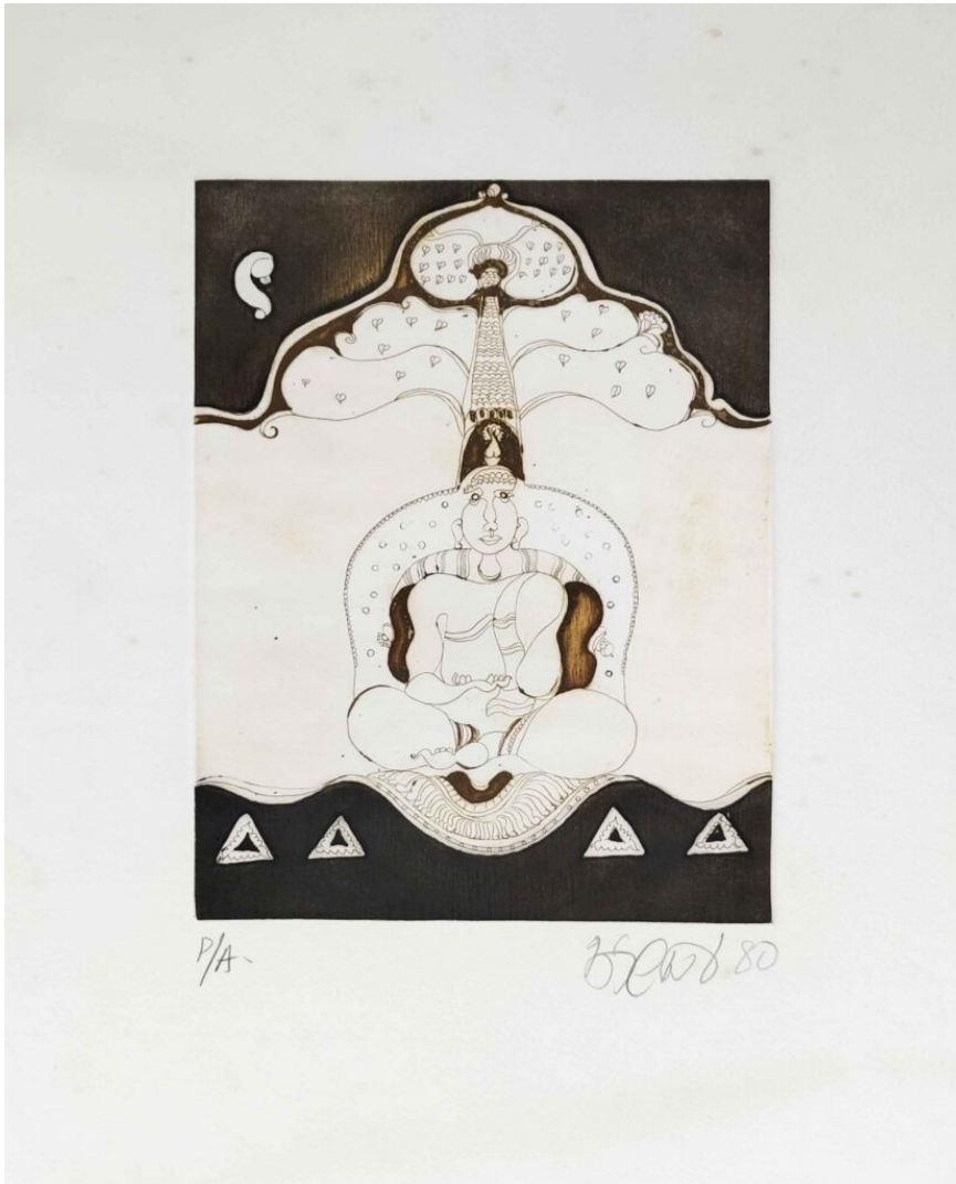
A line drawing boasts a captivating aesthetic that seamlessly combines sharp, dynamic lines with intricate details (1980).