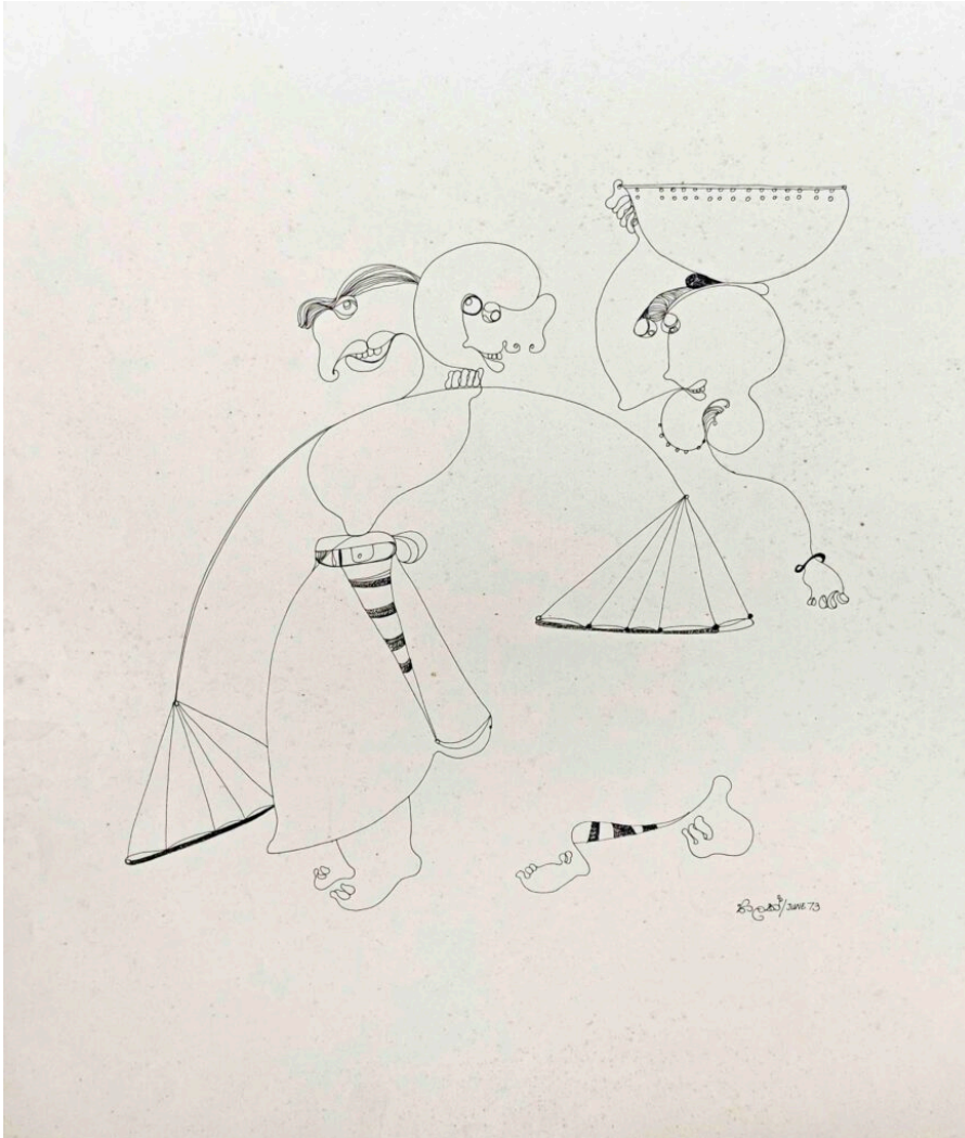
The graceful curve of the line flows over the paper, a dynamic expression that resonates with life (1973).