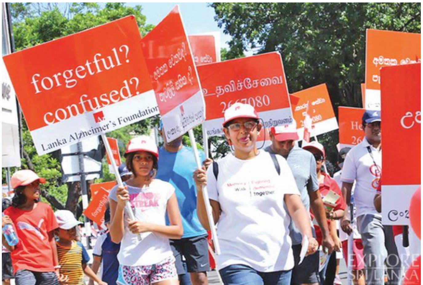
Age does not matter, all enjoy the walk