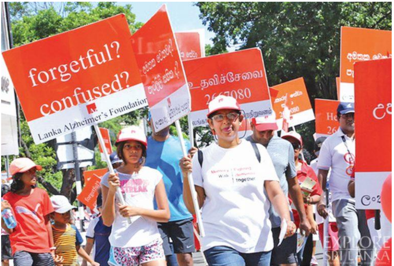
Age does not matter, all enjoy the walk