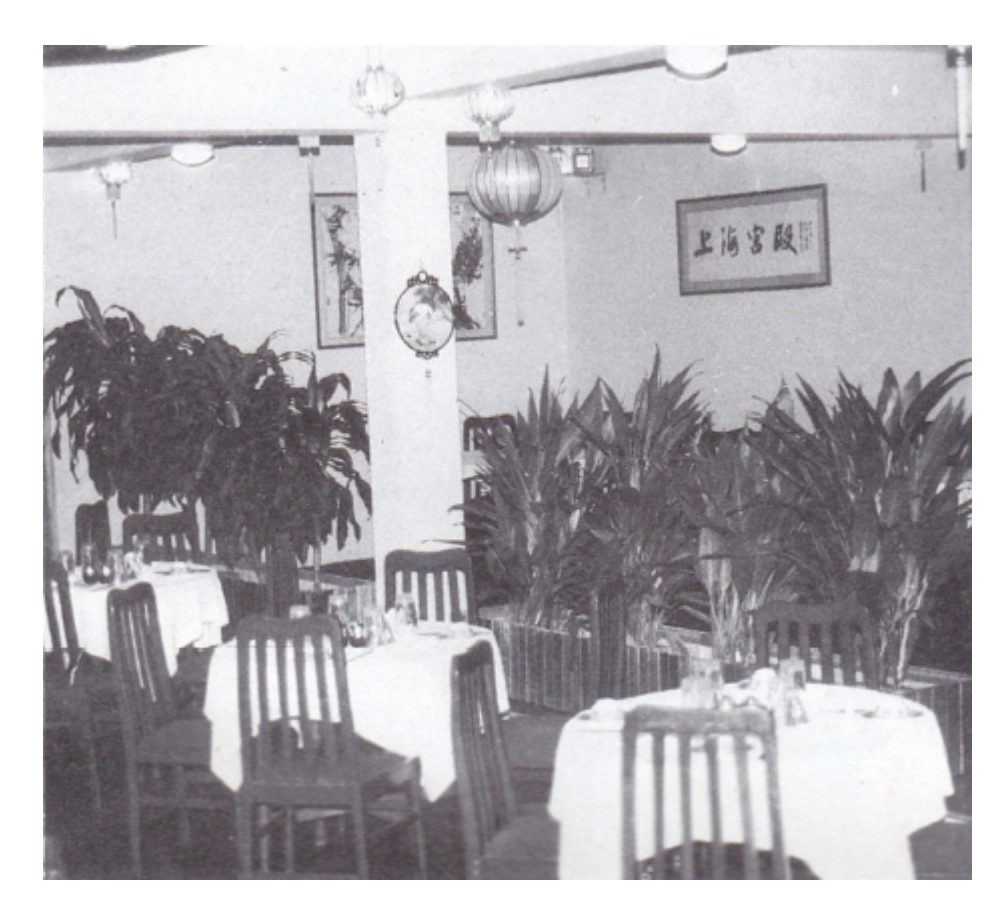
Setting for a royal repast.

respectively. Moreover, for a two-night stay each guest receives Rs. 500 in free play coupons at the casino and for a five-night stay Rs. 750, collectable in amounts of Rs 250 per day but playable whenever you wish. Included in this package you also get discounts at the hotel's health club and coffee shop and on the entrance to the Peacock Night Club which has live music on Friday and Saturday nights. You can make your reservations by calling 714001-3 or 71580. So if you're bored with your usual haunts in Colombo and want to get away for a day, an evening, a weekend or longer, escape to Mt. Lavinia where you can dine in style at the Royal Palace Restaurant, play the night away at the Casino Royale Club and spend sunny days on the beach or at the poolside at the Mt. Royal Beach Hotel. It's the place to be pampered in royal style.