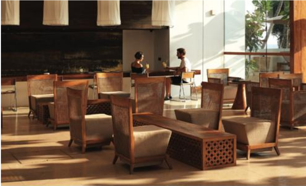
Unwind in the spacious and stylish lobby bar and lounge.