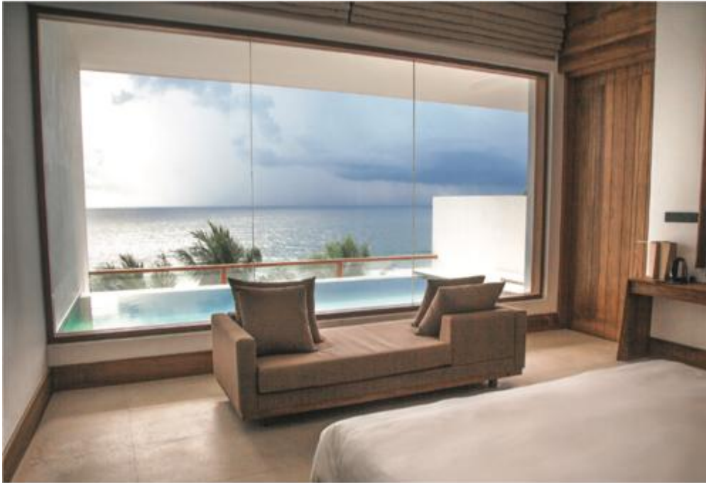
The epitome of luxury, the Presidential Suite.