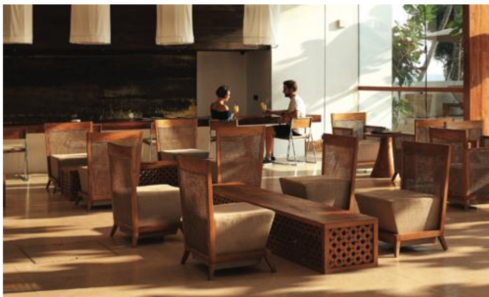
Unwind in the spacious and stylish lobby bar and lounge.