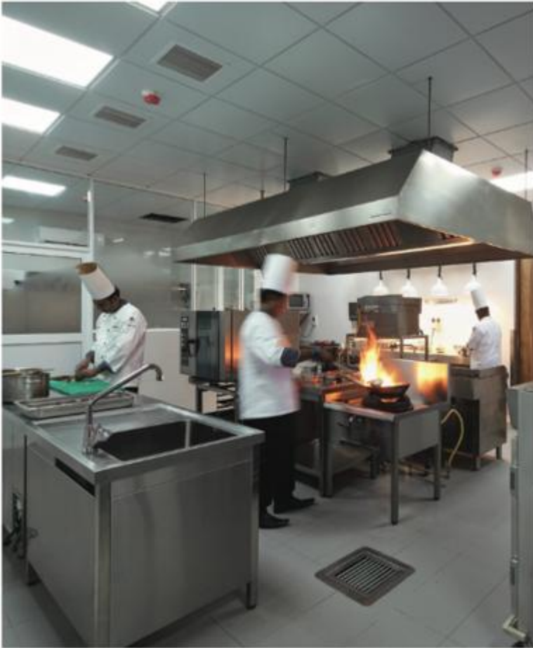
Watch the live action.