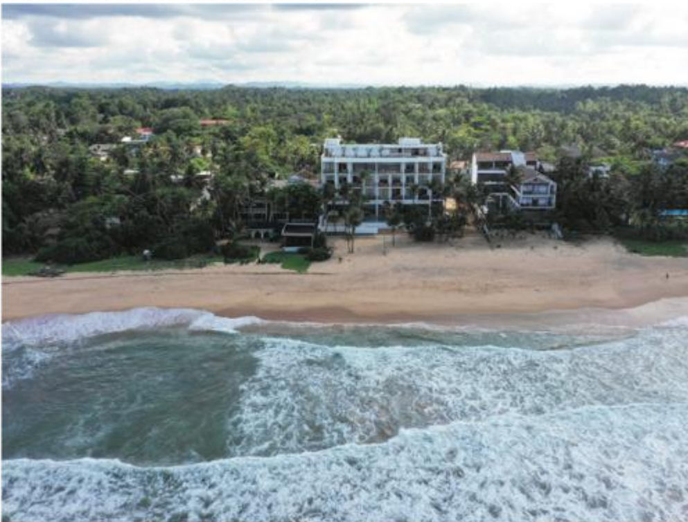
Riff Hikkaduwa is a beach front property providing the ideal surroundings for a holiday.