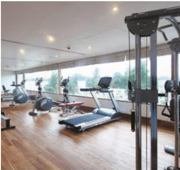
work out at the well-equipped gym.