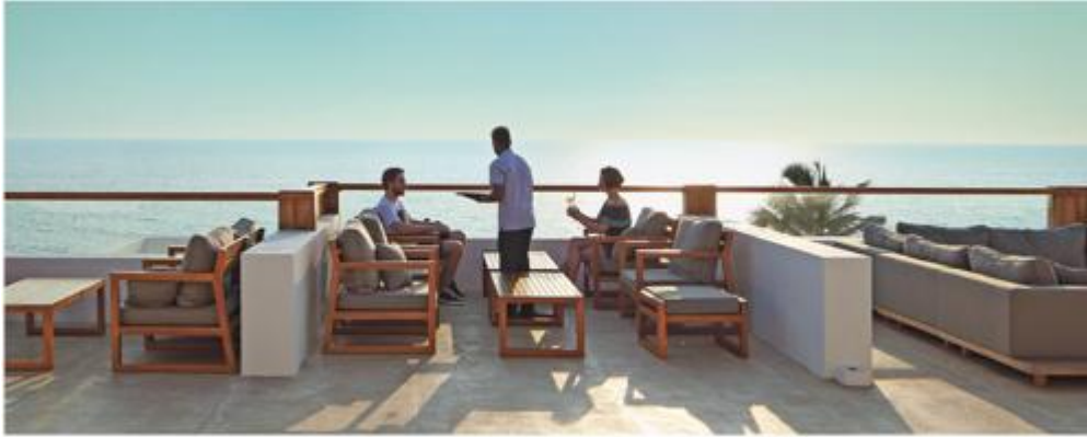
Indulge in breathtaking views of the coastal paradise from the rooftop bar.