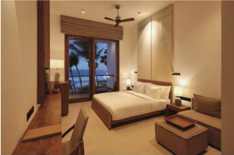
Deluxe room furnished with subtle tones and comfortable spaces.