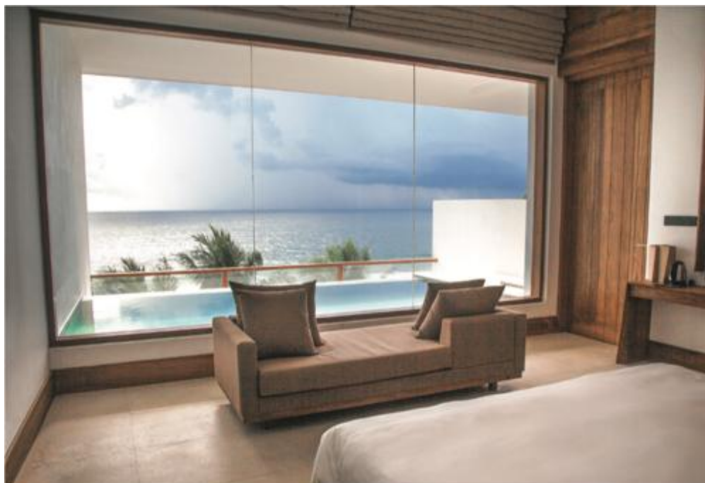
The epitome of luxury, the Presidential Suite.

870 Colombo-Galle Main Road Hikkaduwa (+94 91) 227 4440 reservations@riffhikkaduwa.com riffhikkaduwa.com