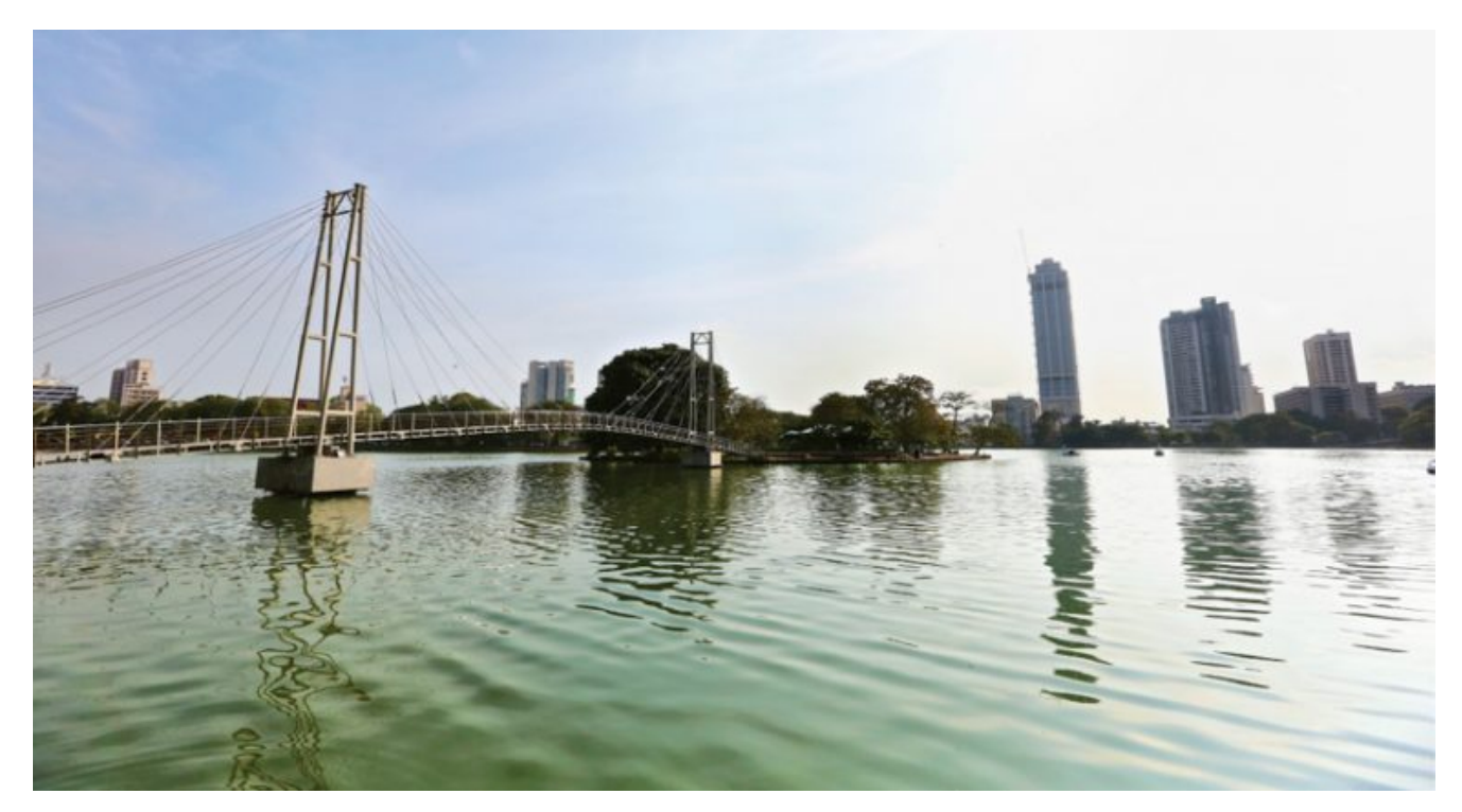
The Beira Lake today against a modern skyline

The largest was Slave Island, so-called because the slaves from Goa who worked in Dutch houses during the daytime were transported there for the night. Captain's Garden, the elevated area where the oldest Hindu temple in Colombo, the Sri Kailasanathar Swamy Devasthanam, is located, was also an island. It had a rare well, from which water was distributed around the city by means of bullocks laden with two leather 'puckauly bags', which were made from an entire ox-hide, each holding 20 gallons (1 gallon = 3.8 litres).