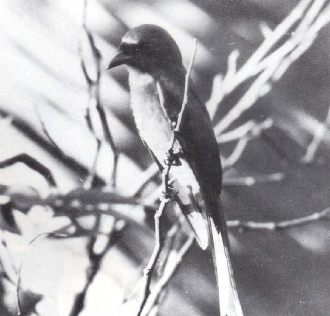
A Drongo resting on a branch after one of its swift flights.