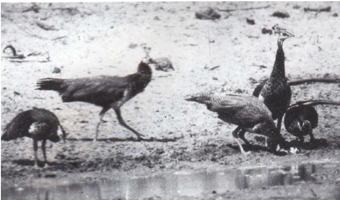
Y01mg peafowl foraging for food at a water-hole. (Fred. R. Malvenna).