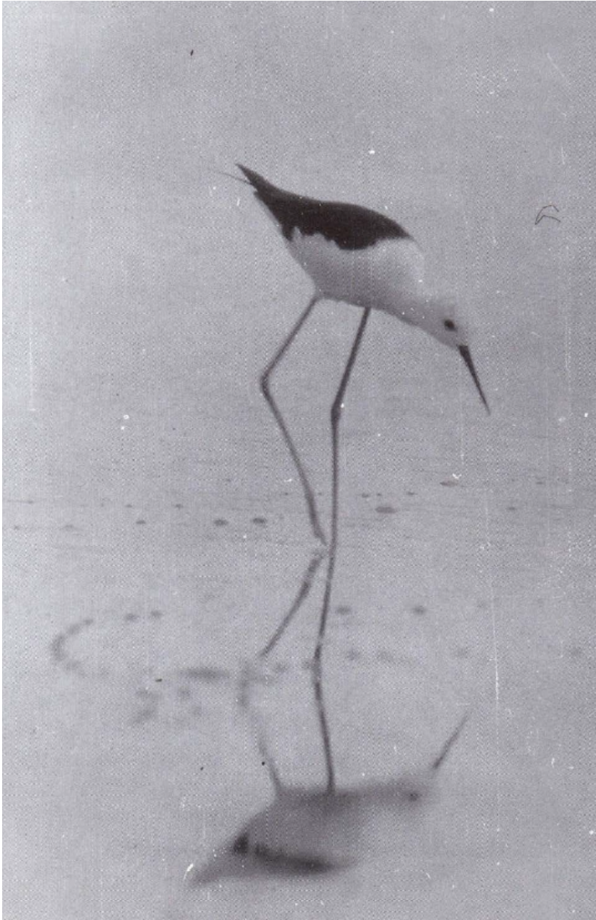
Black Winged Stilt keeps a sharp eye open for it's food.