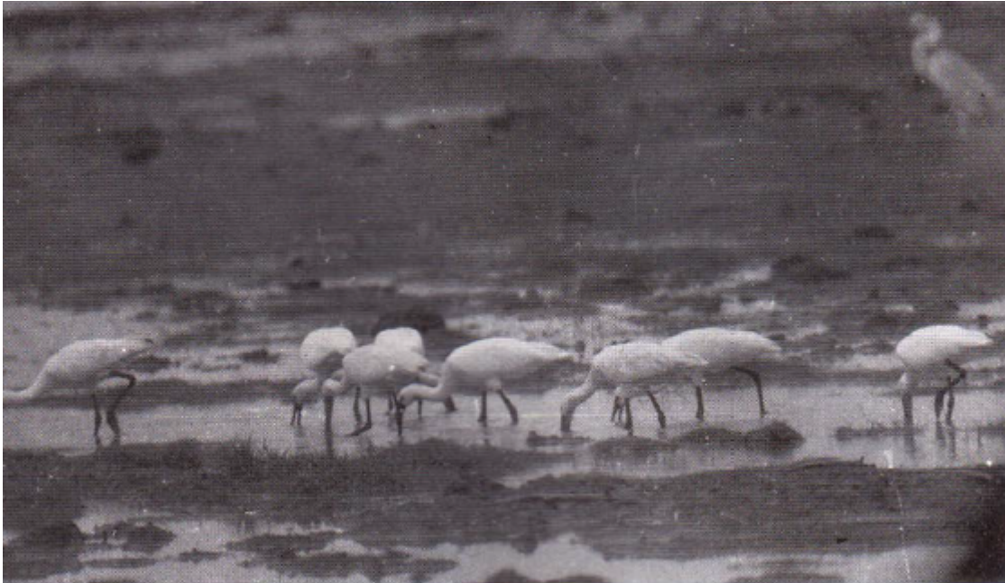
Flocks of spoonbills such as these are a common sight at Yala. (Fred. R. Malvenna)