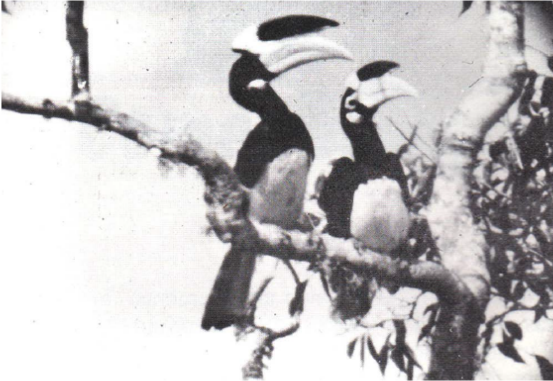
A pair of colourful Malabar Pied Hornbill perched on a branch, at Ya/a National Park.