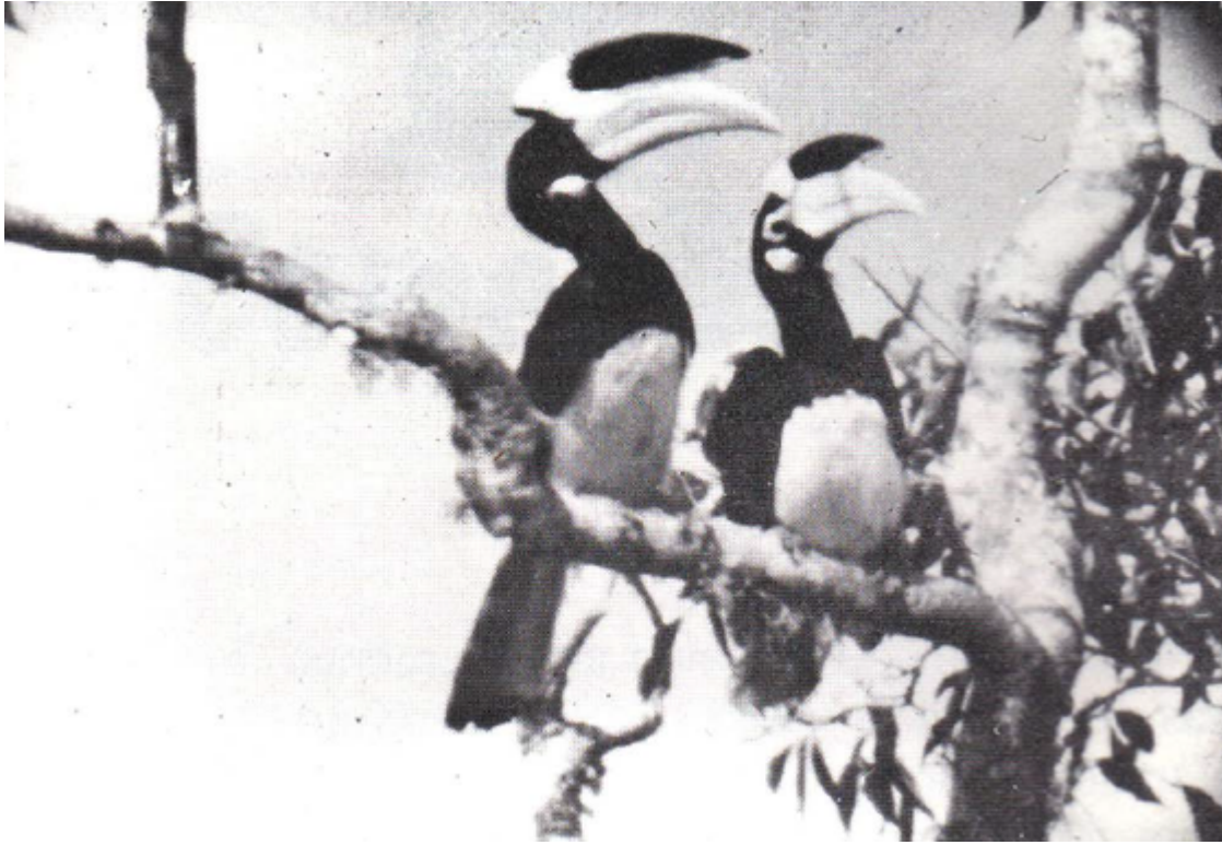
A pair of colourful Malabar Pied Hornbill perched on a branch, at Ya/a National Park.