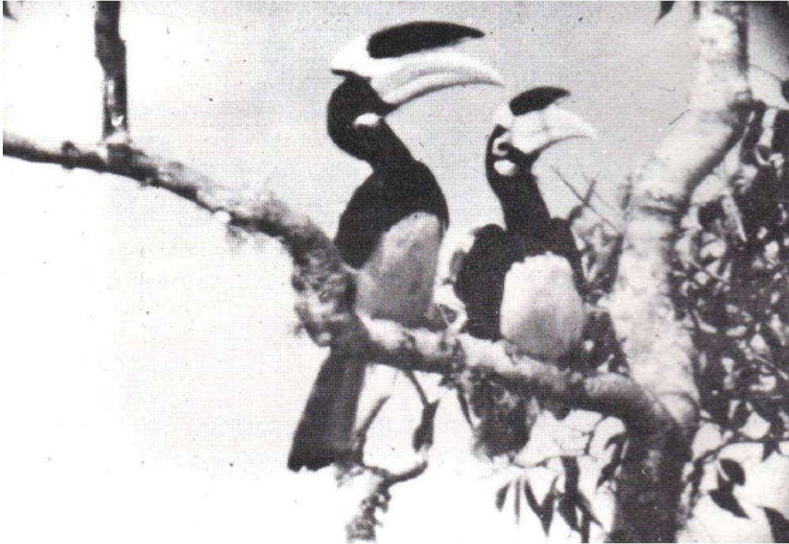
A pair of colourful Malabar Pied Hornbill perched on a branch, at Ya/a National Park.