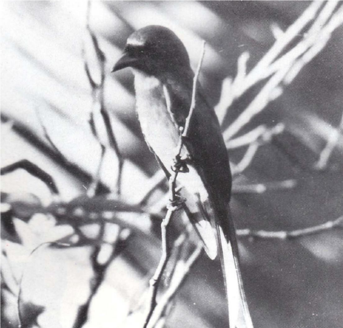
A Drongo resting on a branch after one of its swift flights.