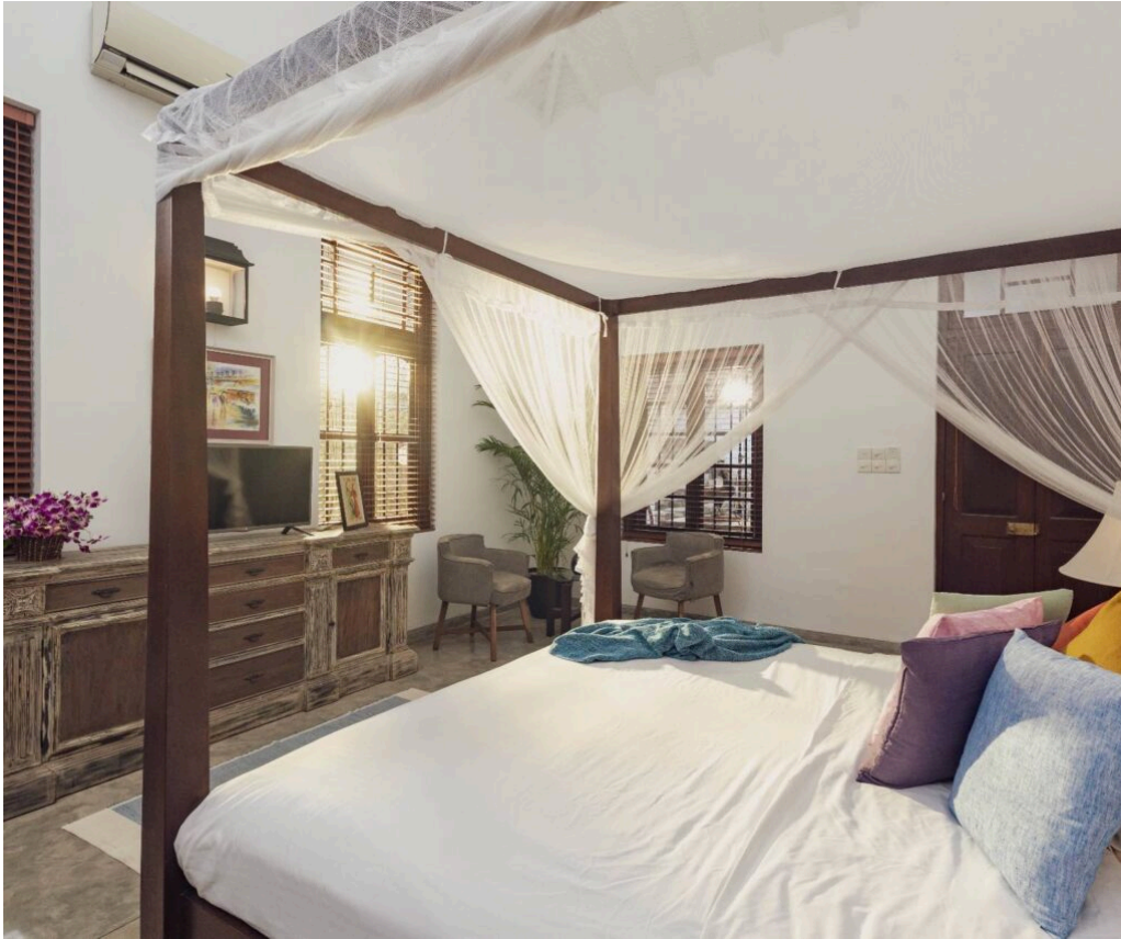
Premium double room - Every detail is deliberately beautiful.