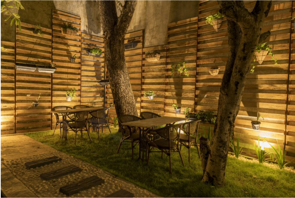
The Secret Garden - perfect for an intimate dinner, providing a romantic ambiance that transforms an ordinary evening into a magical experience.