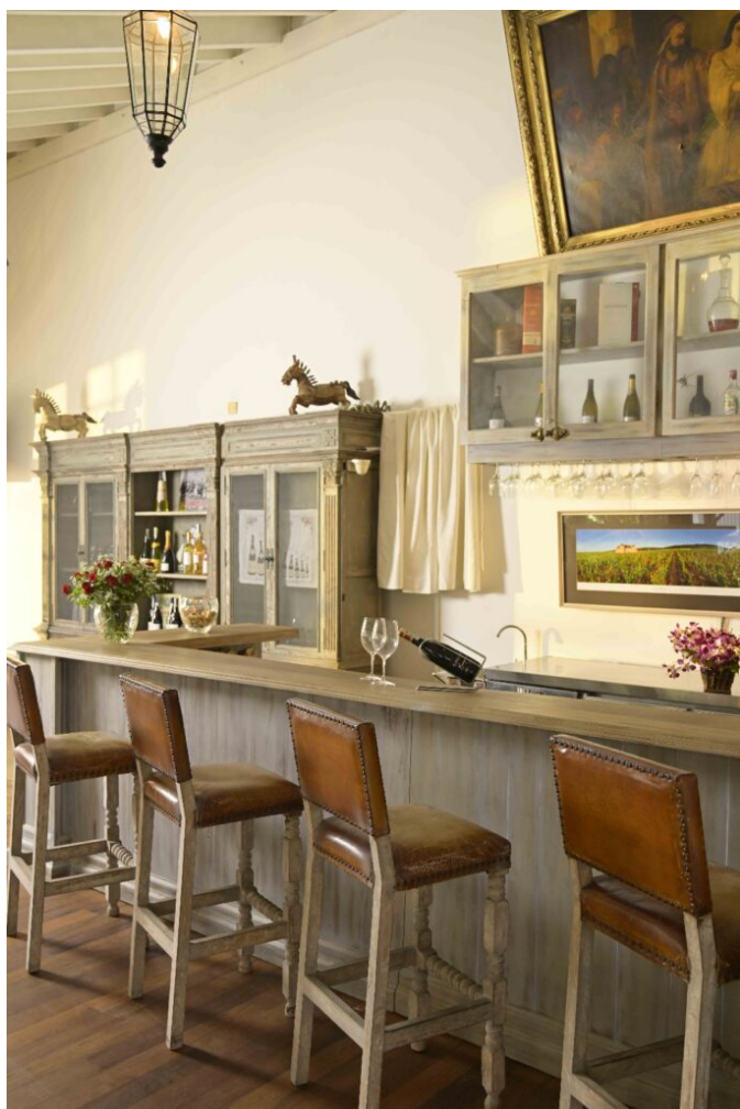
Sips served with style - The Bar.