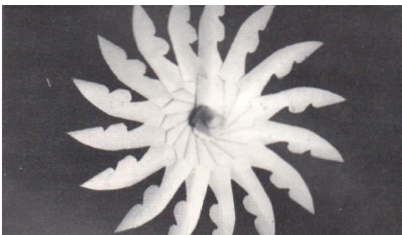
A gokkola spin wheel – intricately cut and shaped by skilful hands.

The next time you see an open coconut flower, fresh out of its spathe, placed in a clay pot which is covered with scalloped “gokkola”, take a closer look at the simple lines of the decorative piece, and also look around to discover the many other examples of “gokkola” decor which will be around. You will marvel at what the unknown craftsmen have achieved in this functional and disposable art form.