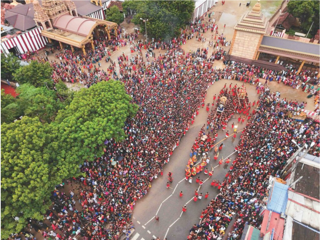
The Nallur Kandaswamy Temple is an iconic destination for the celebration of Kanda Sashti. The event reaches its peak on the final day with Soorasamharam, a moment that draws countless devotees. This photo was taken in December 2024.