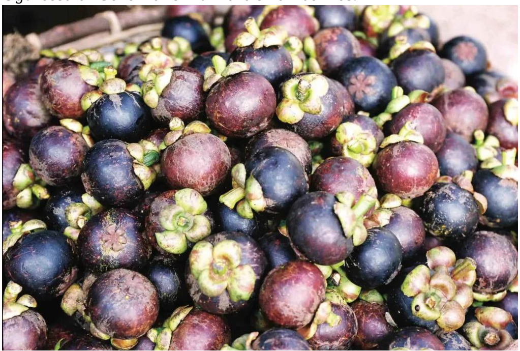
Grab a handful of plump mangosteens during the season.