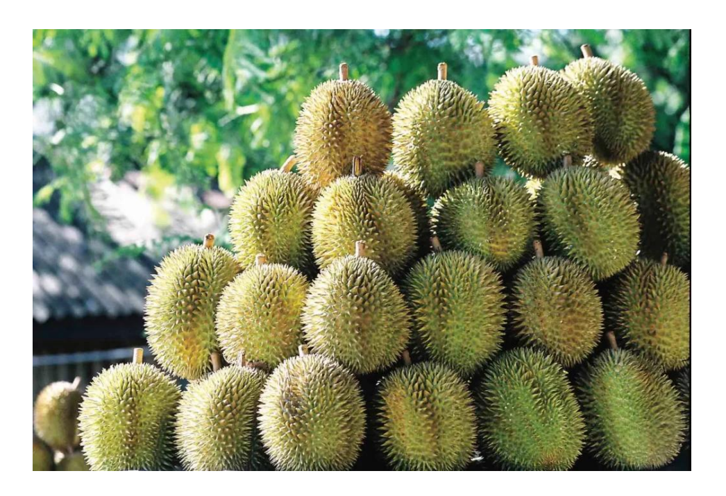
The King of Fruits - Durian will attract your attention with its strong odor.