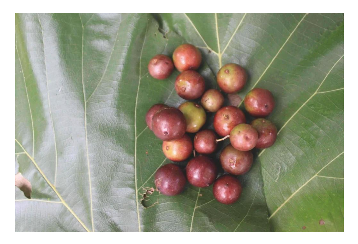
Uguressa or Governor's Plum are small berries.