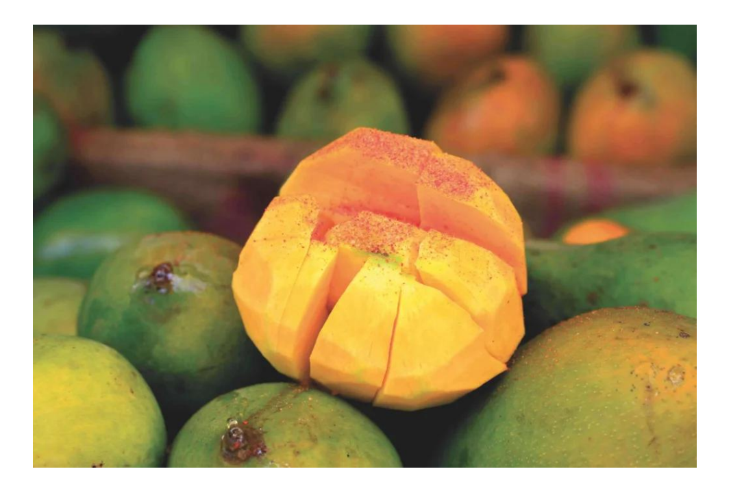
Relish in the sweet and spicy flavors of mangoes.