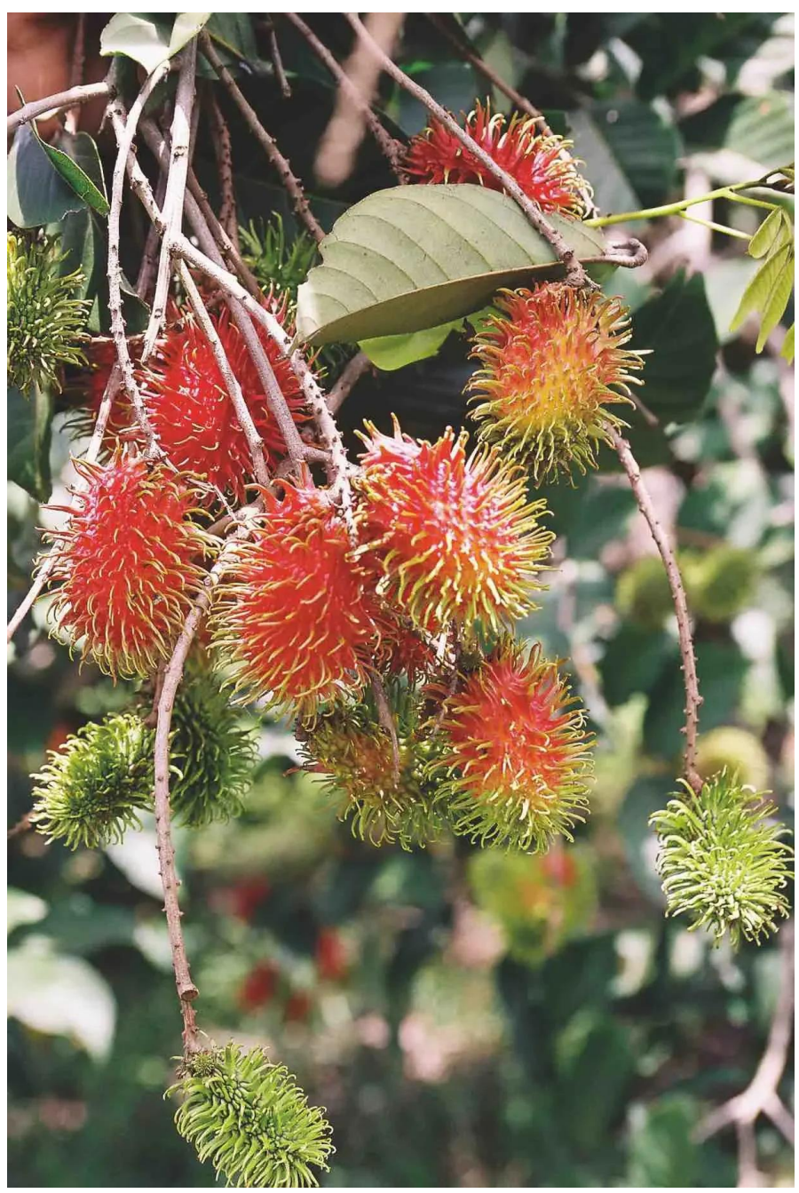
Awaiting for the Rambutans to ripe.