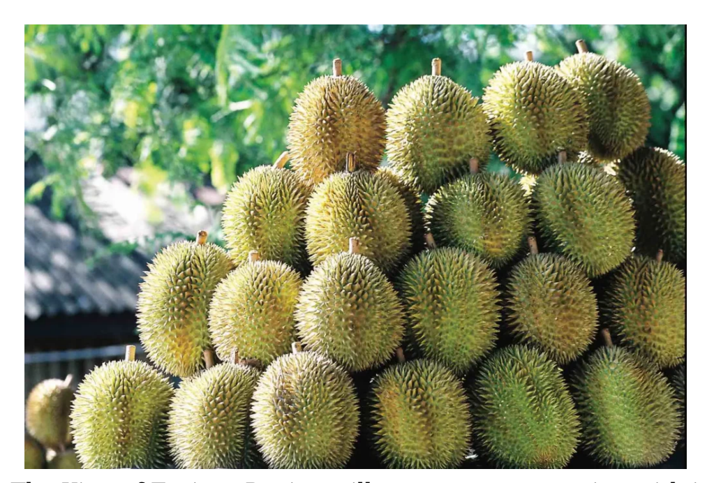
The King of Fruits - Durian will attract your attention with its strong odor.

Among the many fantastic experiences on the island, indulging in delightful summer fruits reflect the island's endemic nature and blessings. These tropical seasonal delights are heavenly treats of the island and are not to be missed.