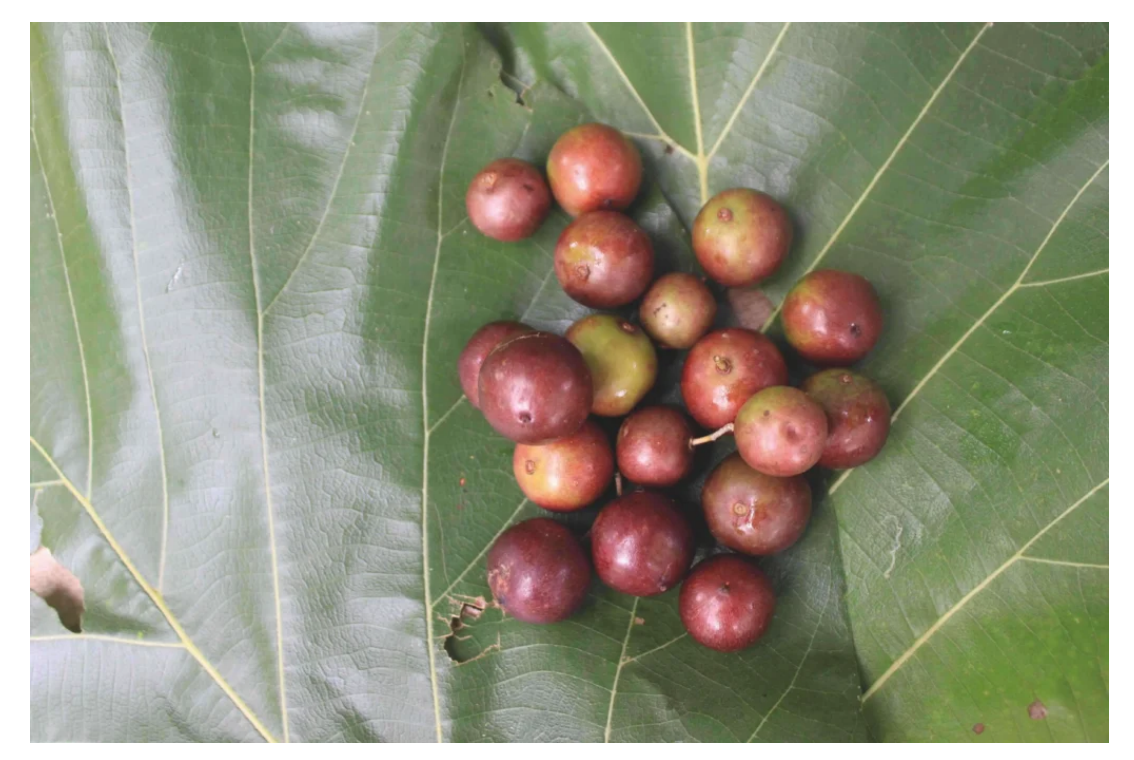
Uguressa or Governor's Plum are small berries.