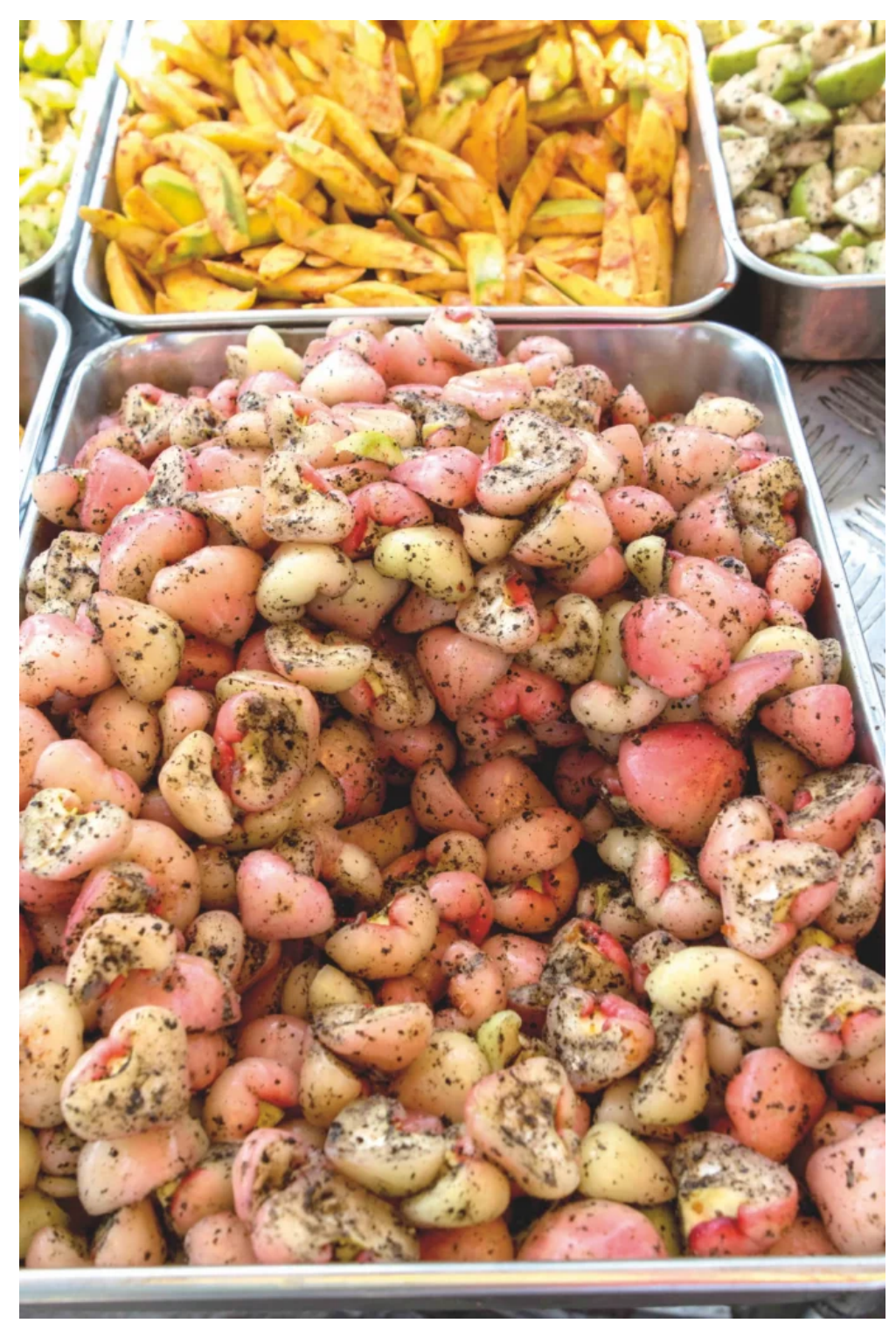
Jambu achcharu is a fusion of sweet and tangy flavors.