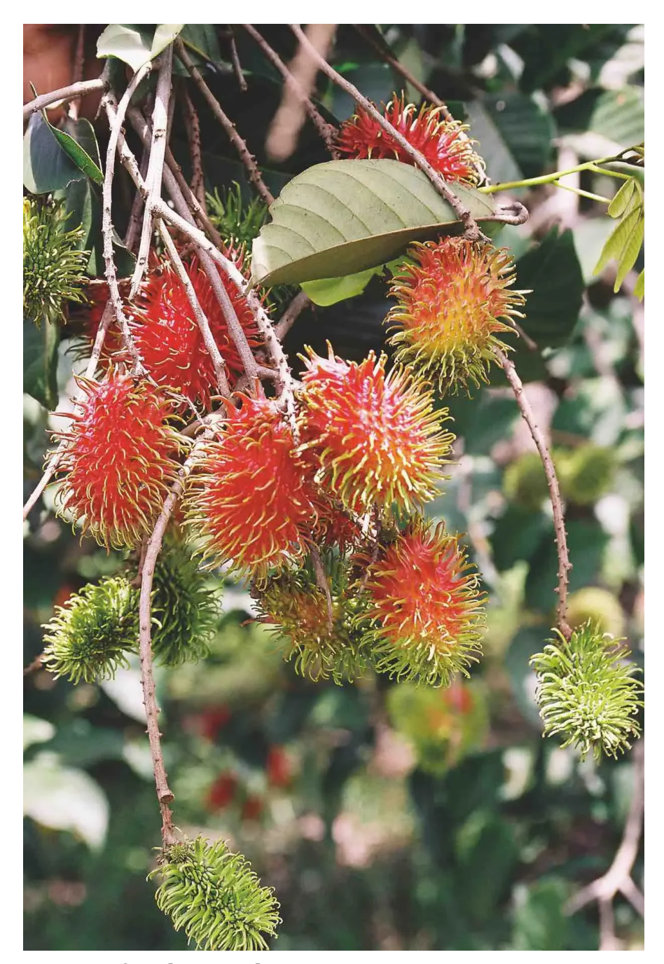
Awaiting for the Rambutans to ripe.