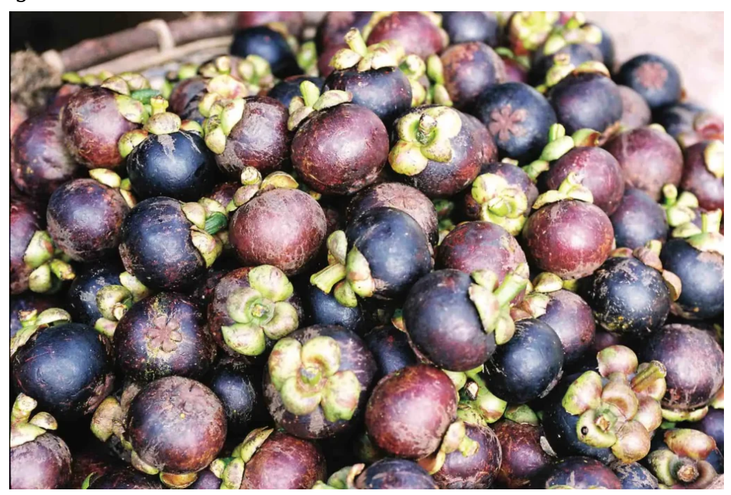
Grab a handful of plump mangosteens during the season.