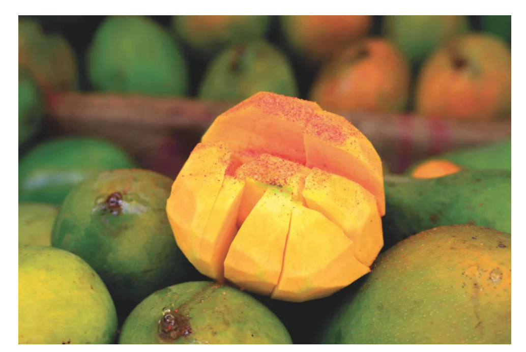
Relish in the sweet and spicy flavors of mangoes.