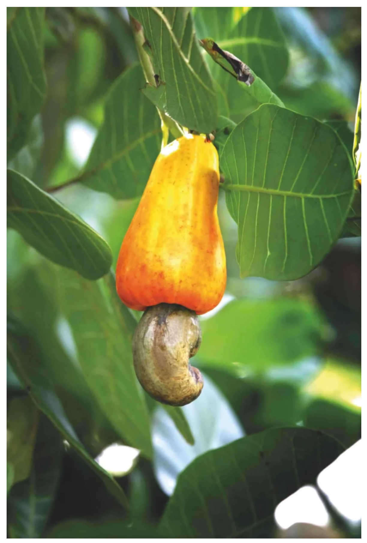
Kaju Puhulam (Cashew Apple)

Sri Lanka is a paradise for tropical fruits, and with the beginning of seasonal