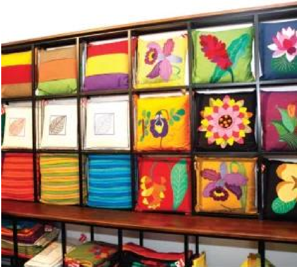
The 'Hands on Hands' collection