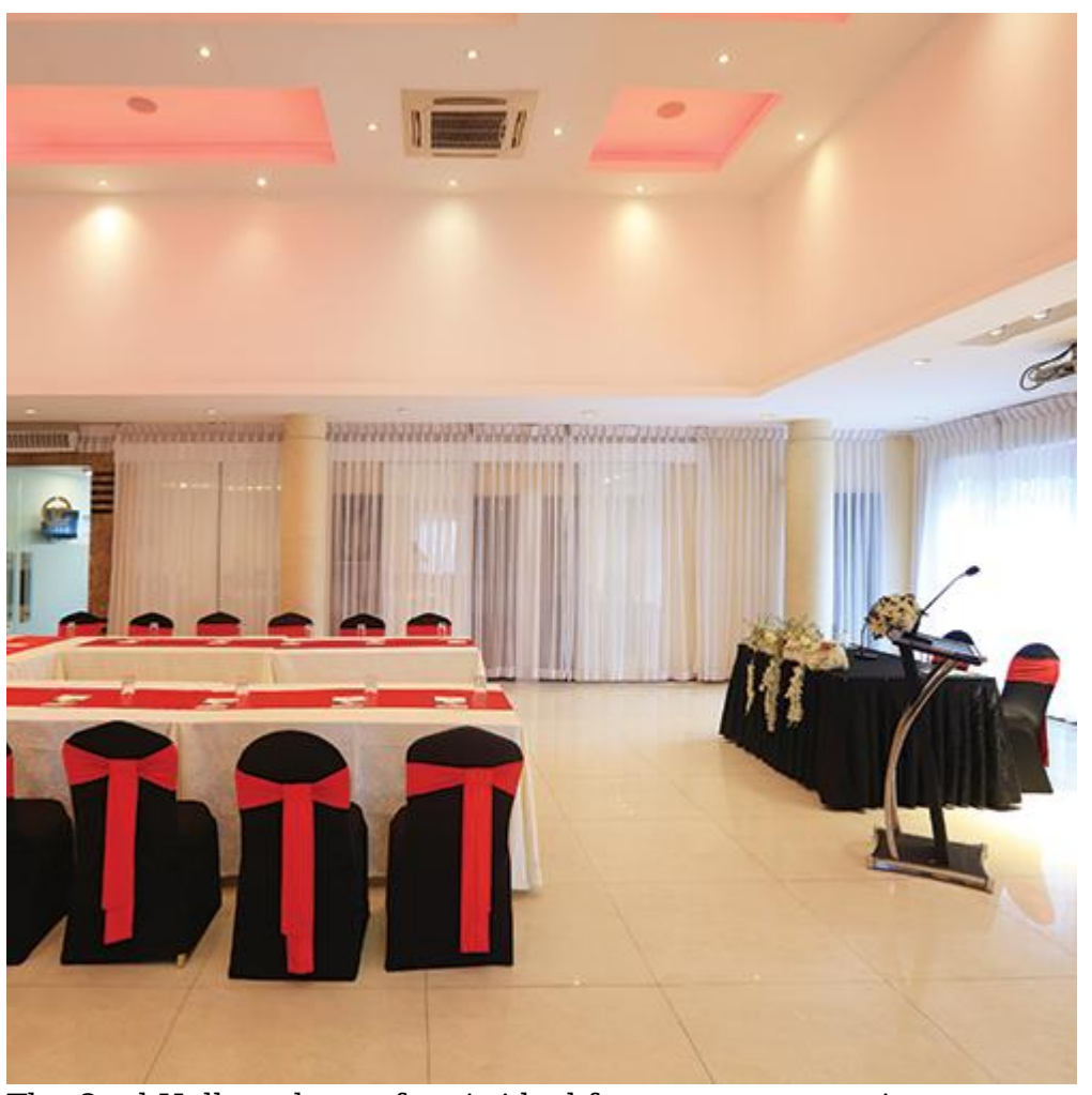
The Opal Hall on the rooftop is ideal for corporate meetings.