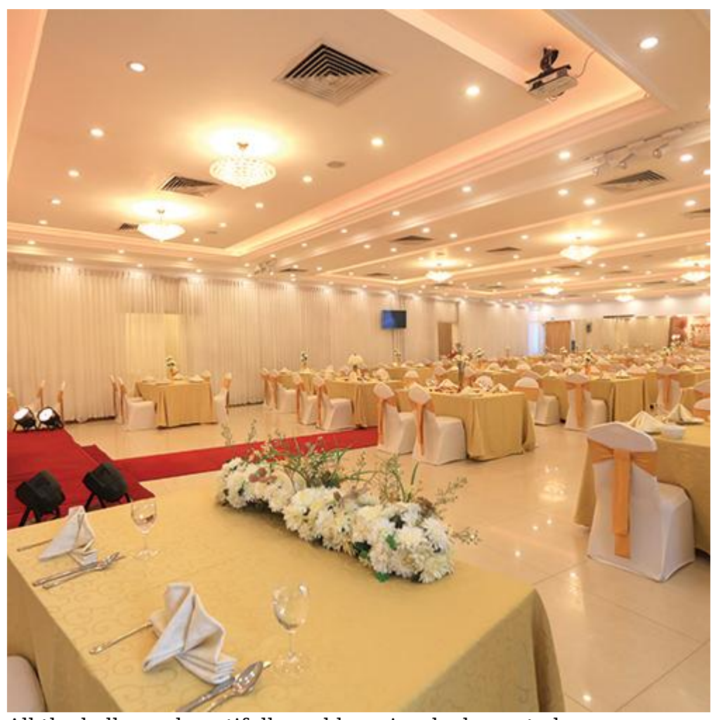
All the halls are beautifully and luxuriously decorated.