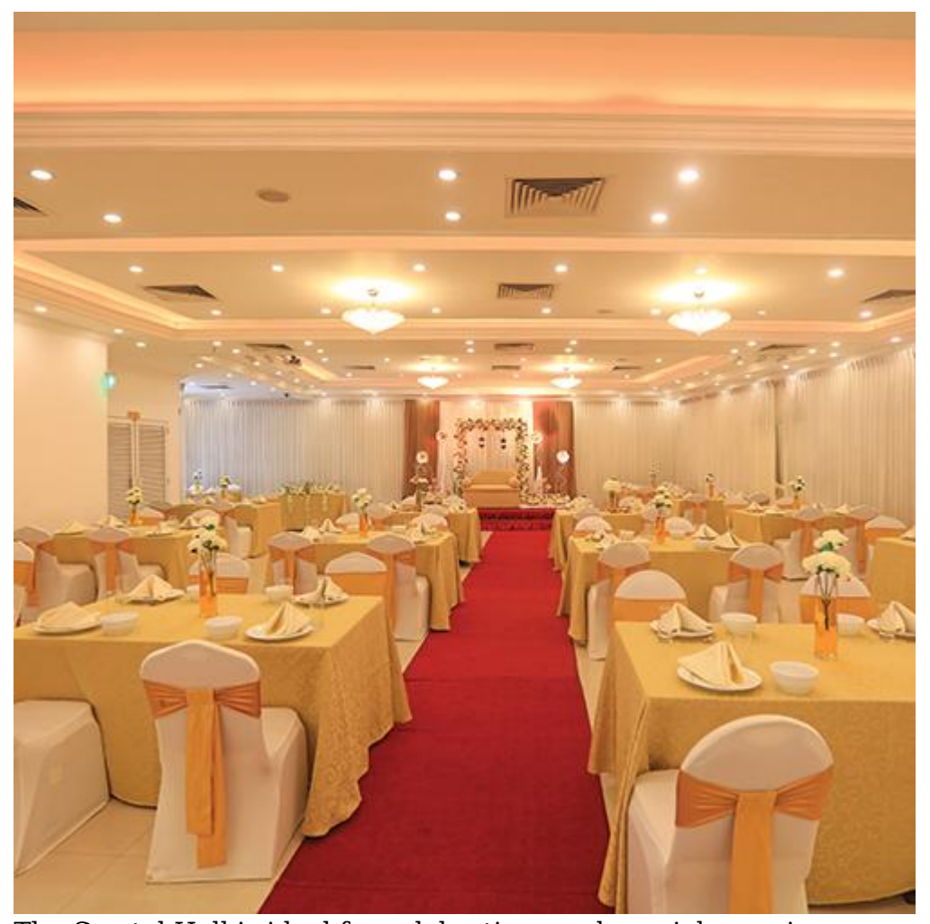
The Crystal Hall is ideal for celebrations and special occasions.