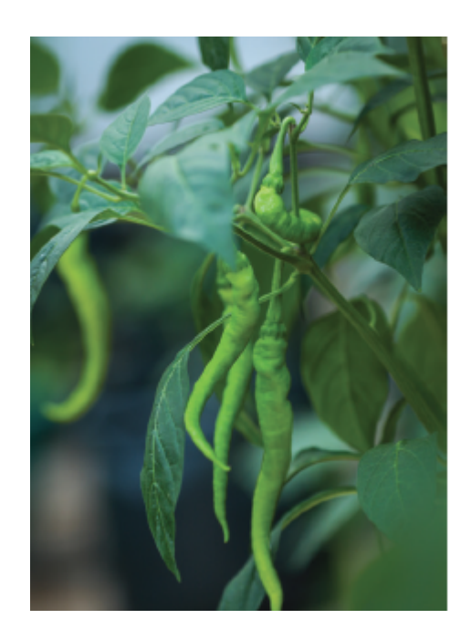
A variety of chili known as waraniya.