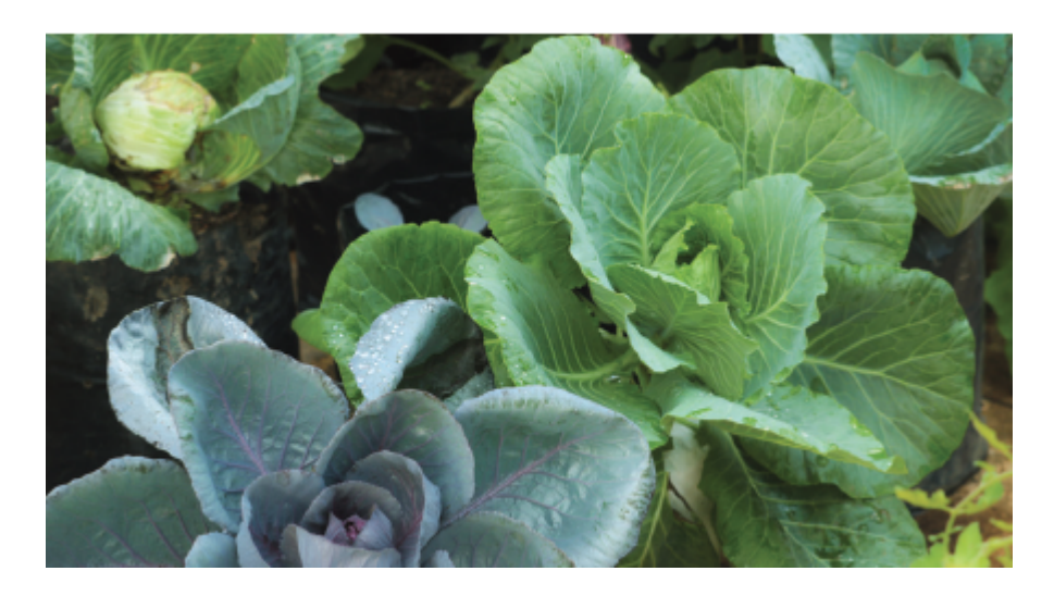
Red cabbage and green cabbage can also be grown.

Nivithi vines (Spinach) grow along the intwined ropes.