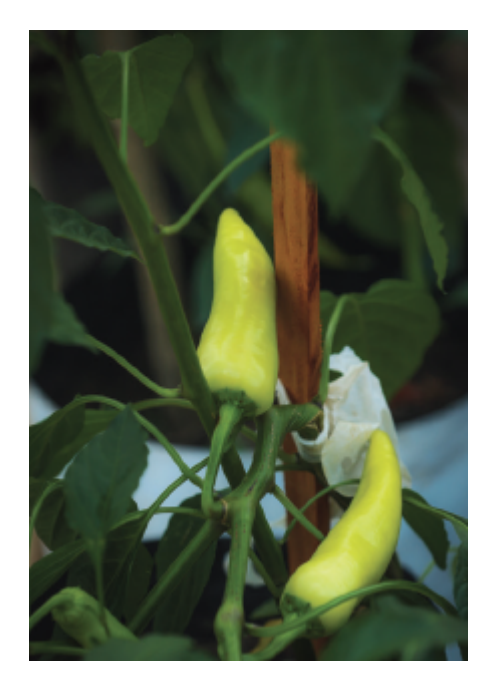
Beautifully green capsicums.