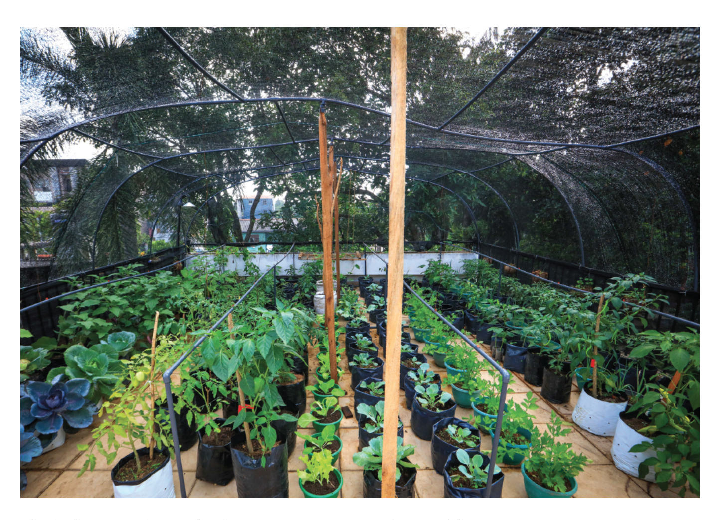
The lush green Sky Garden has over 20 varieties of vegetables.

Words Udeshi Amarasinghe.