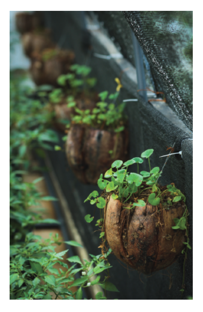
Nutritious greens such as gotu kola have been planted in coconut husks.