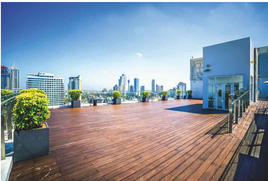
Skyline views and rooftop serenity.

Guests are welcomed not merely as customers but as individuals whose comfort and experience genuinely matter.