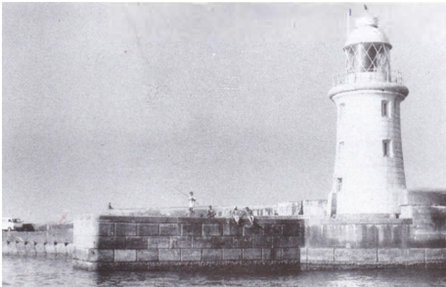
The South-west Breakwater of the Port of Colombo

The Anglers’ Club of Sri Lanka, situated at Chaitya Road near the Lighthouse, offers visitor facilities such as temporary permits to enter the breakwater, friendly advice and guidance for successful angling, and a great place to relax over a cool beer after a hard day’s fishing.