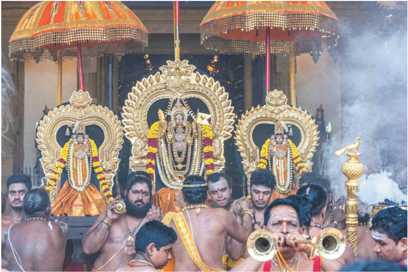
During the Manjam festival, Lord Murugan and his consorts are carried in a solemn procession.