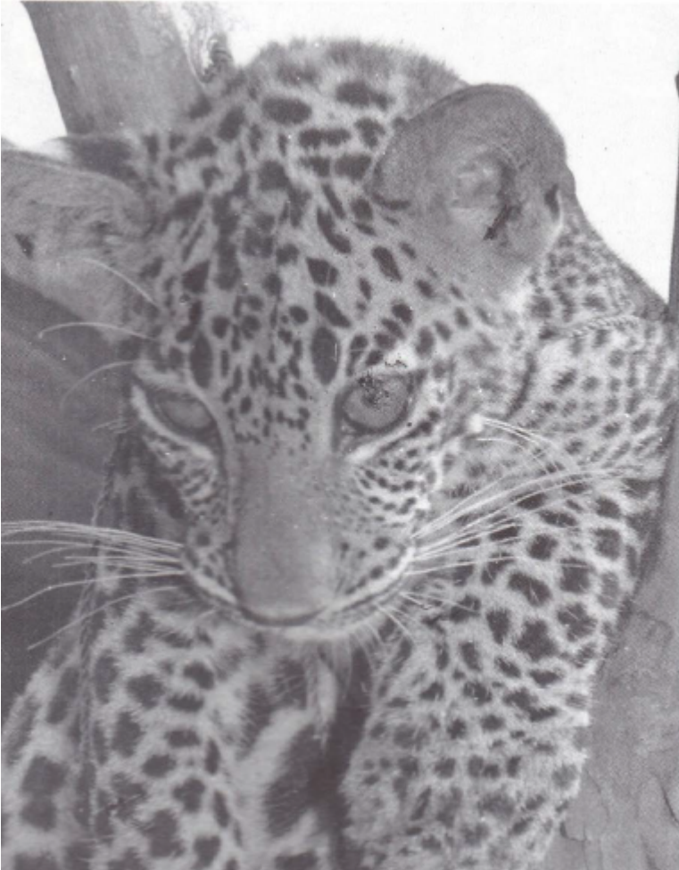
Getting his view from the top.