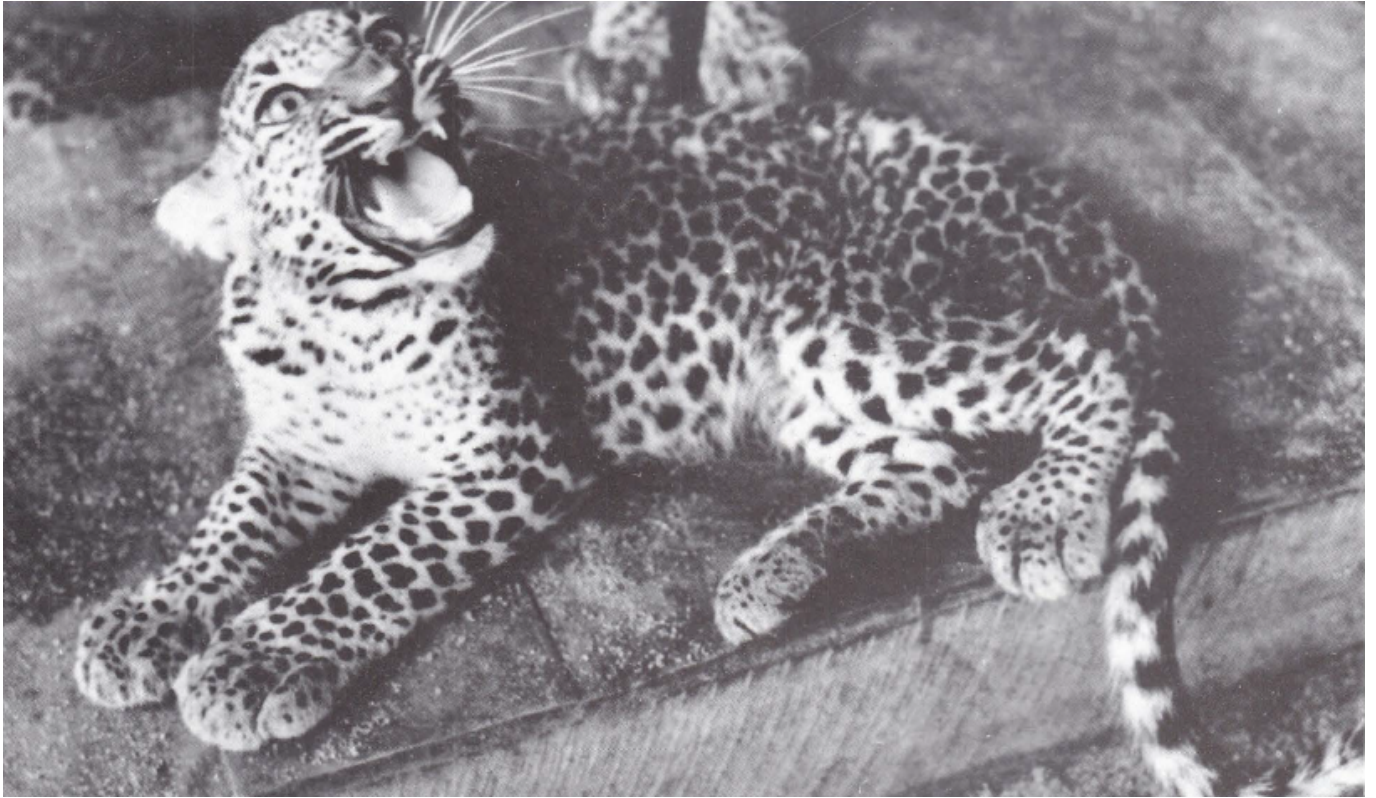
This spotted cub is in no friendly mood.